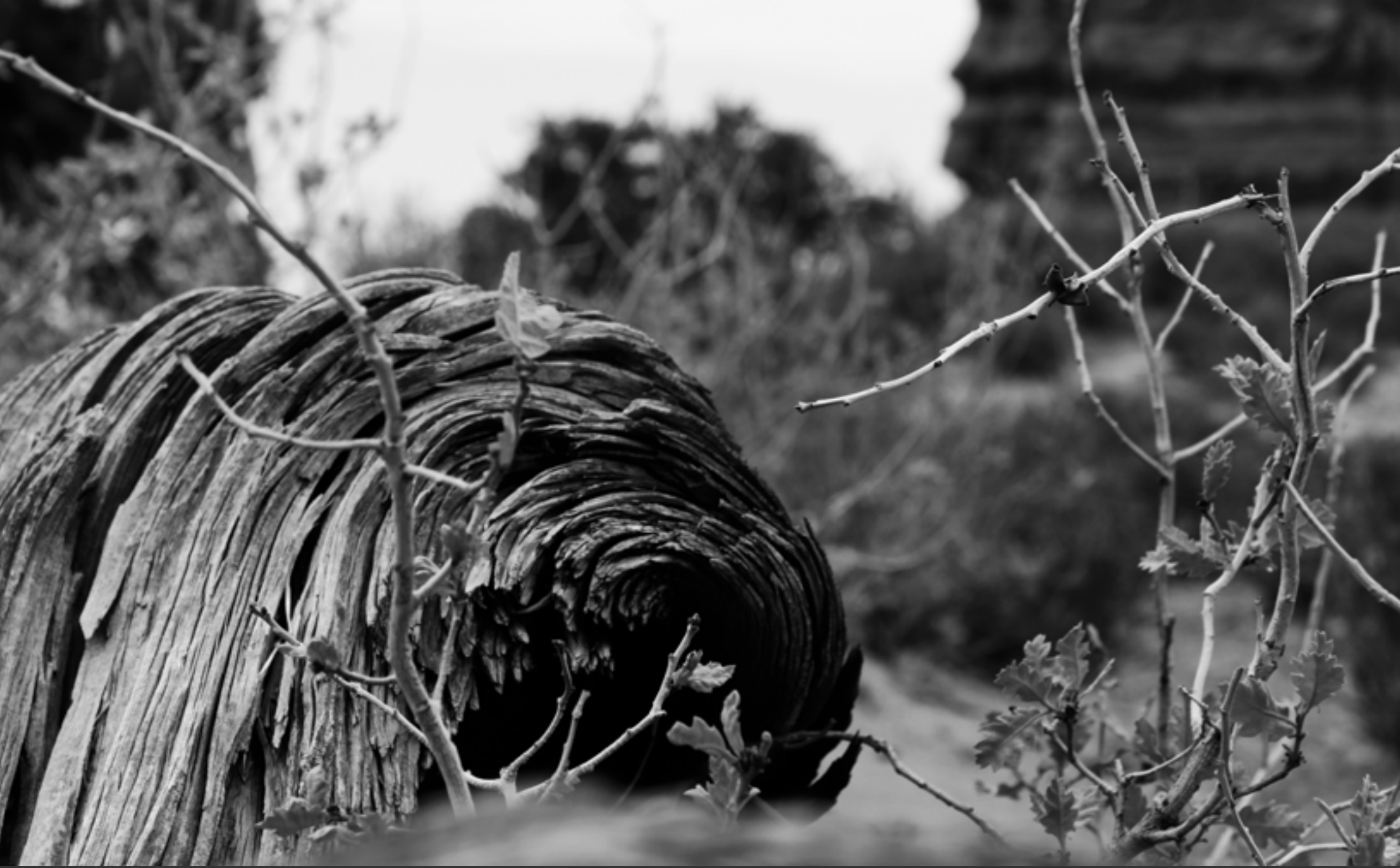
Fallen Tree, Arches National Park