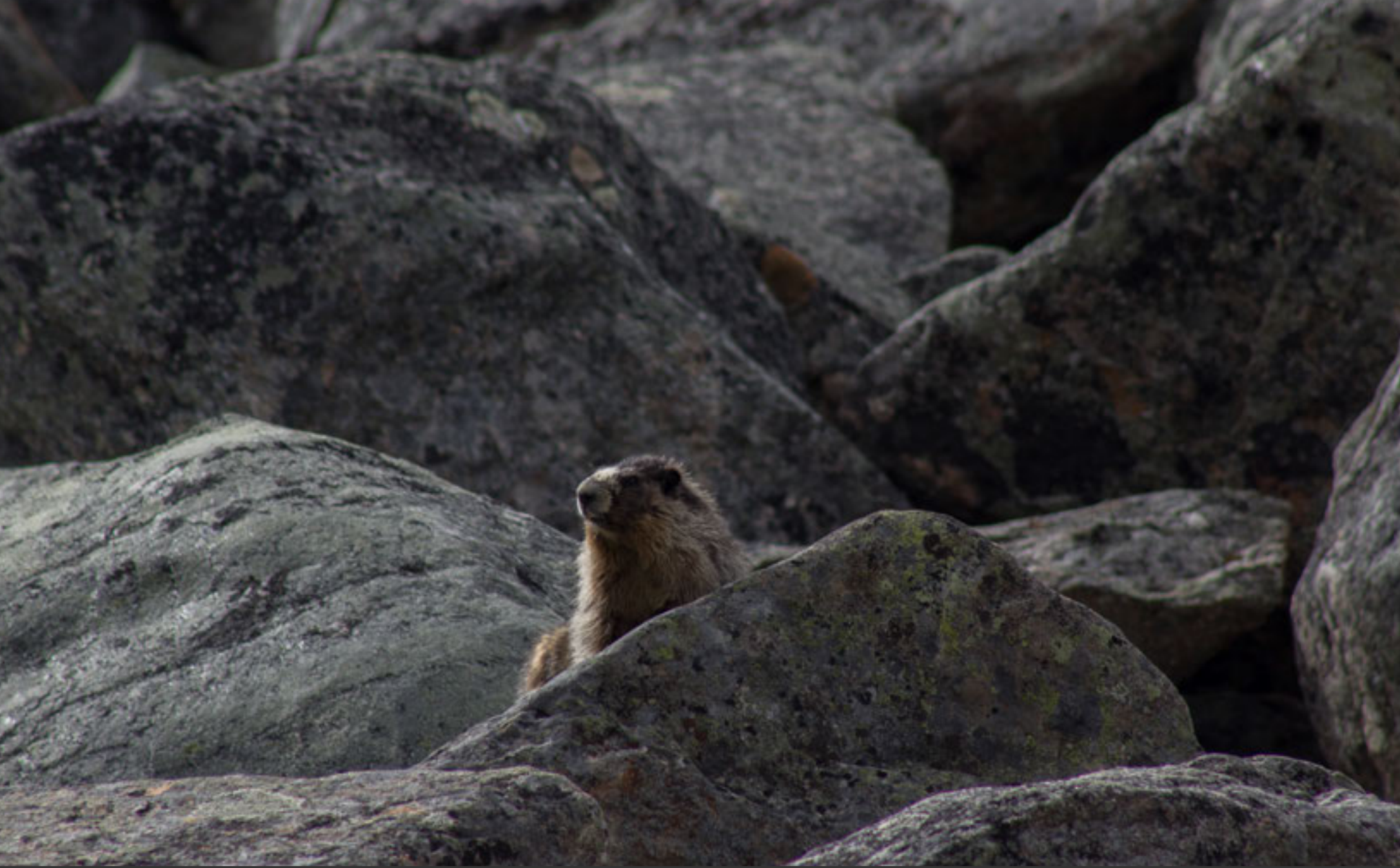
Marmot, Jasper National Park