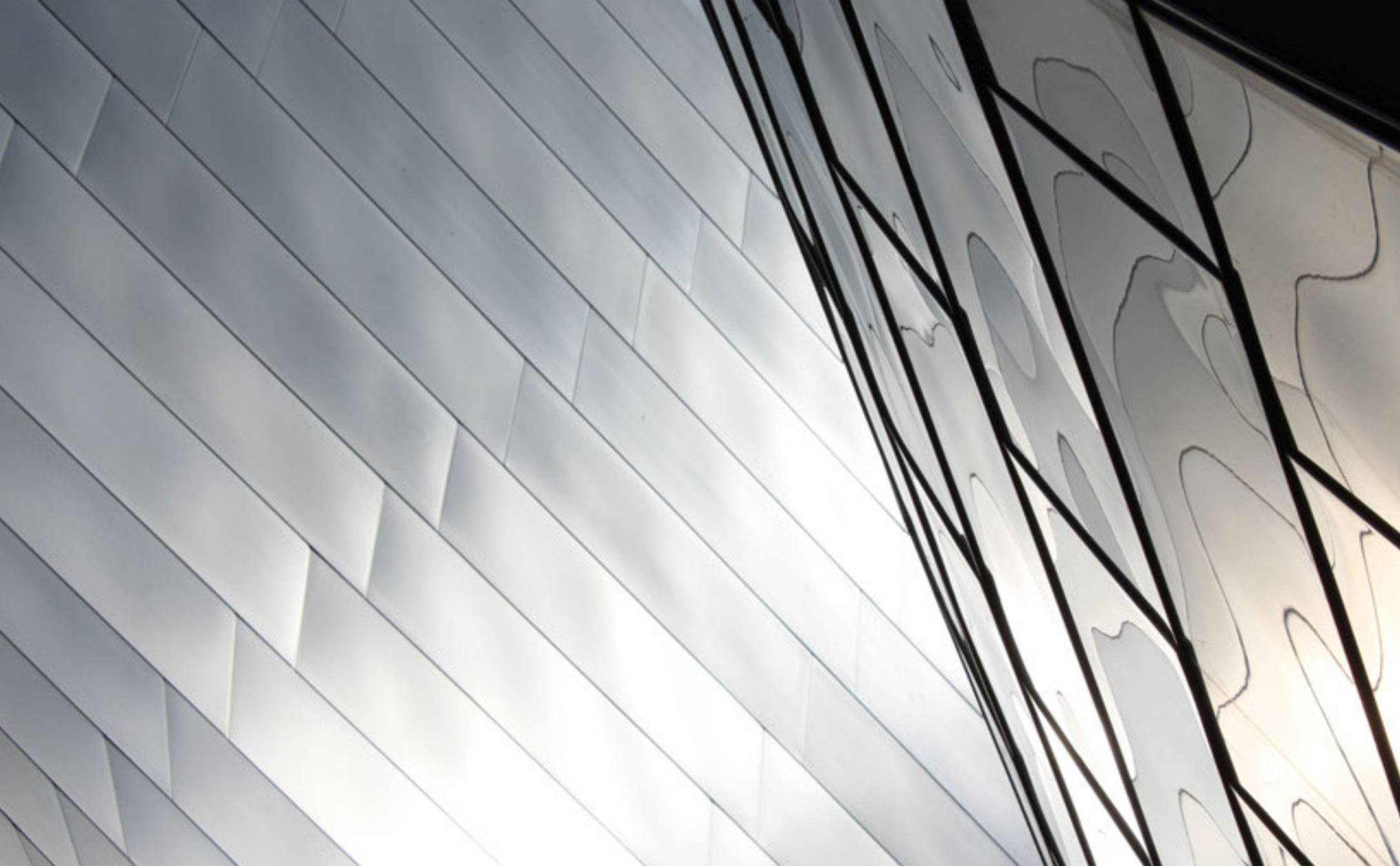
The Disney Concert Hall, Los Angeles