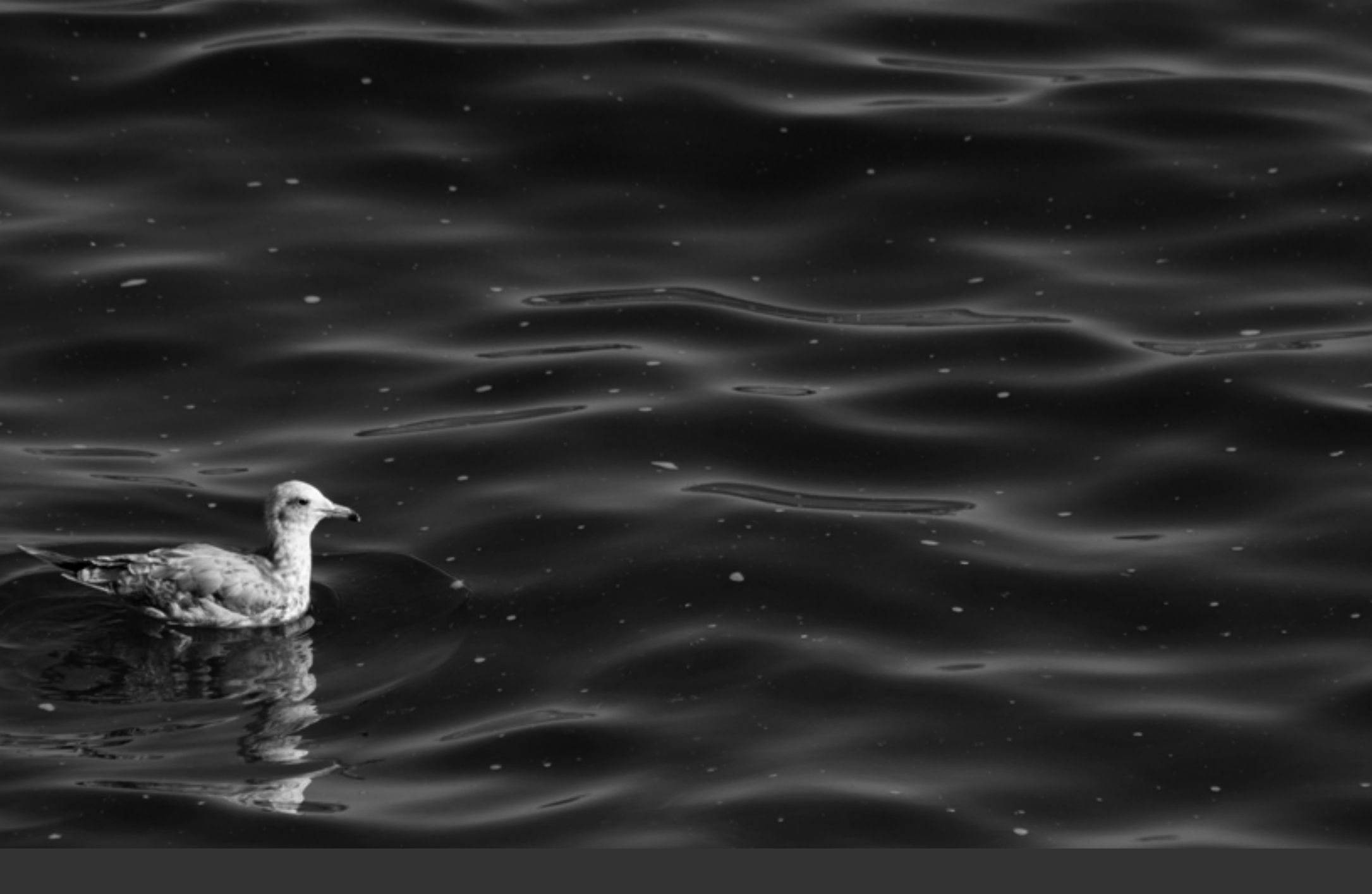
Seagull, Yellowstone Lake, Yellowstone National Park