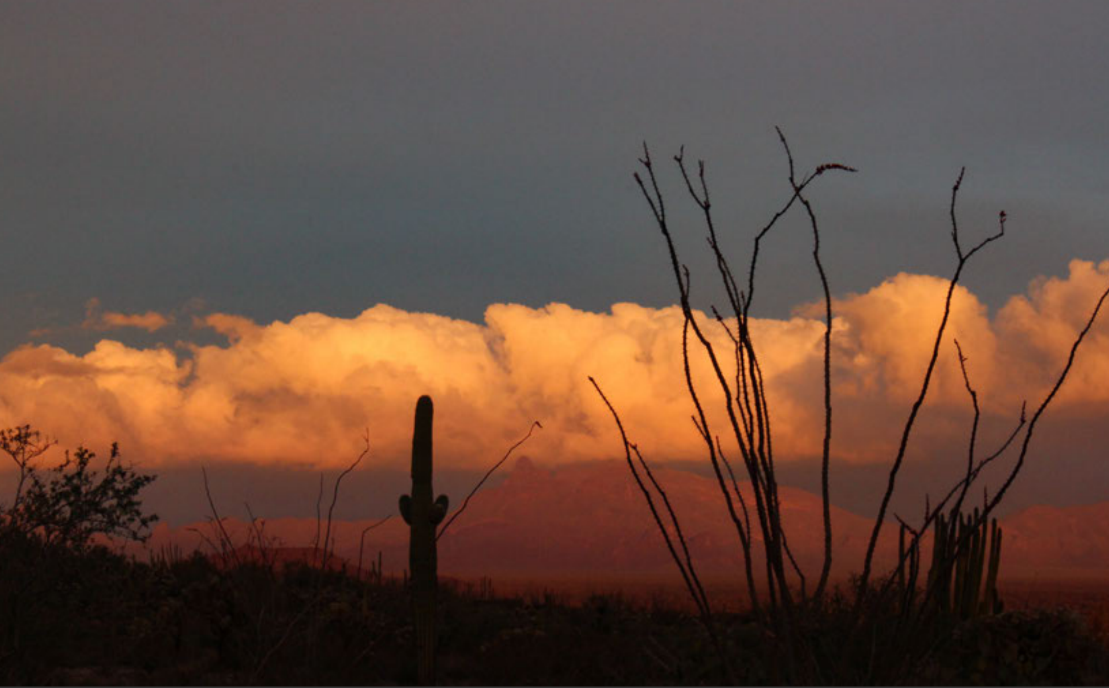
Setting Sun, Organ Pipe Cactus National Park