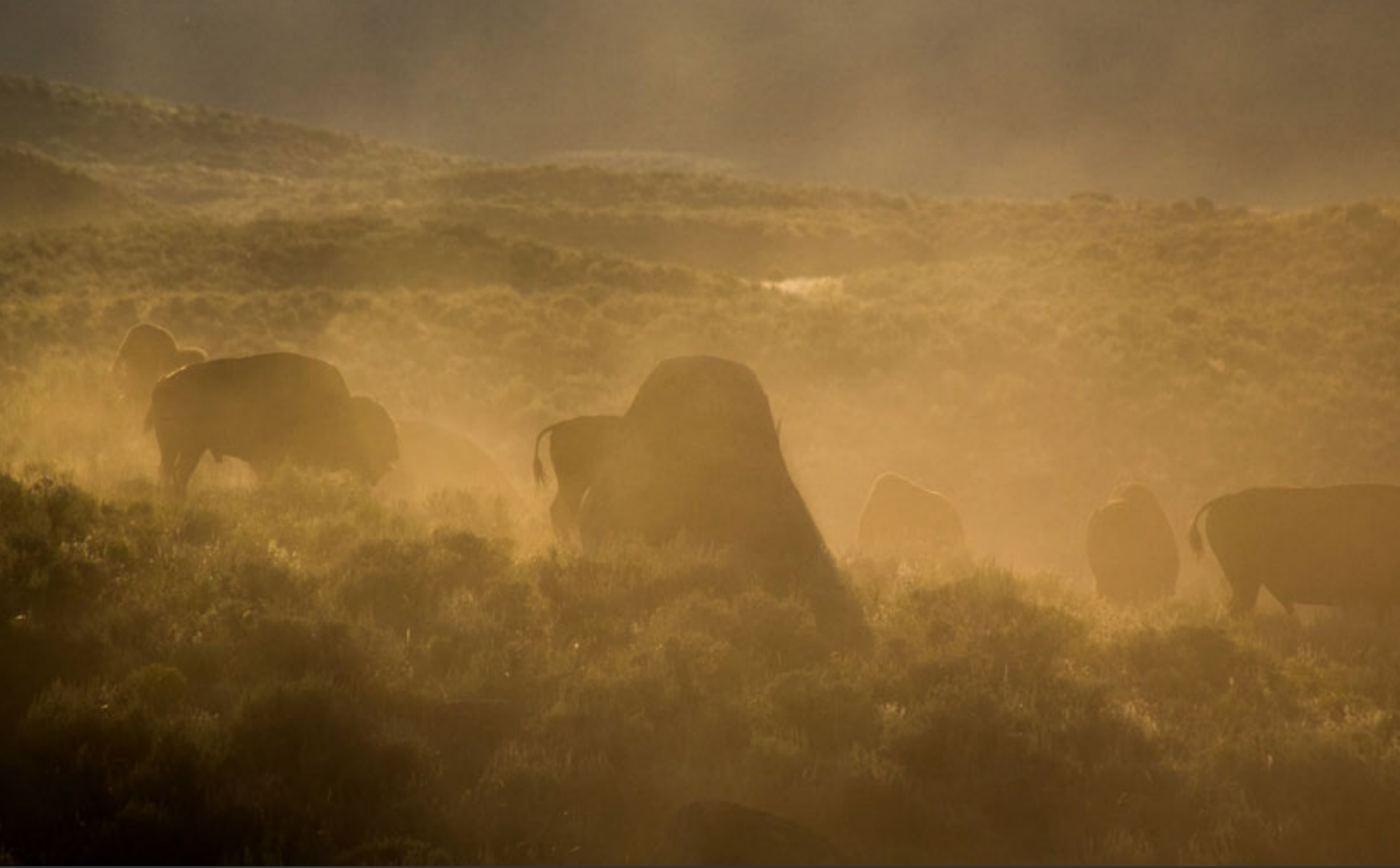
Bison, Lamar Valley, Yellowstone National Park