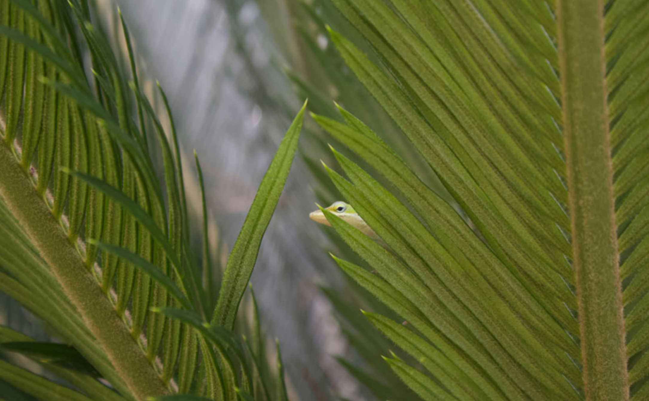
Chameleon, Houston, Texas