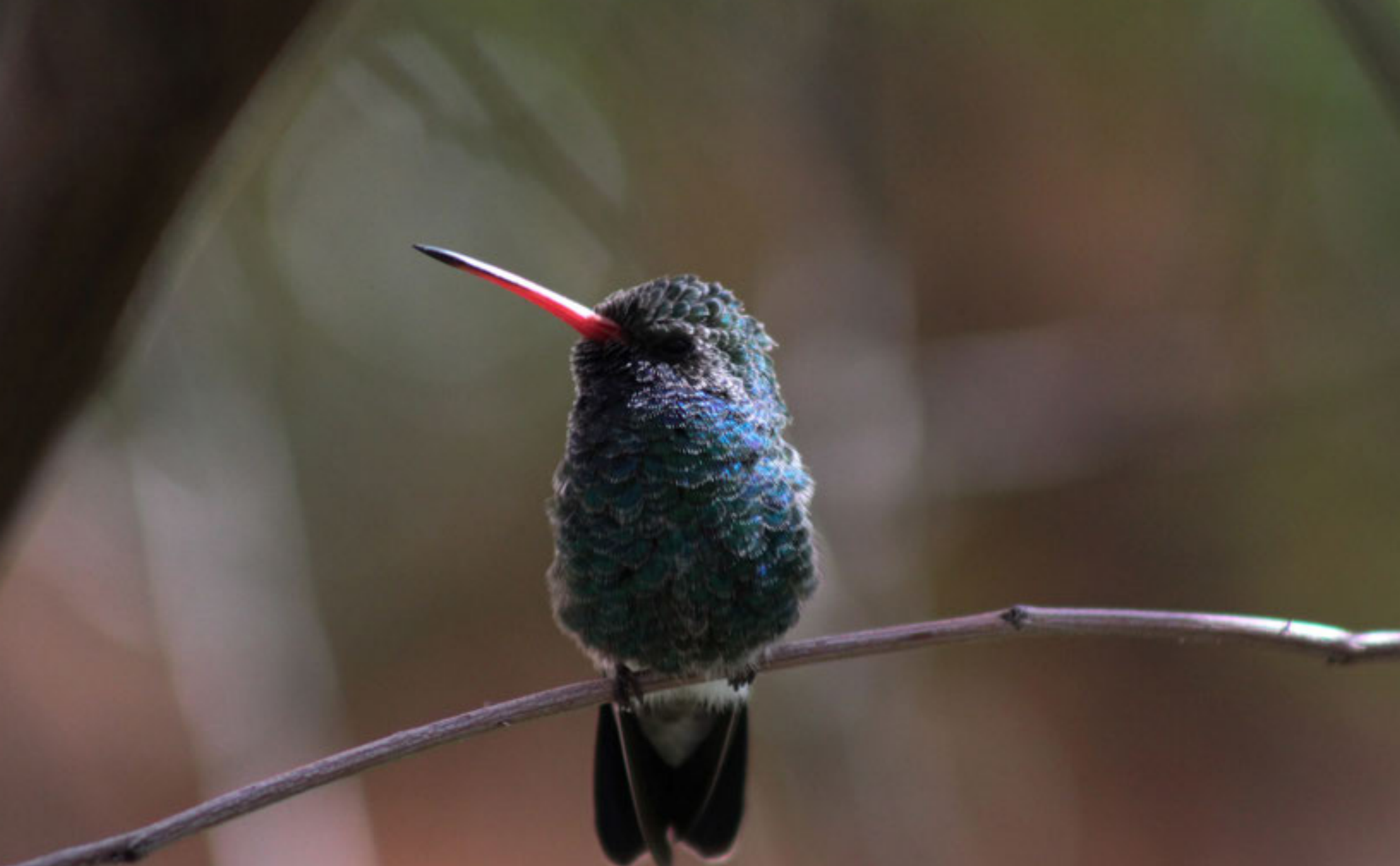
Hummingbird, Saguaro National Park