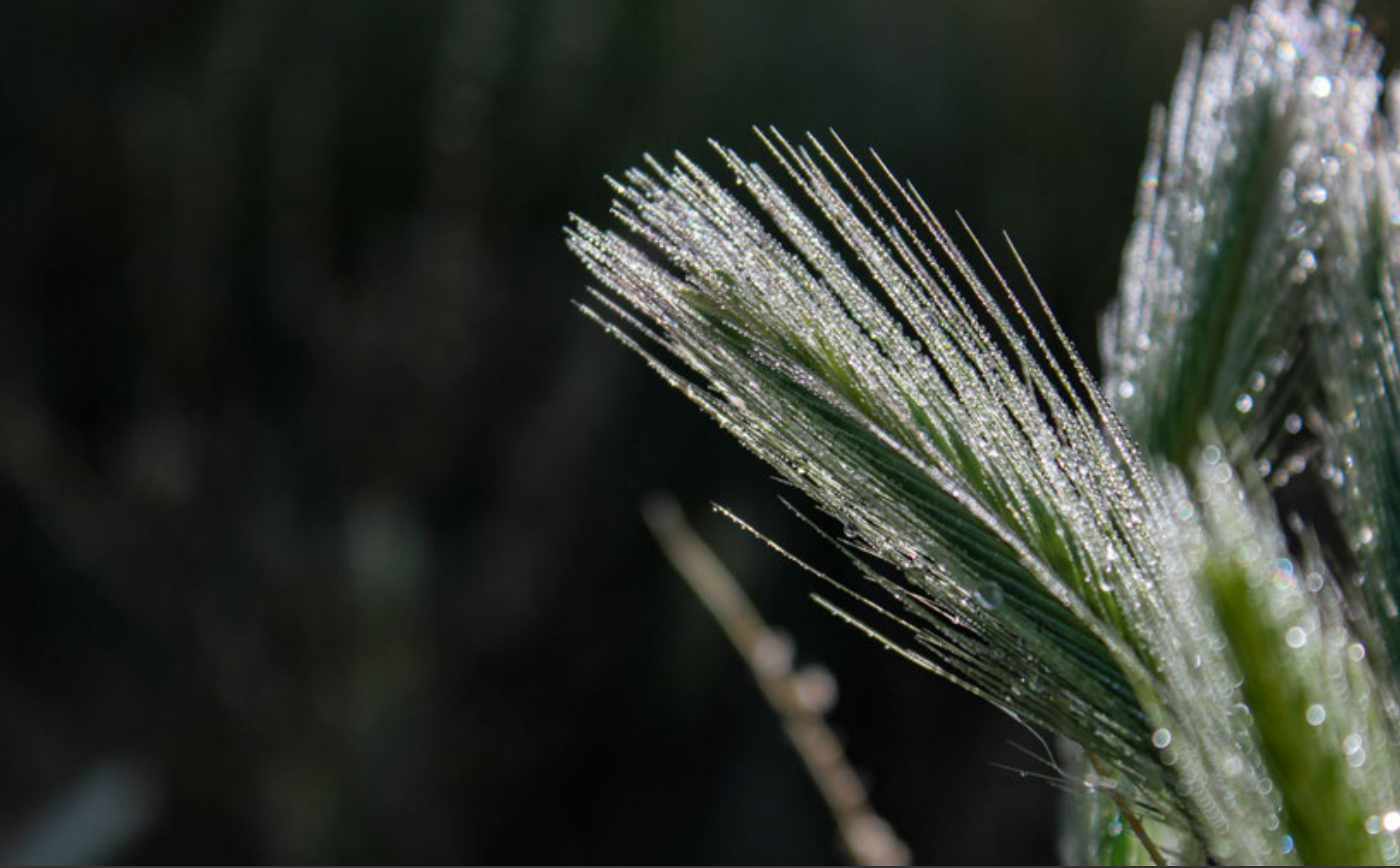
Grass, Zion National Park