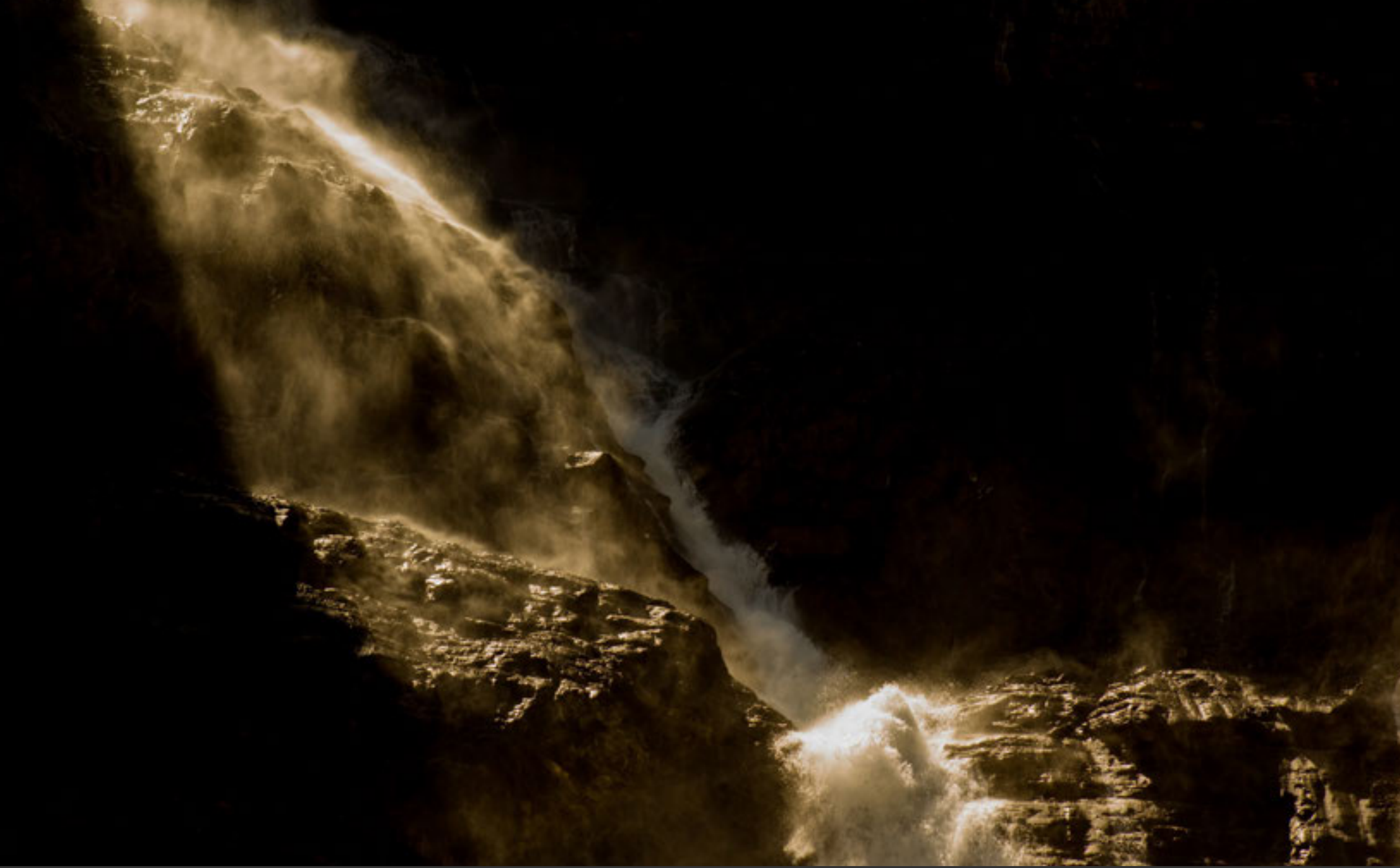
Bow Falls, Banff National Park