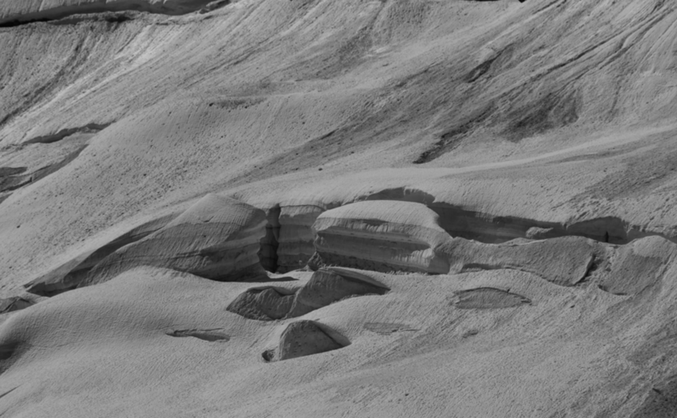
Glacier, Yoho National Park