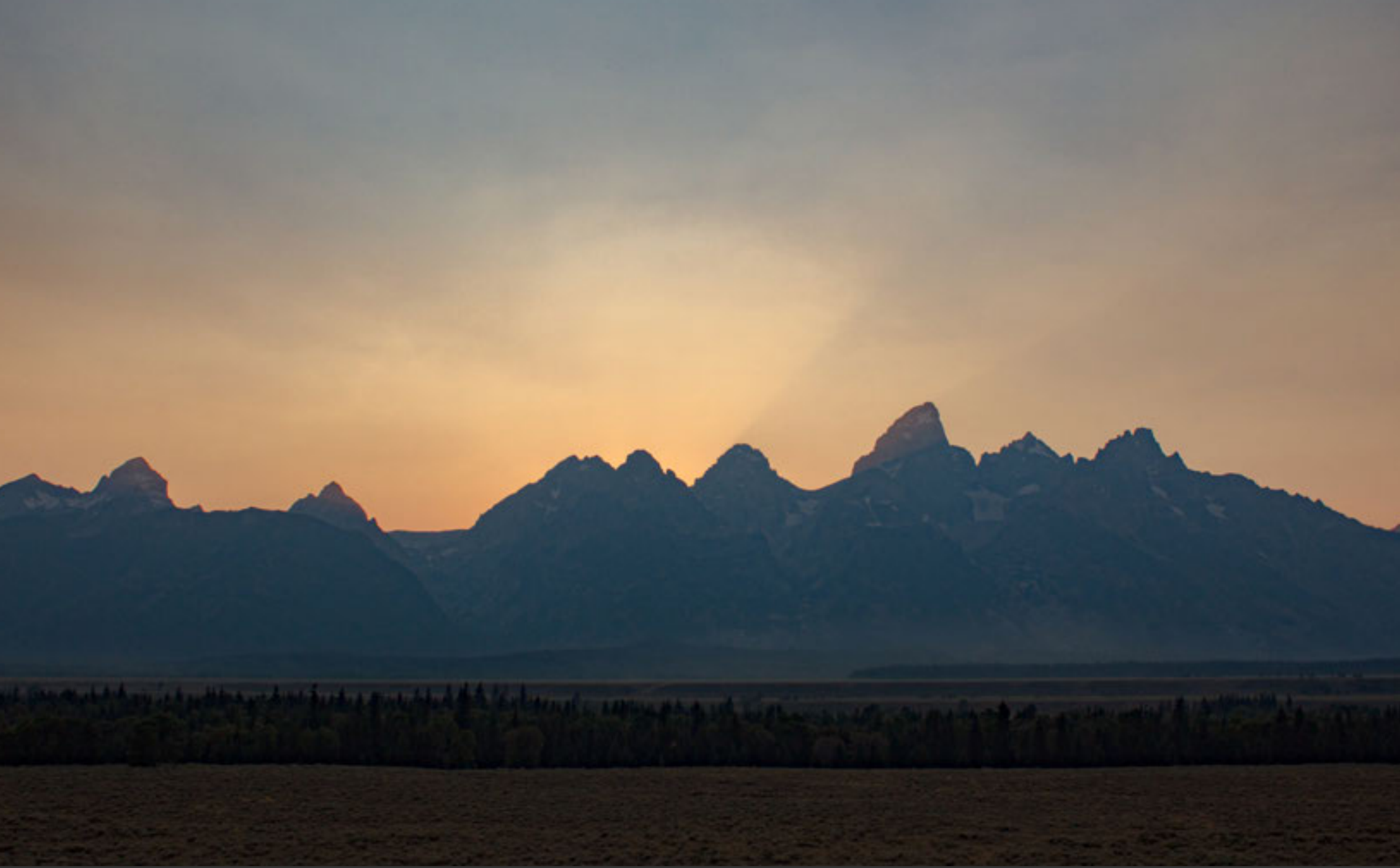
Grand Teton Mountain Range