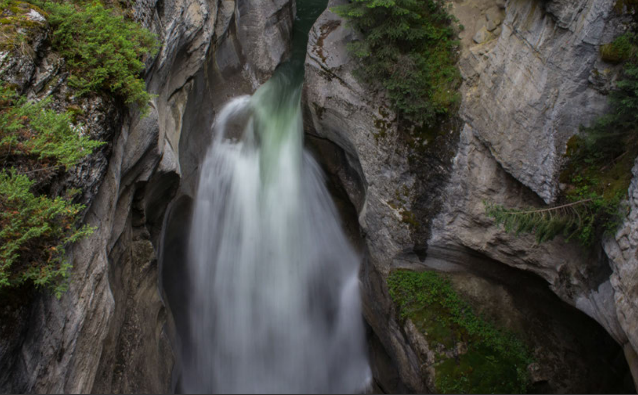
Waterfall, Jasper National Park