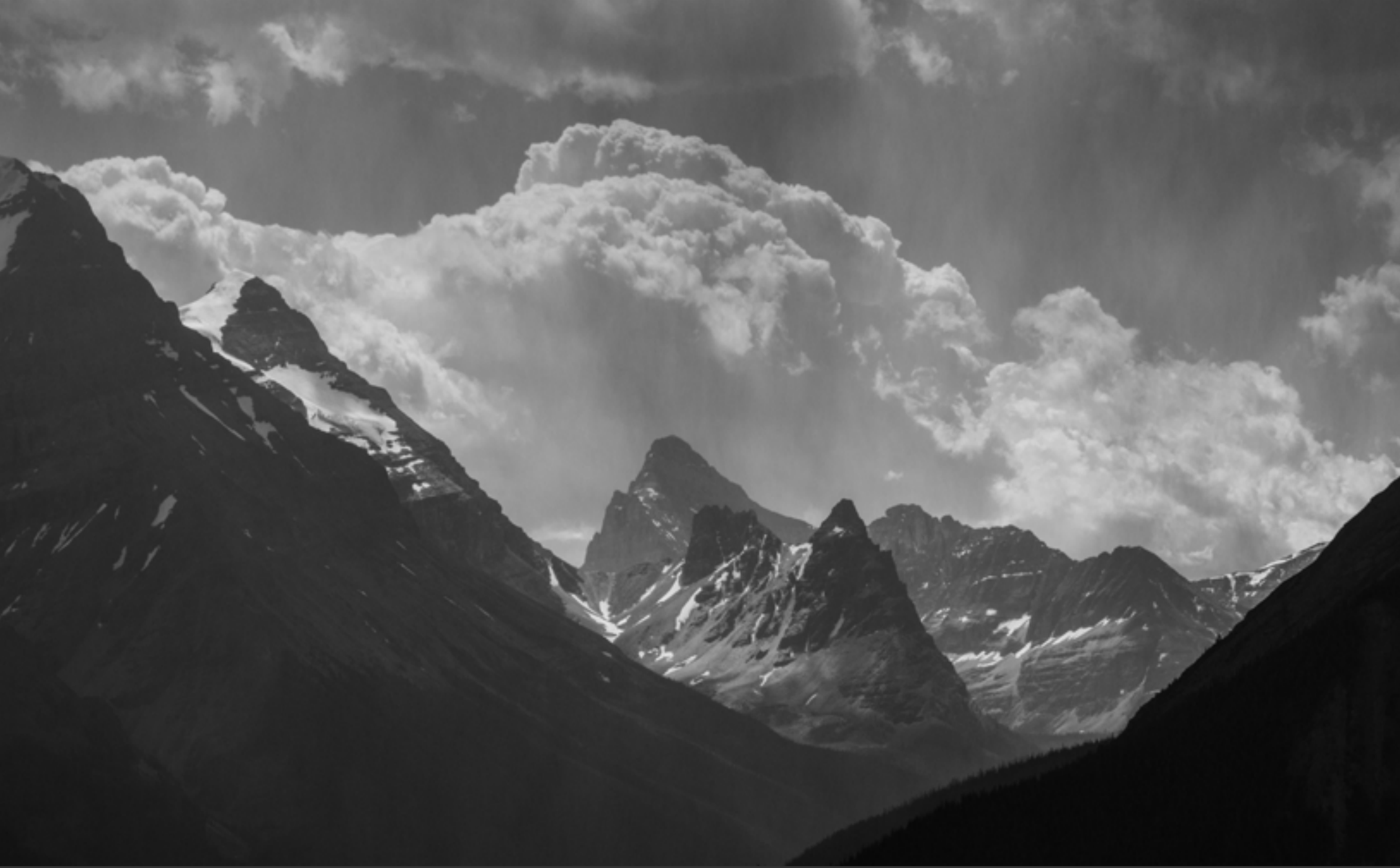
Thunderstorm, Victoria Range, Banff National Park