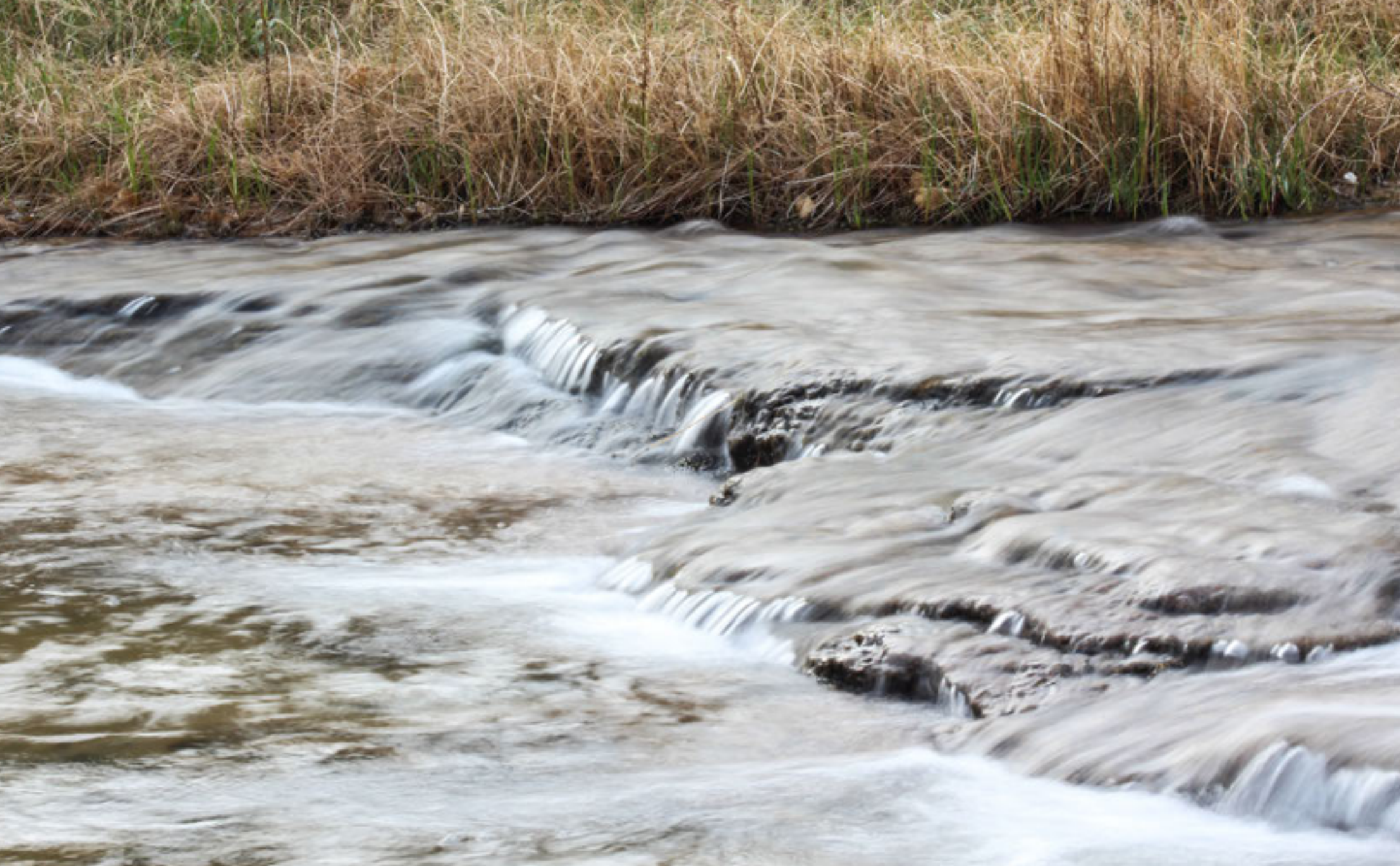
Calf Creek, Utah