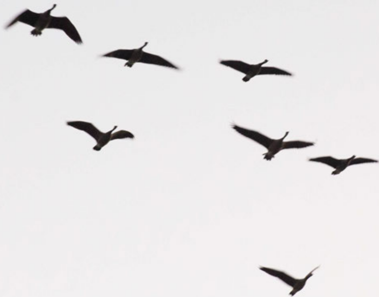
Geese, Hayden Valley, Yellowstone National Park