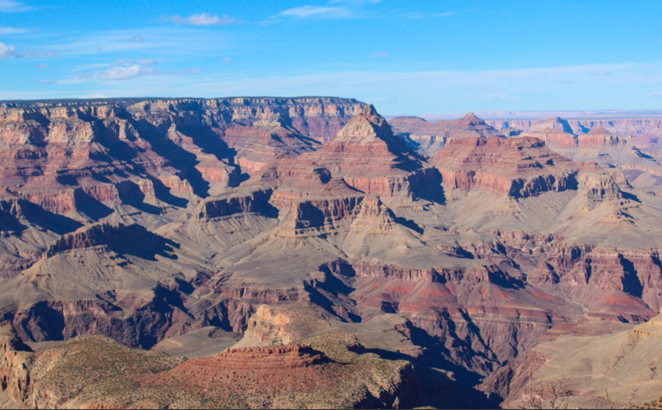
Grand Canyon National Park