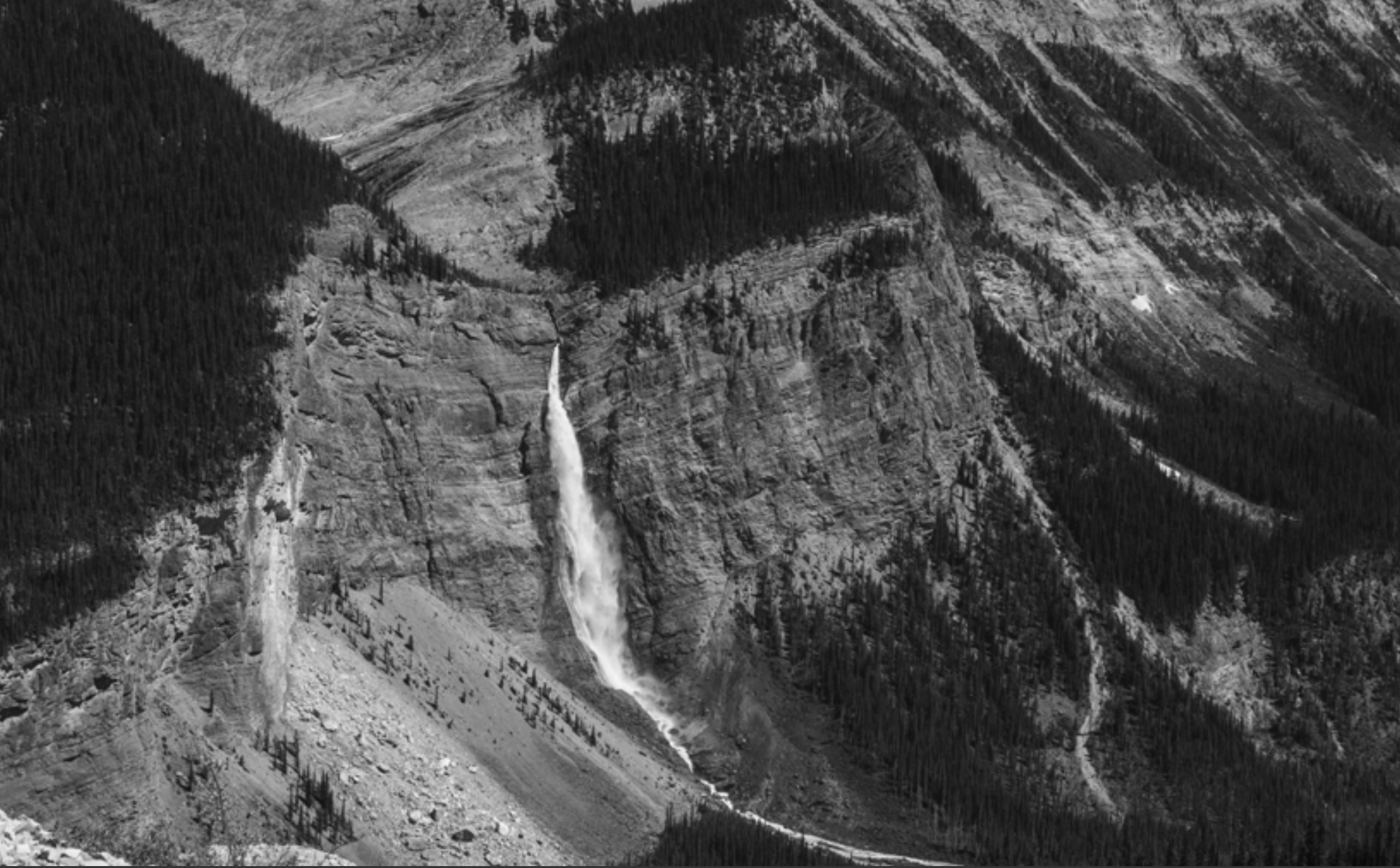
Takakkaw Falls, Yoho National Park