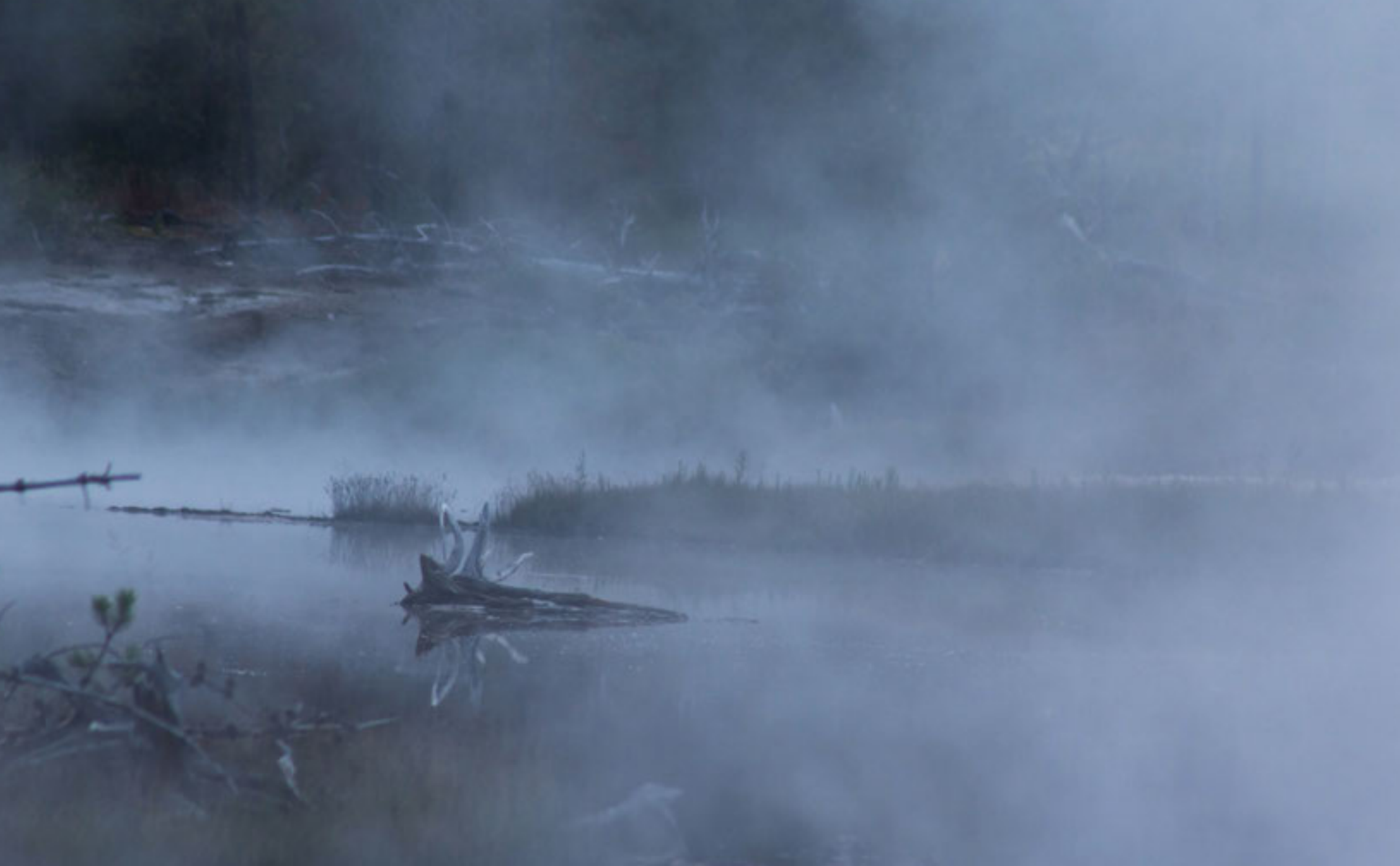
Fog, Norris Geiser Basin, Yellowstone National Park