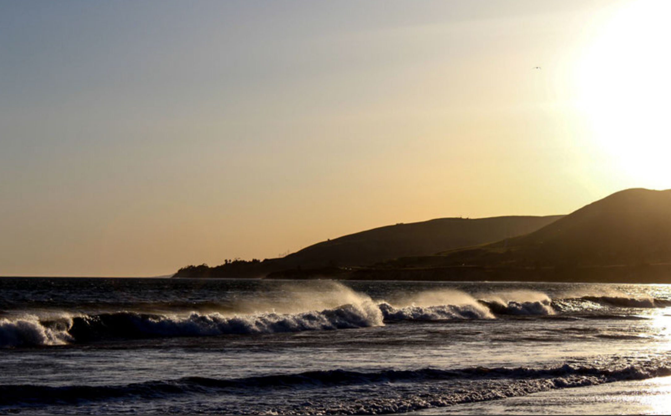
Waves, Pacific Coast