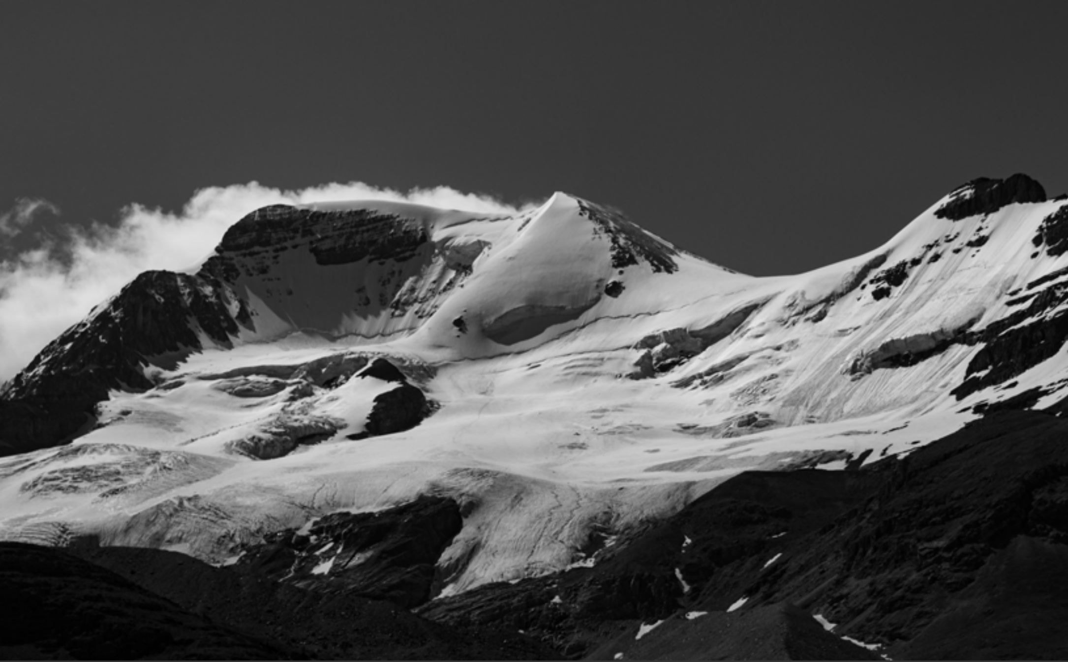
Mount Athabasca, Canada