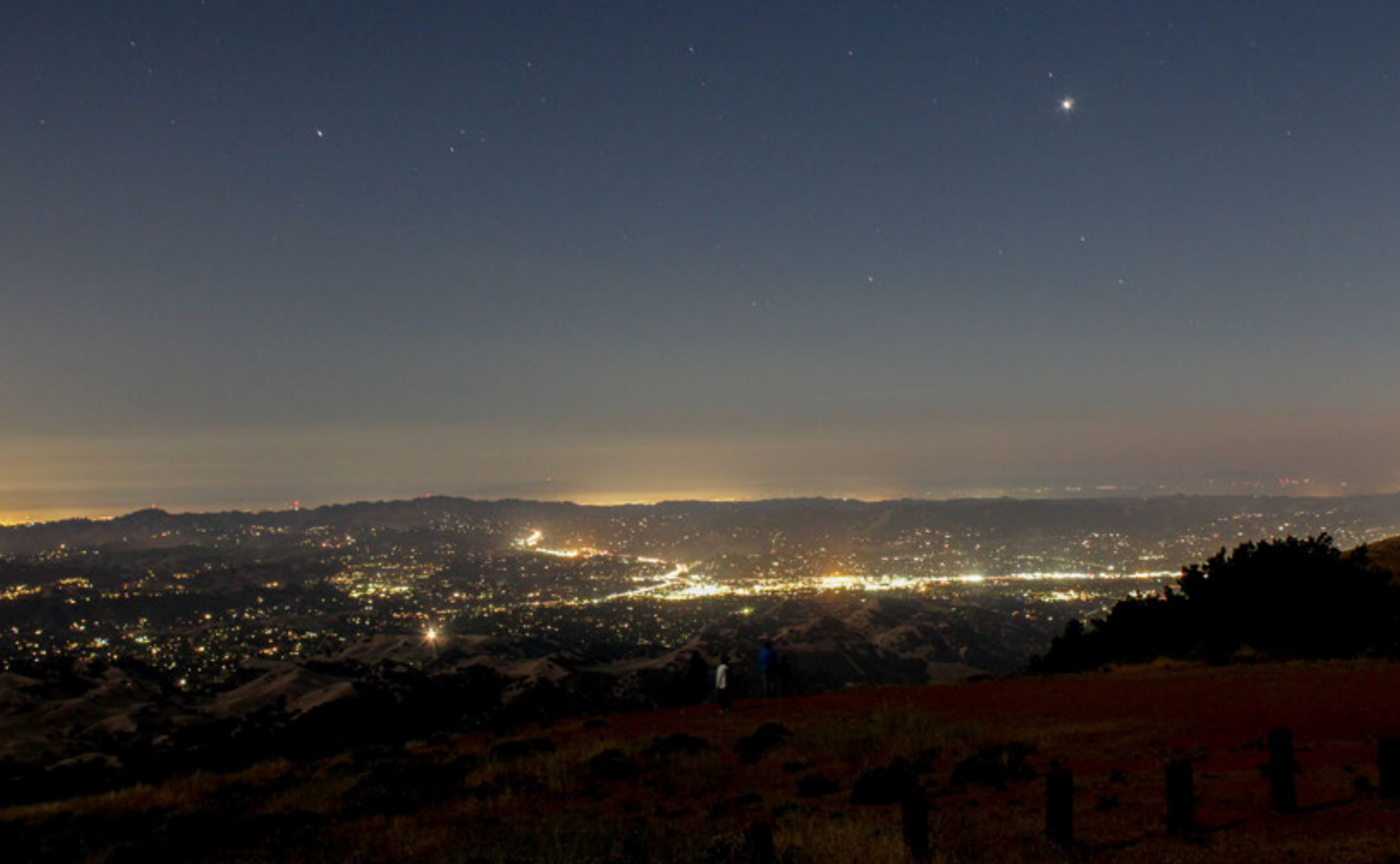
San Francisco, California