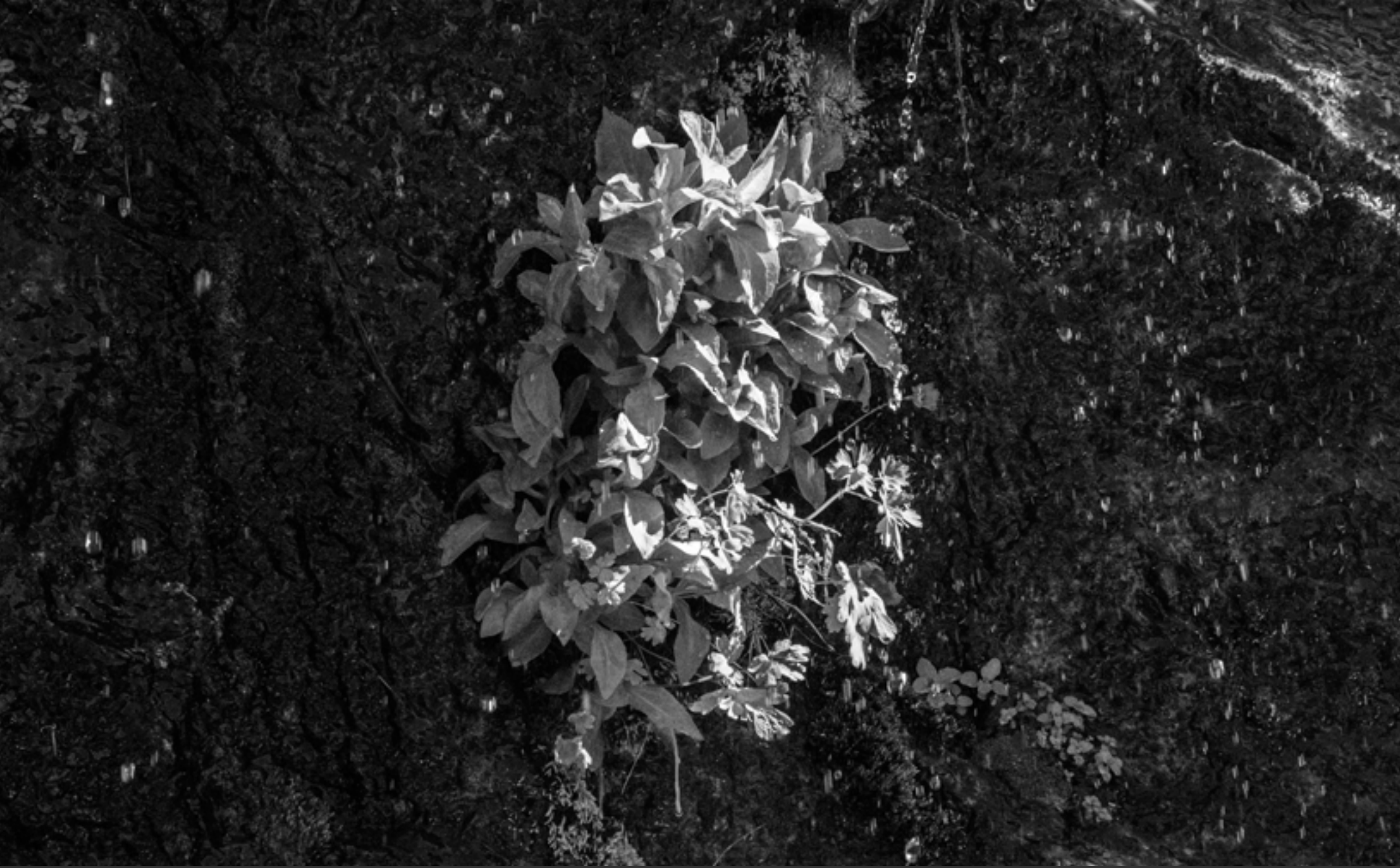
Dripping Water, Yosemite National Park