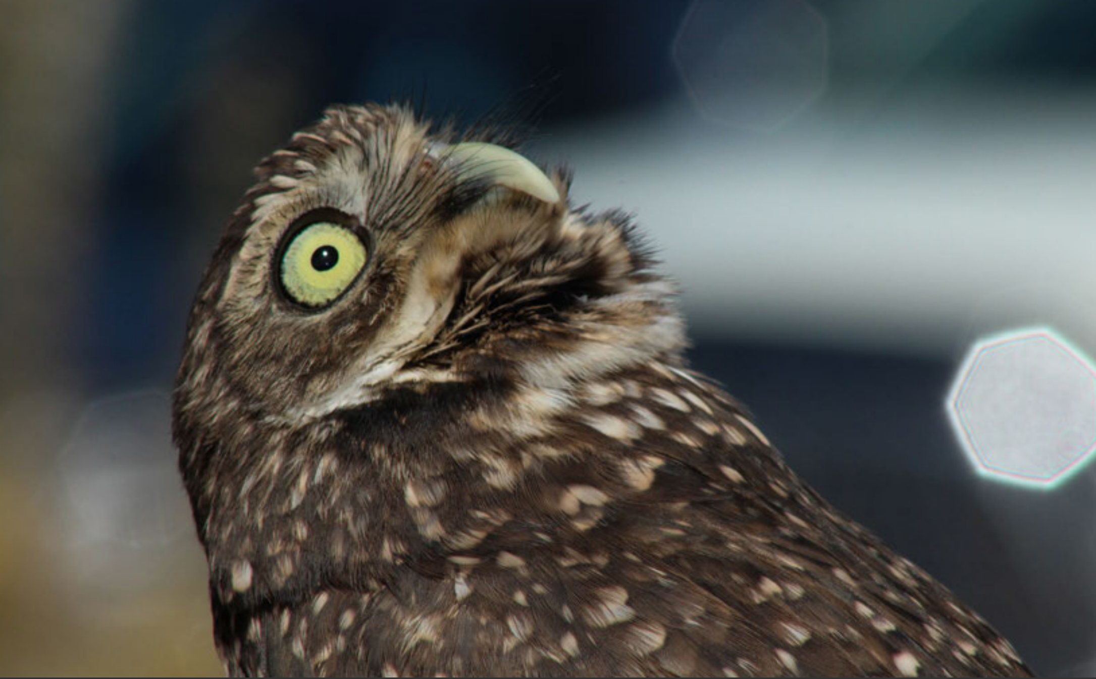
Owl, Saguaro National Park