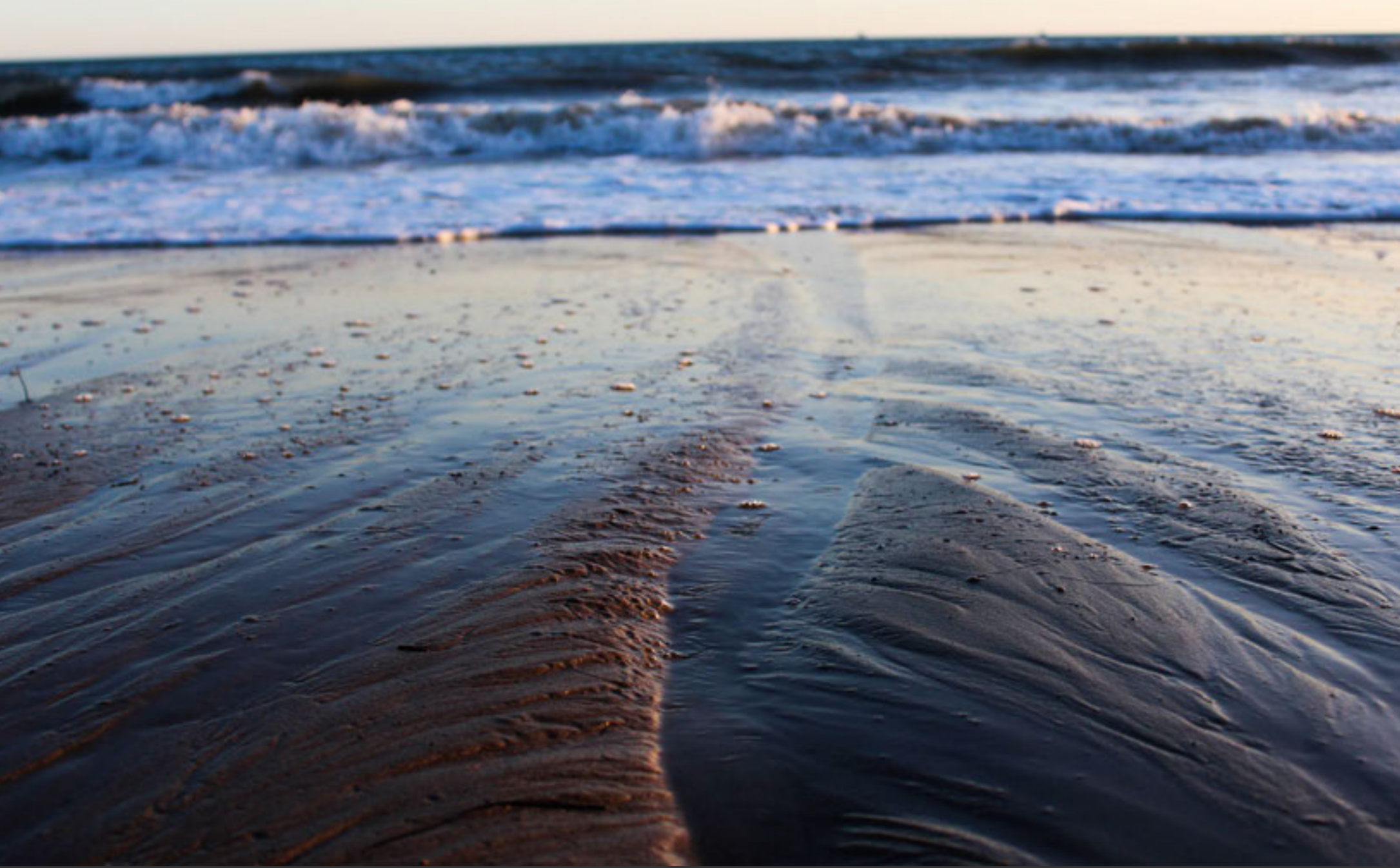
Beach, Pacific Coast