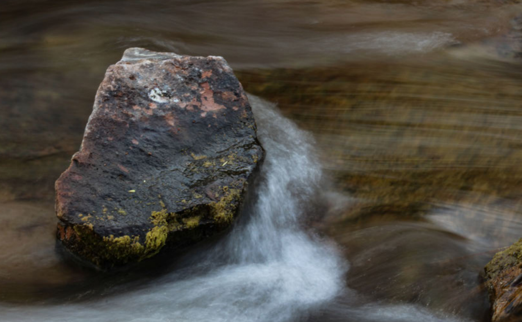
Stone, Calf Creek, Utah