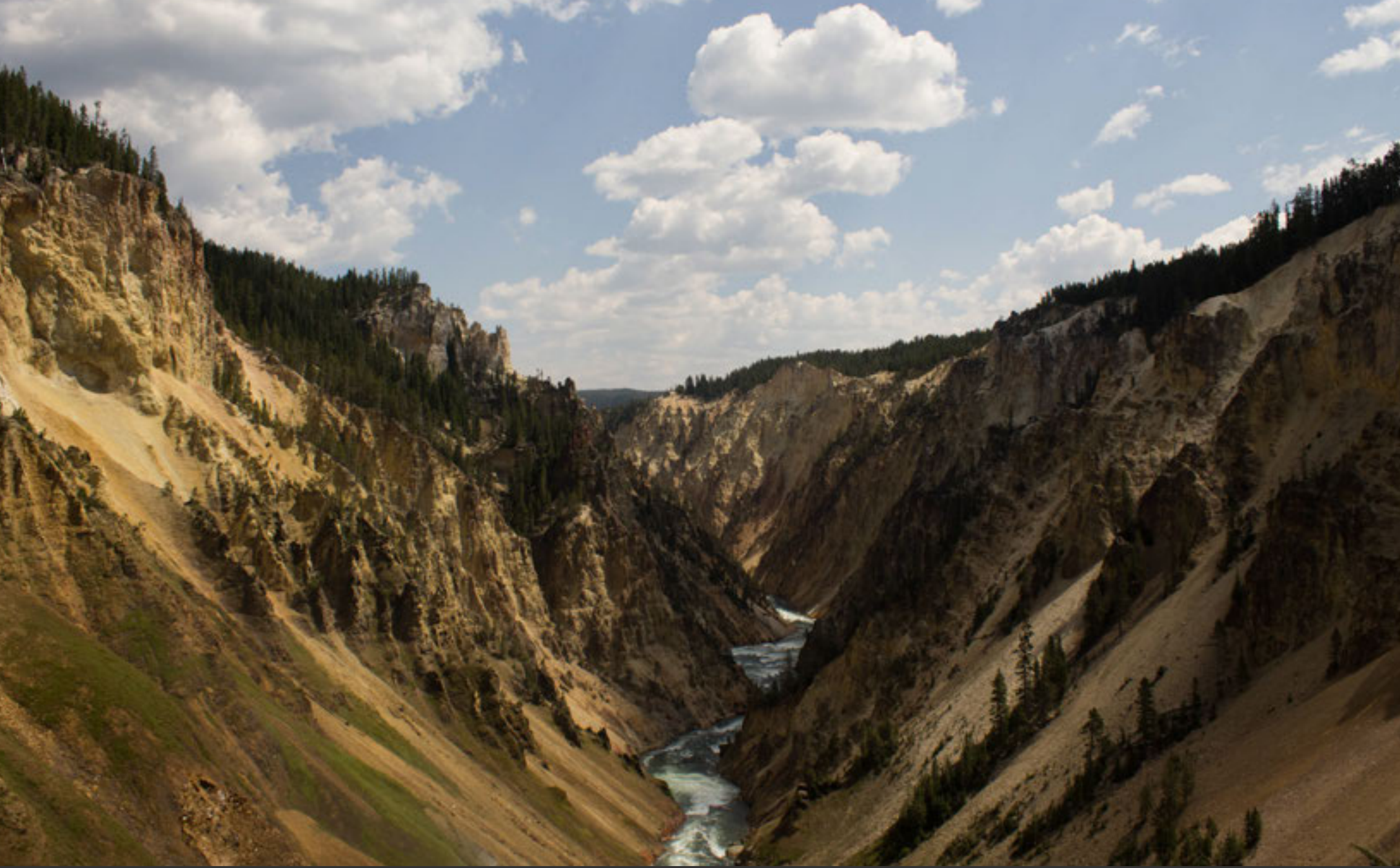
The Grand Canyon of Yellowstone National Park