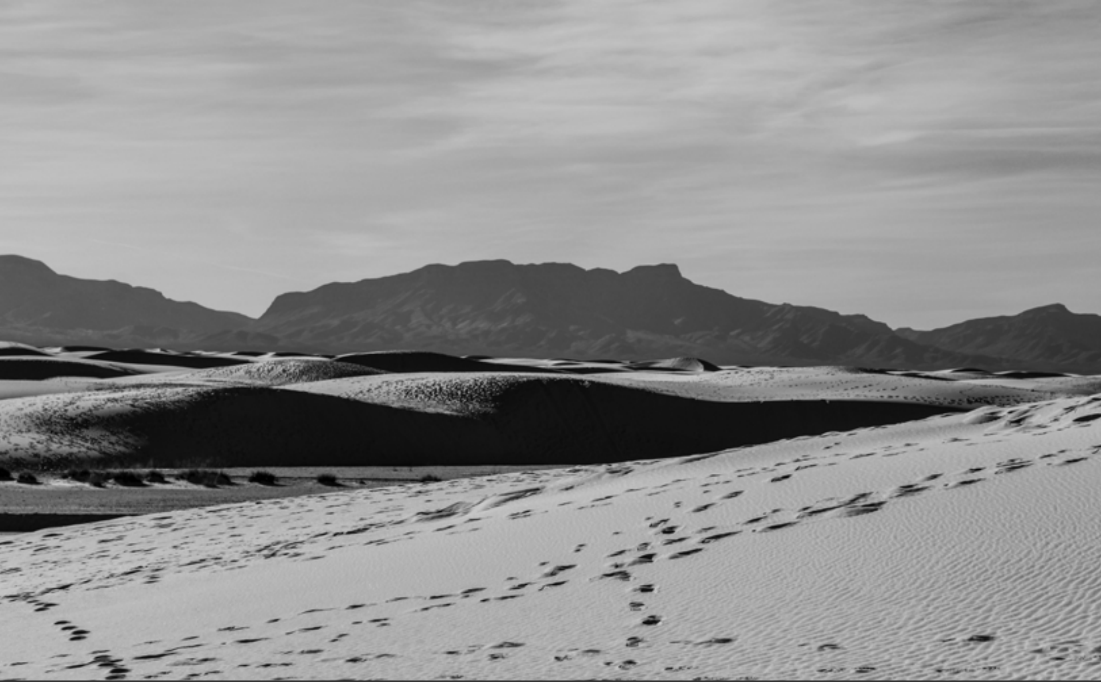
Landscape, White Sands National Monument