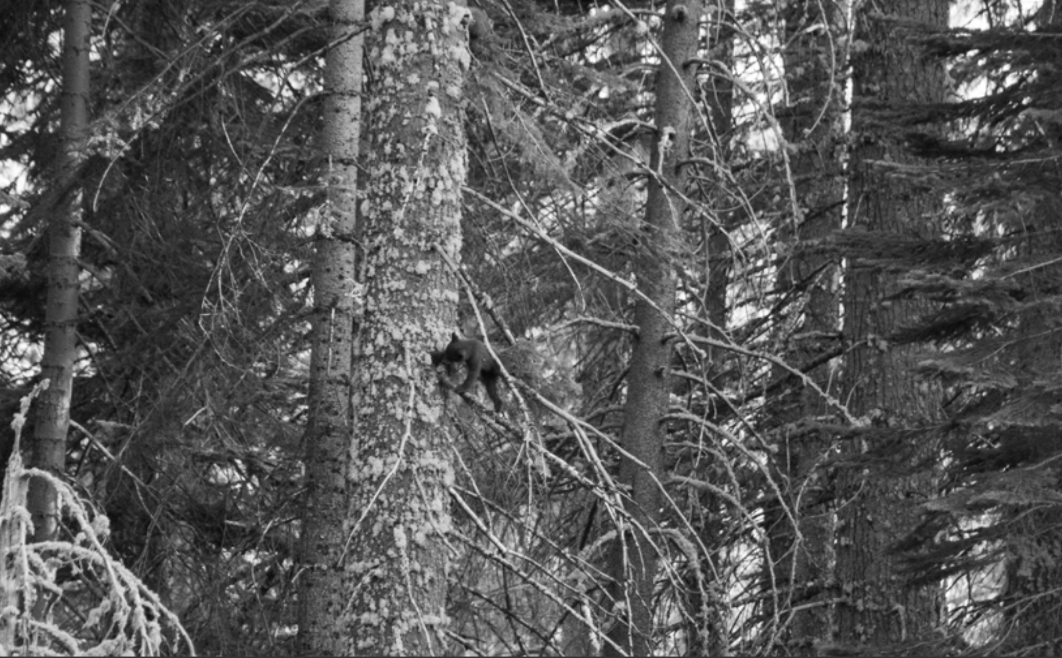
Black Bear, Yosemite National Park