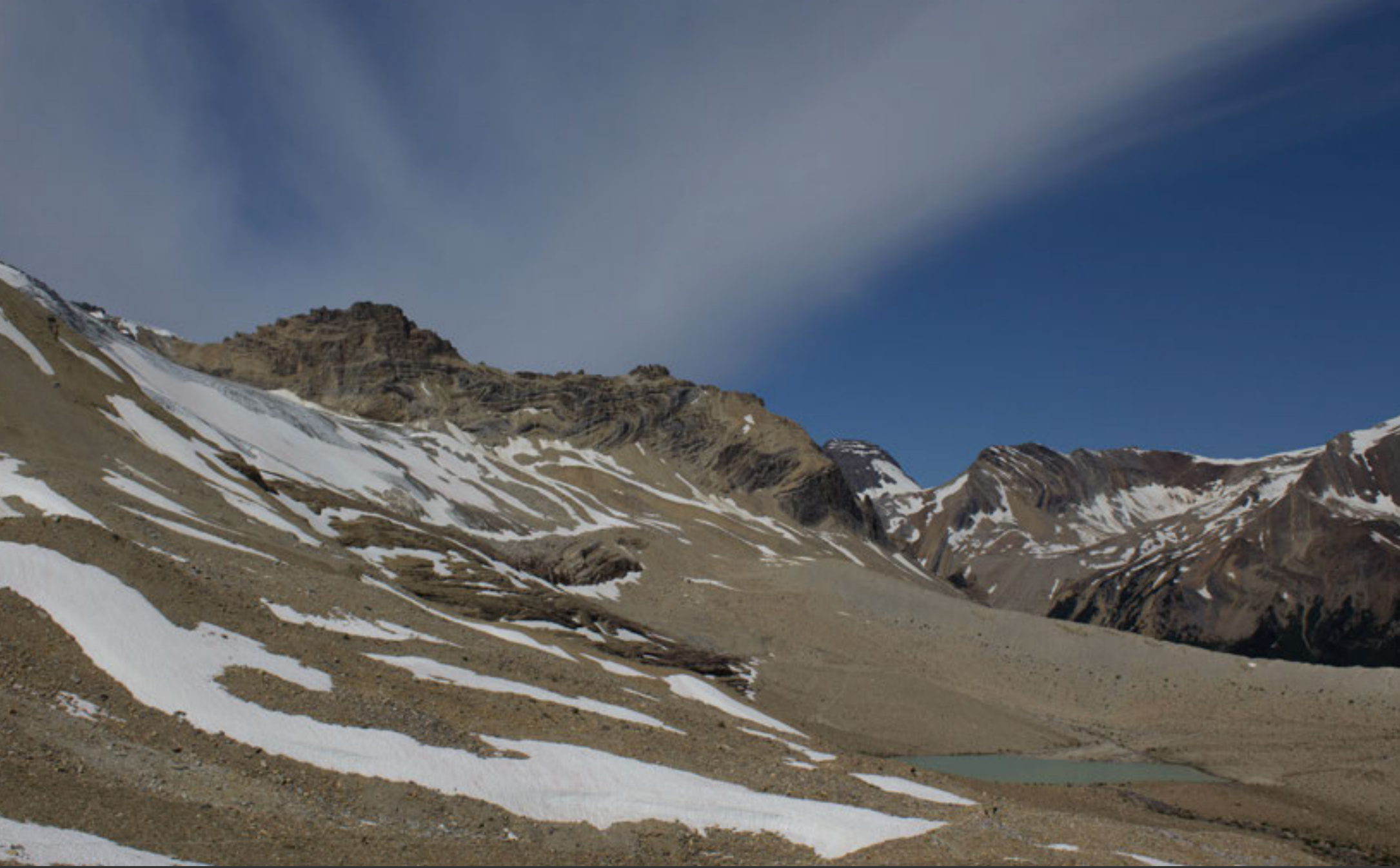
Iceline Trail, Yoho National Park