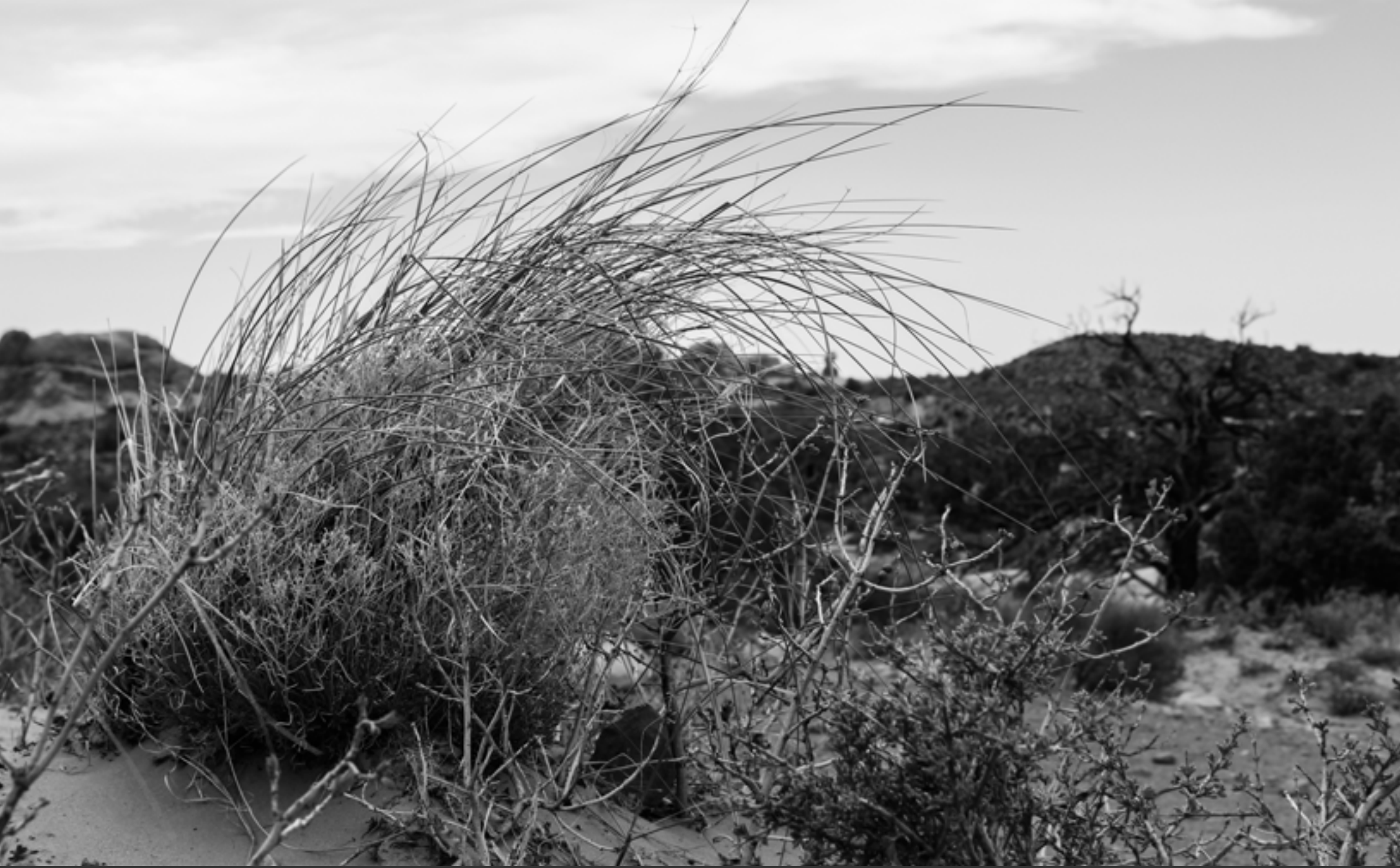
Grass on Dune, Arches National Park