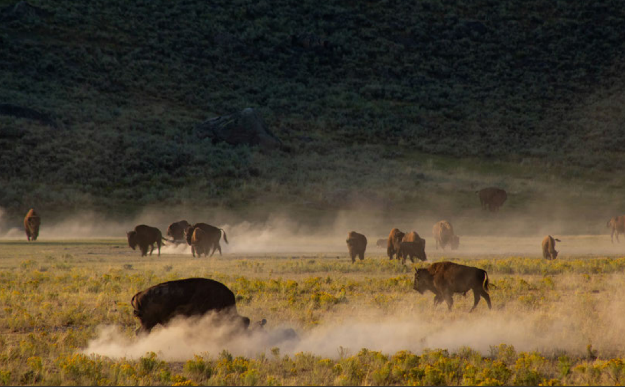
Bison, Lamar Valley, Yellowstone National Park