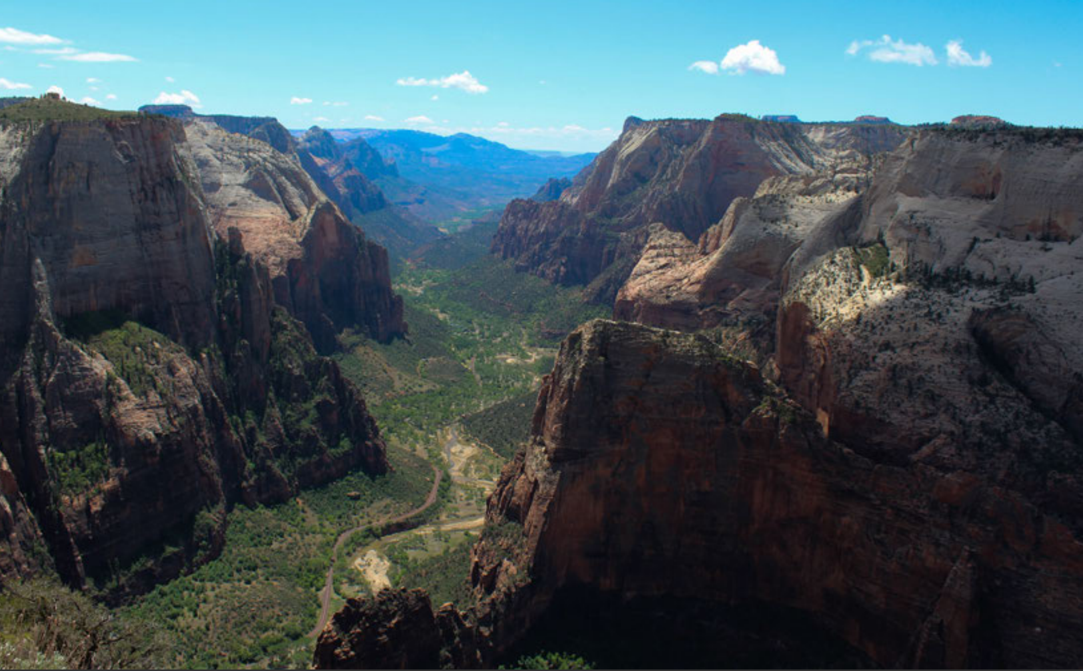
Inspiration Point, Zion National Park