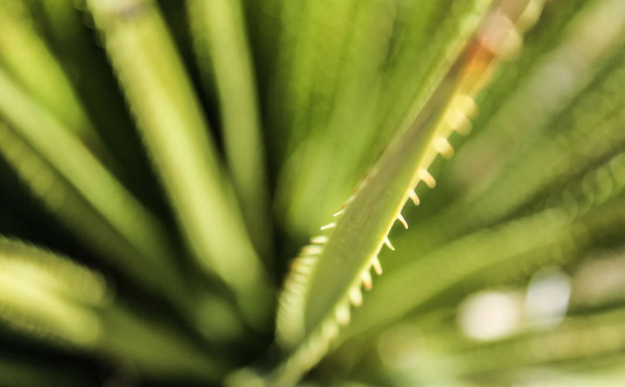
Yucca Plant, Big Bend National Park