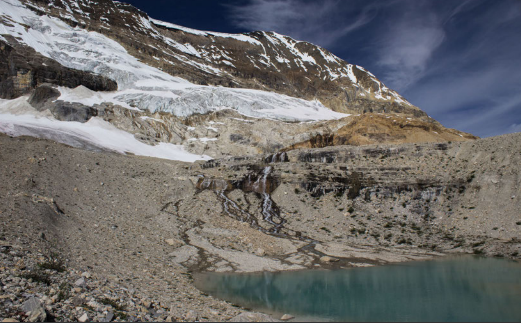
Iceline Trail, Yoho National Park