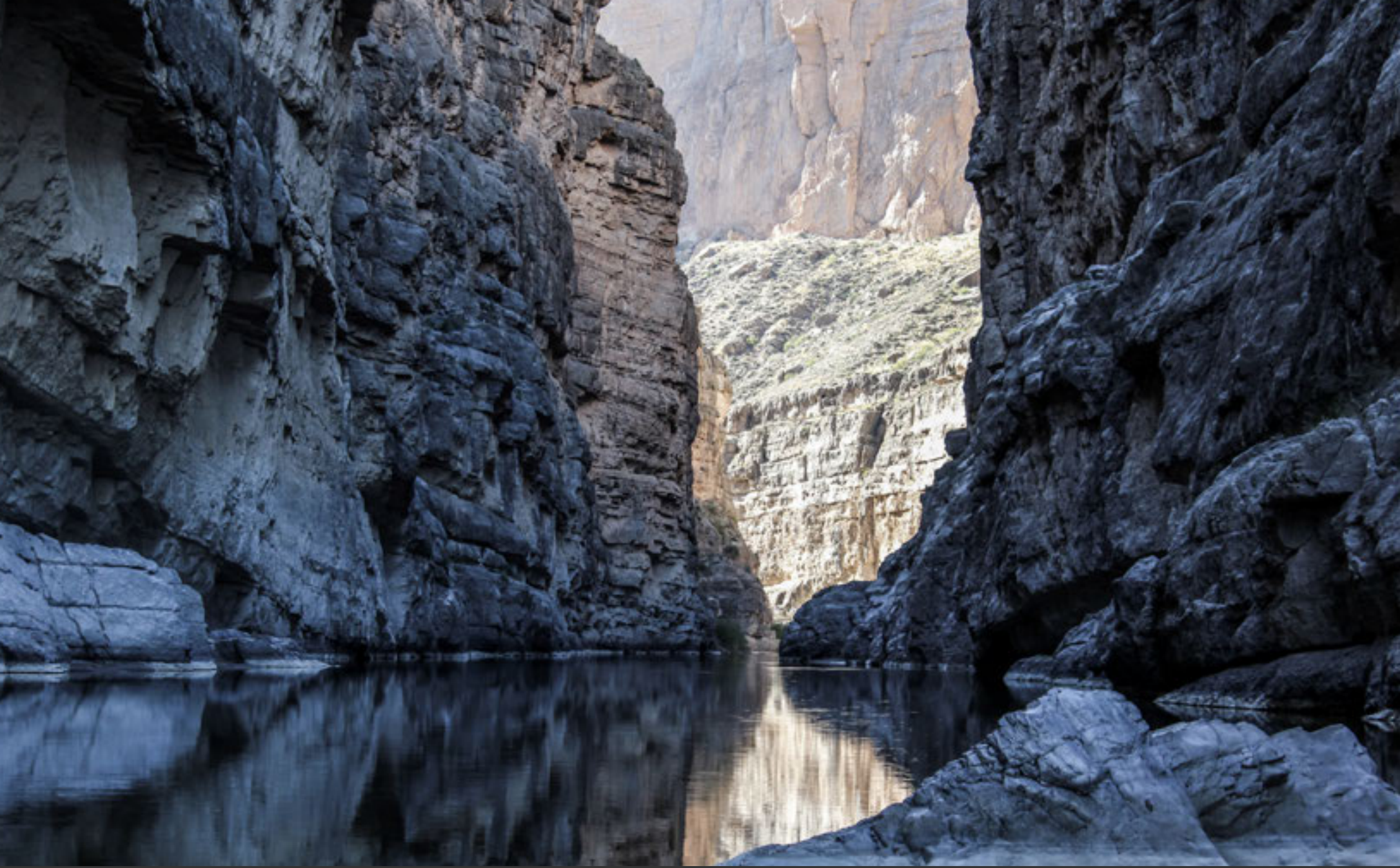
The Rio Grande River at the Mexican Border, Big Bend National Park