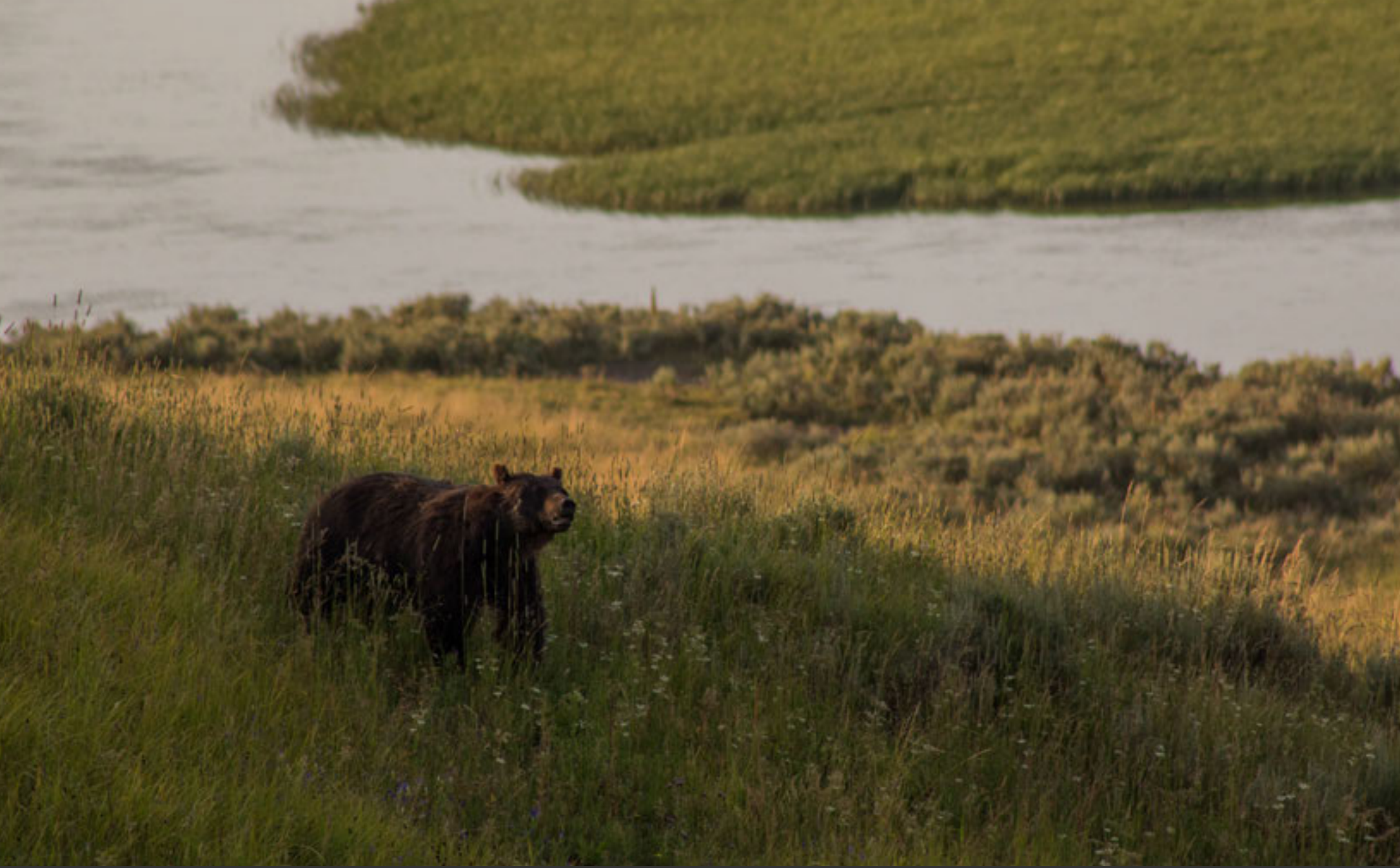
Grizzly Bear, Hayden Valley, Yellowstone National Park