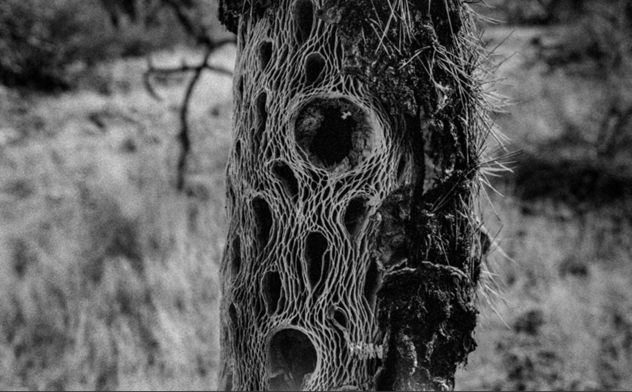
Dead Cactus, Saguaro National Park