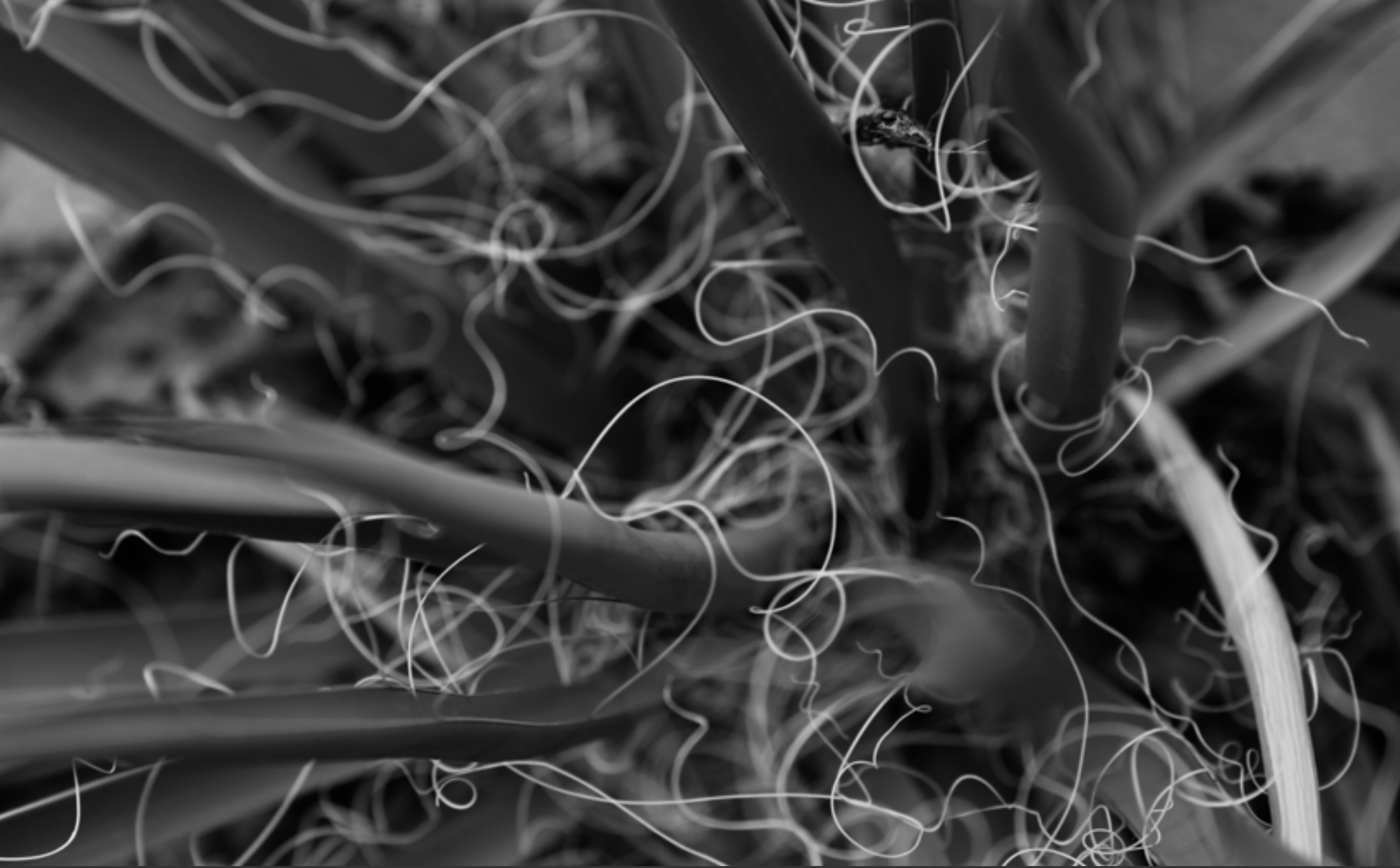
Yucca Plant, Arches National Park