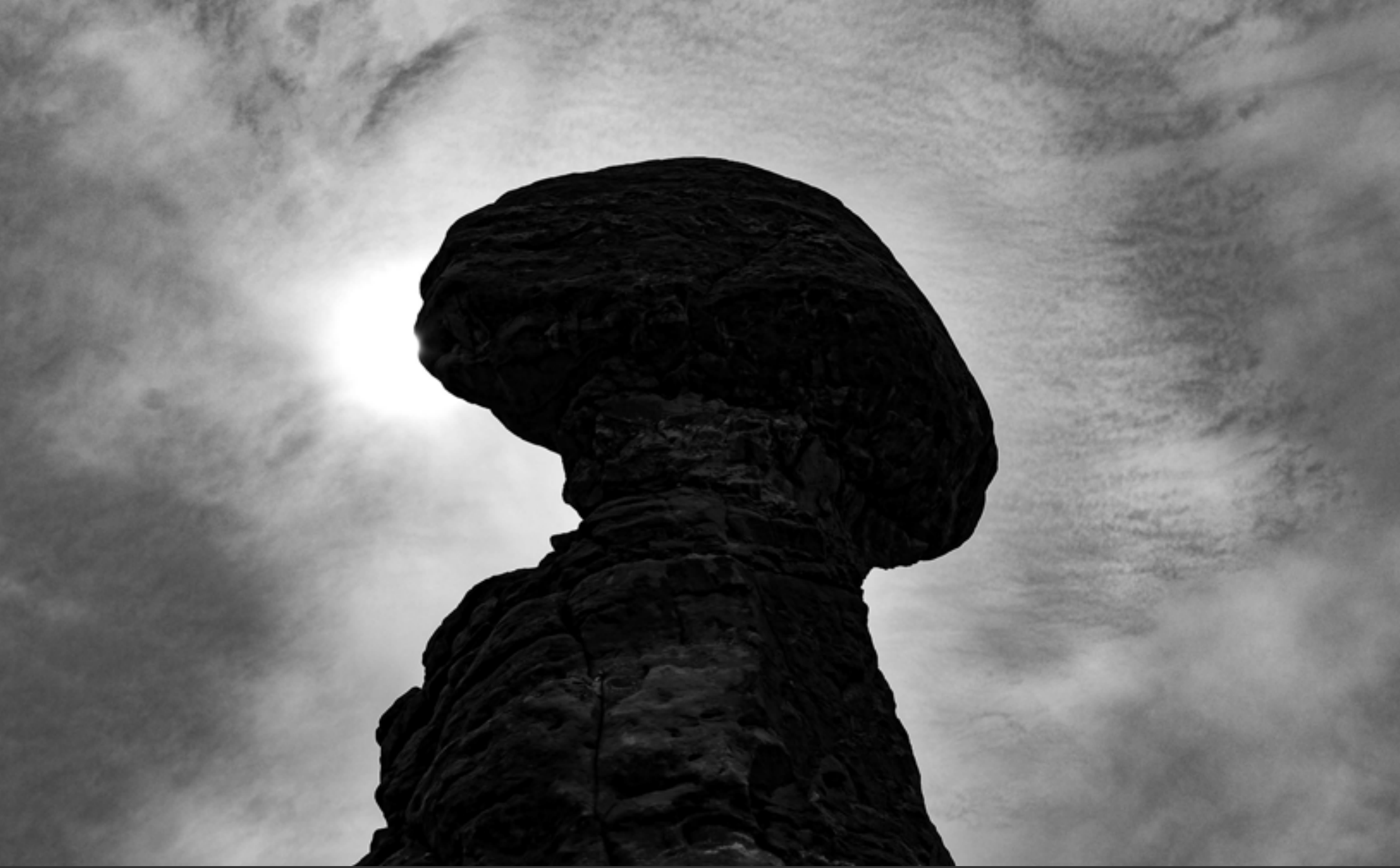
Balanced Rock, Arches National Park