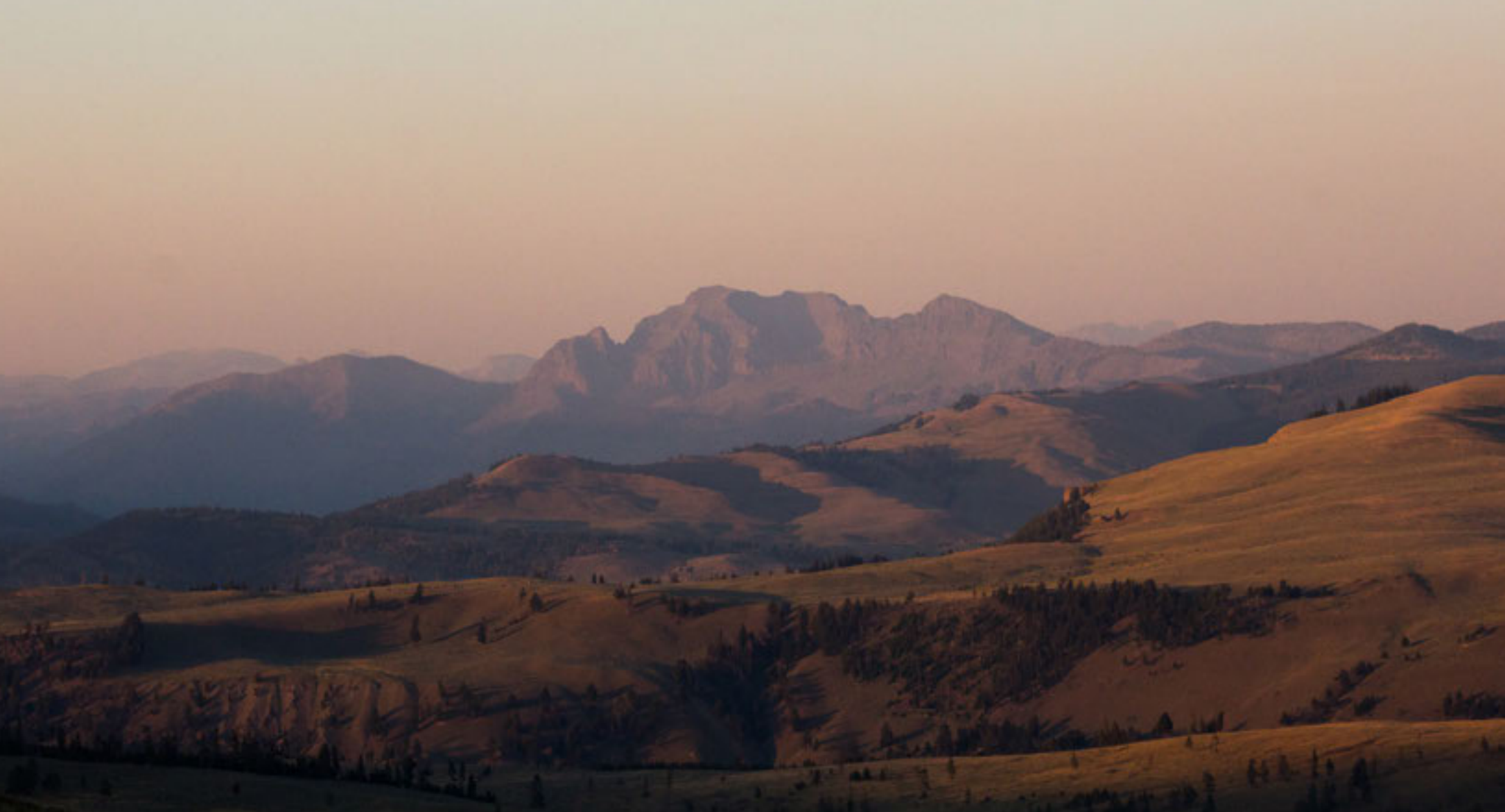
Landscape, Lamar Valley, Yellowstone National Park