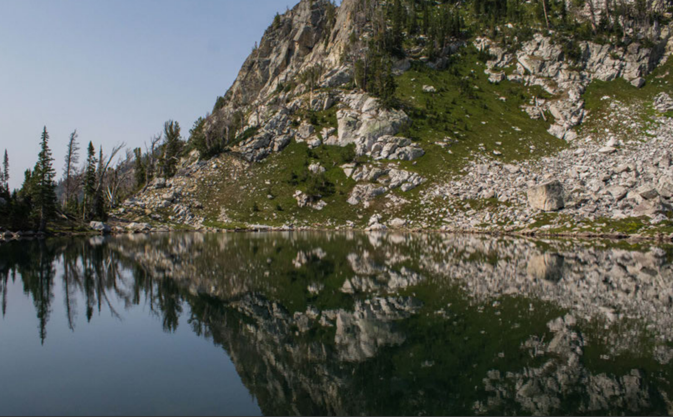
Surprise Lake, Grand Teton National Park