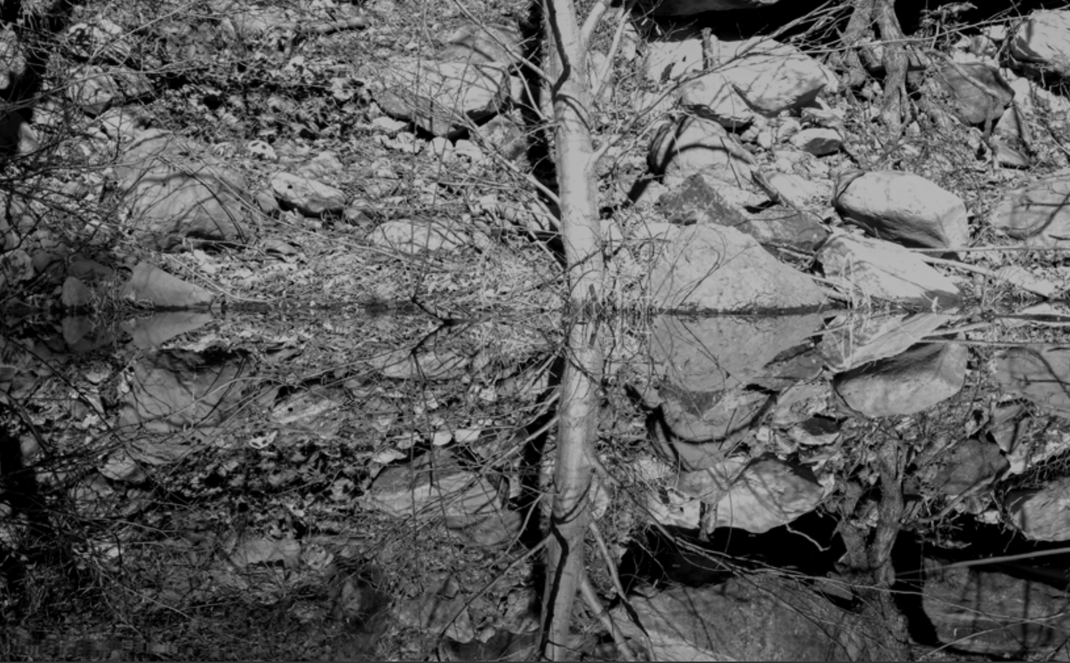
Mirroring River, Sedona