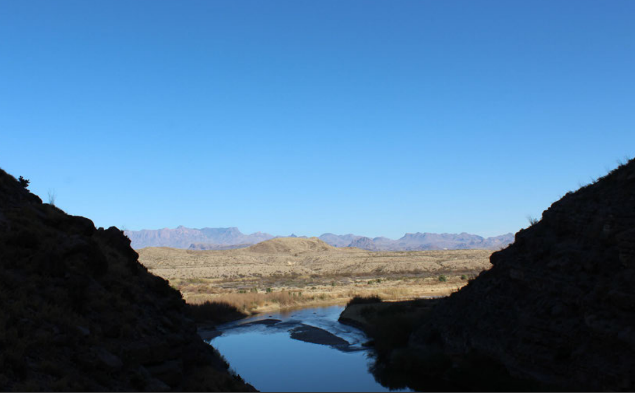
The Rio Grande River at the Mexican Border, Big Bend National Park