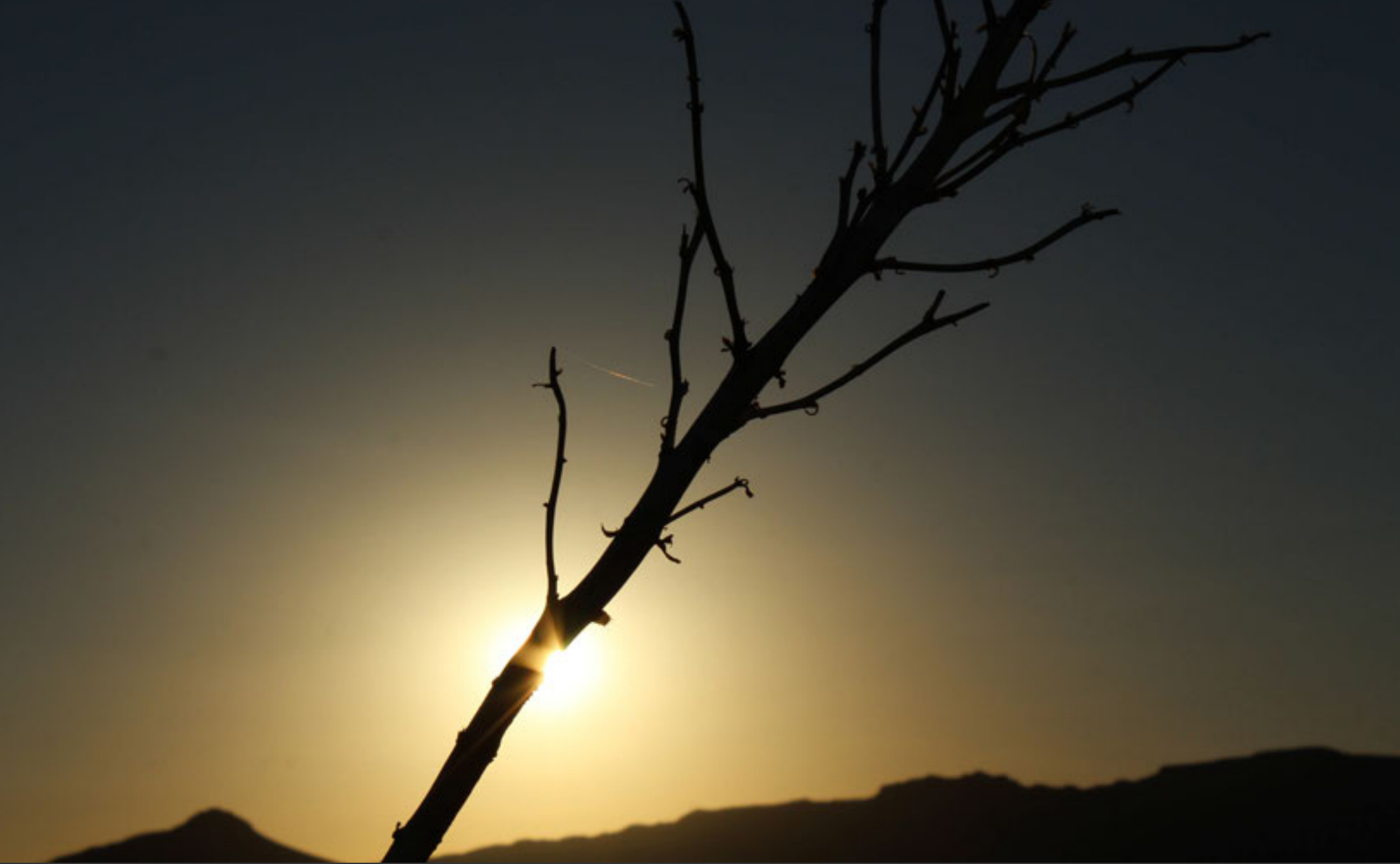
Dead Yucca Plant, Big Bend National Park