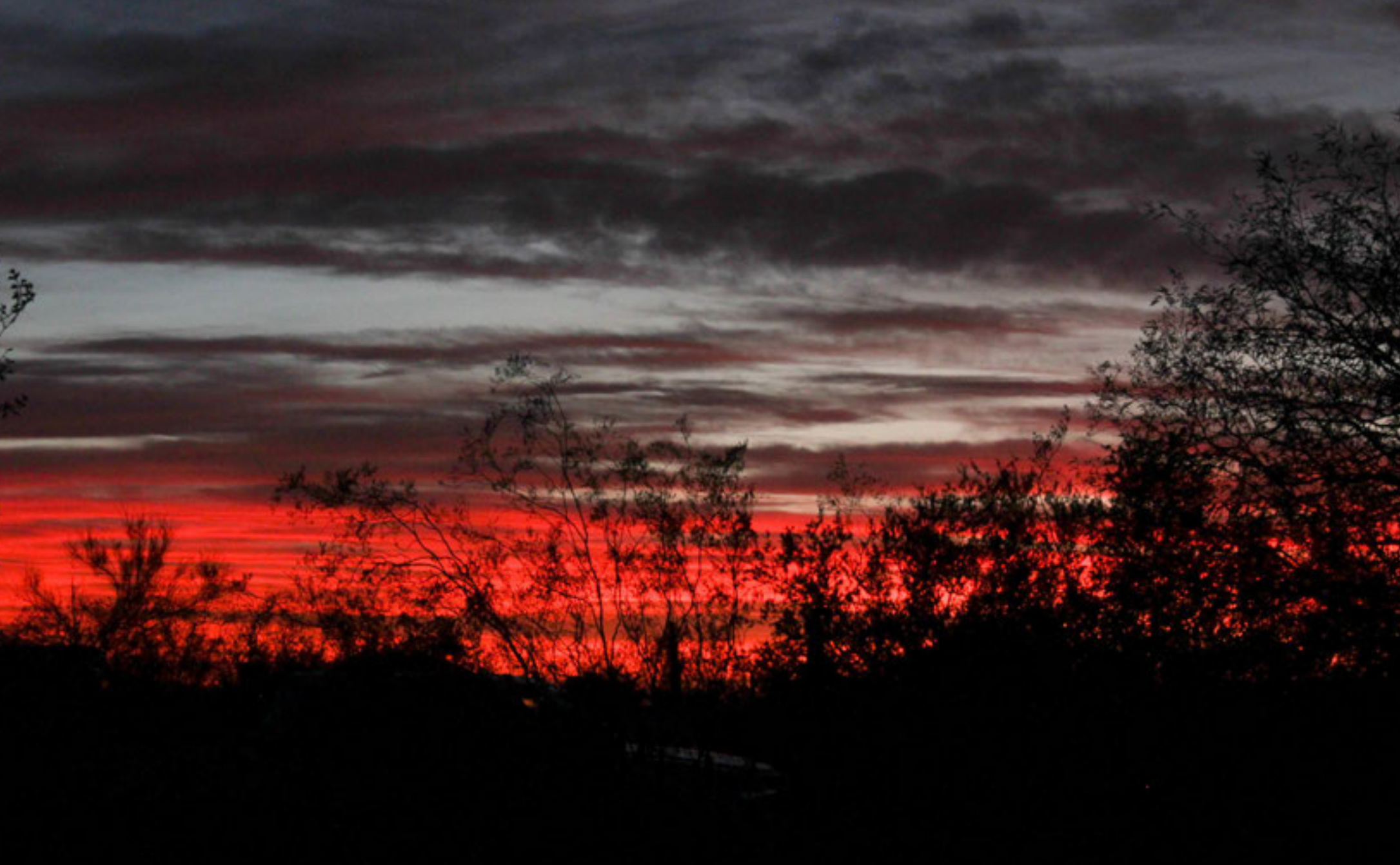
Setting Sun, Saguaro National Park