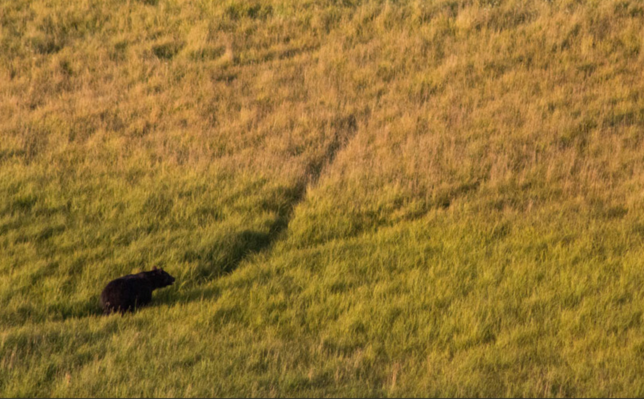
Grizzly Bear, Hayden Valley, Yellowstone National Park