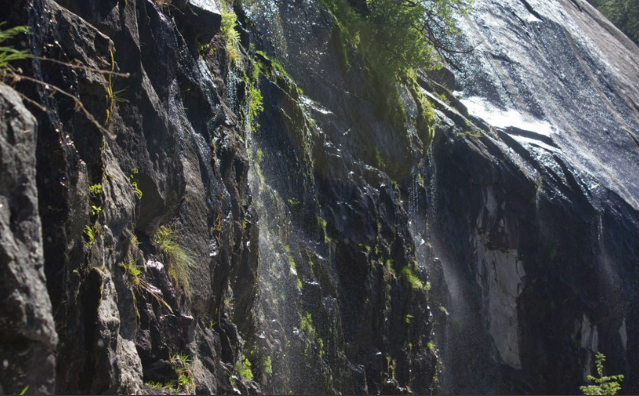
Dripping Water, Yosemite National Park