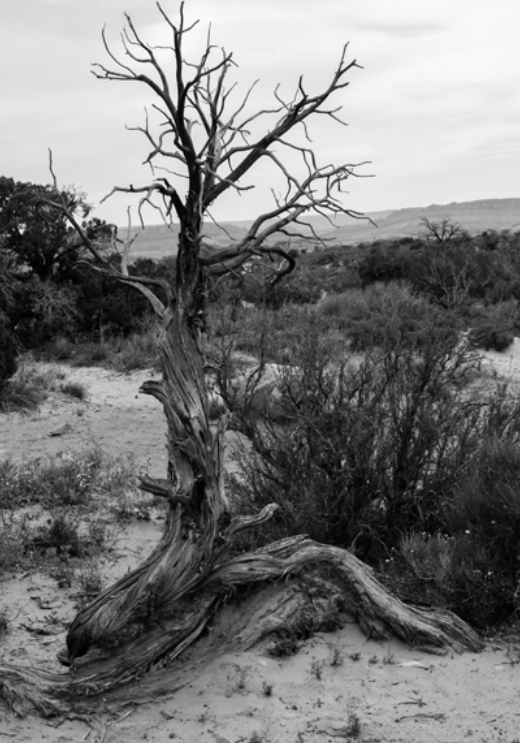
Dead Tree, Arches National Park