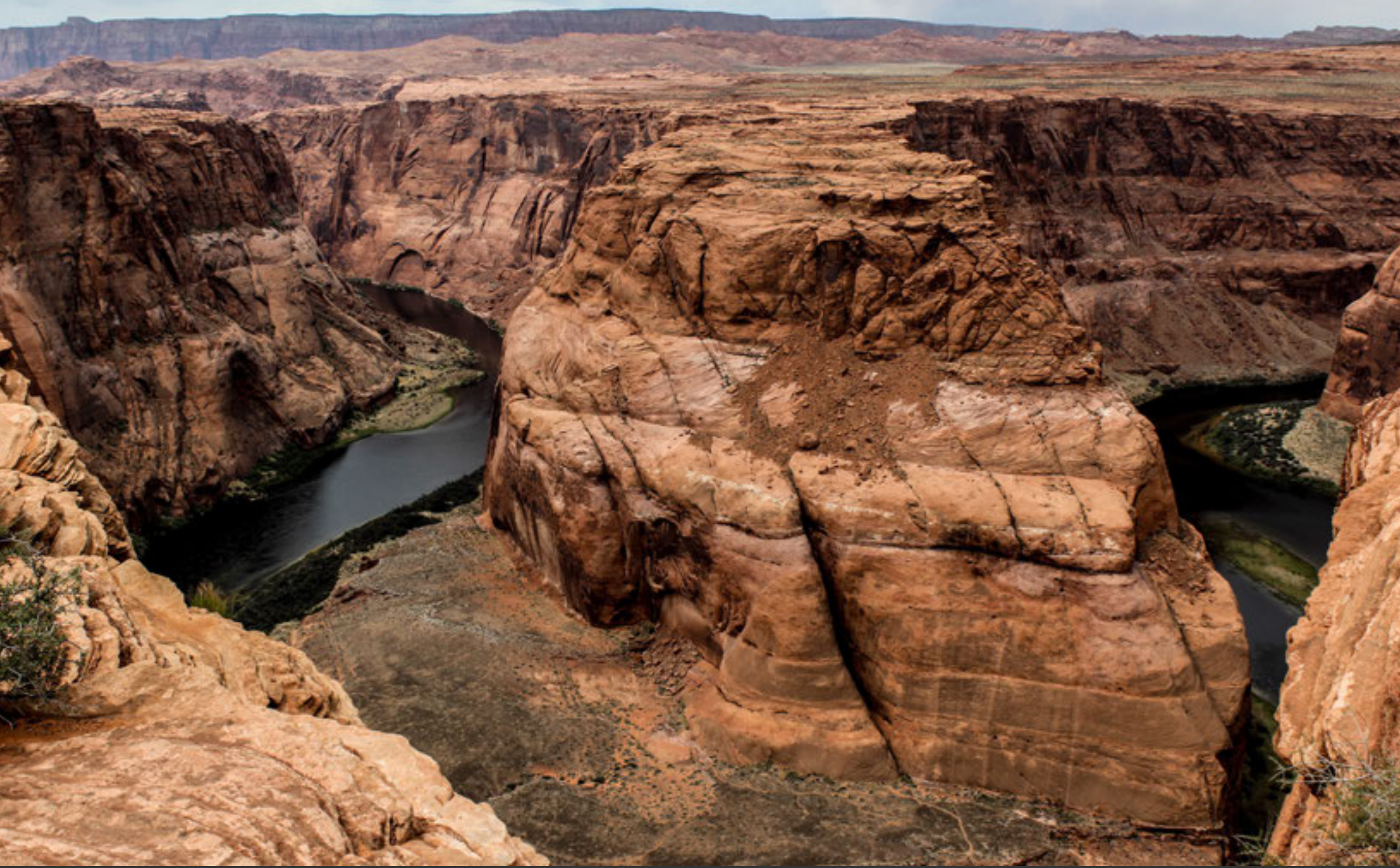
Horseshoe Bend, Colorado River