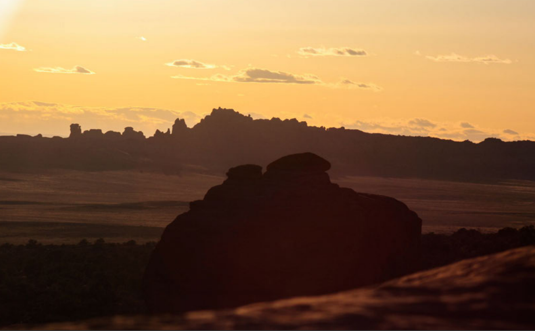
Sunset, Arches National Park