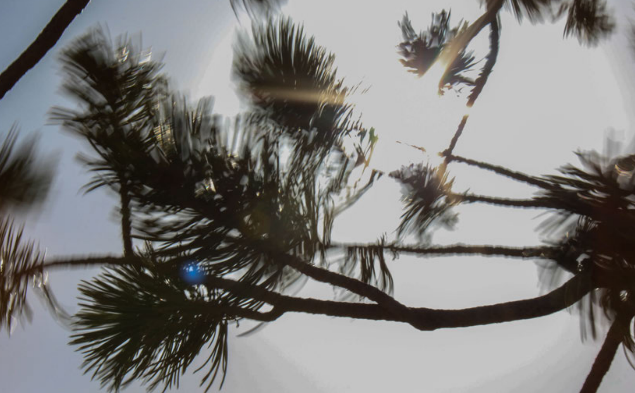
Pine in the Wind, Bryce Canyon National Park