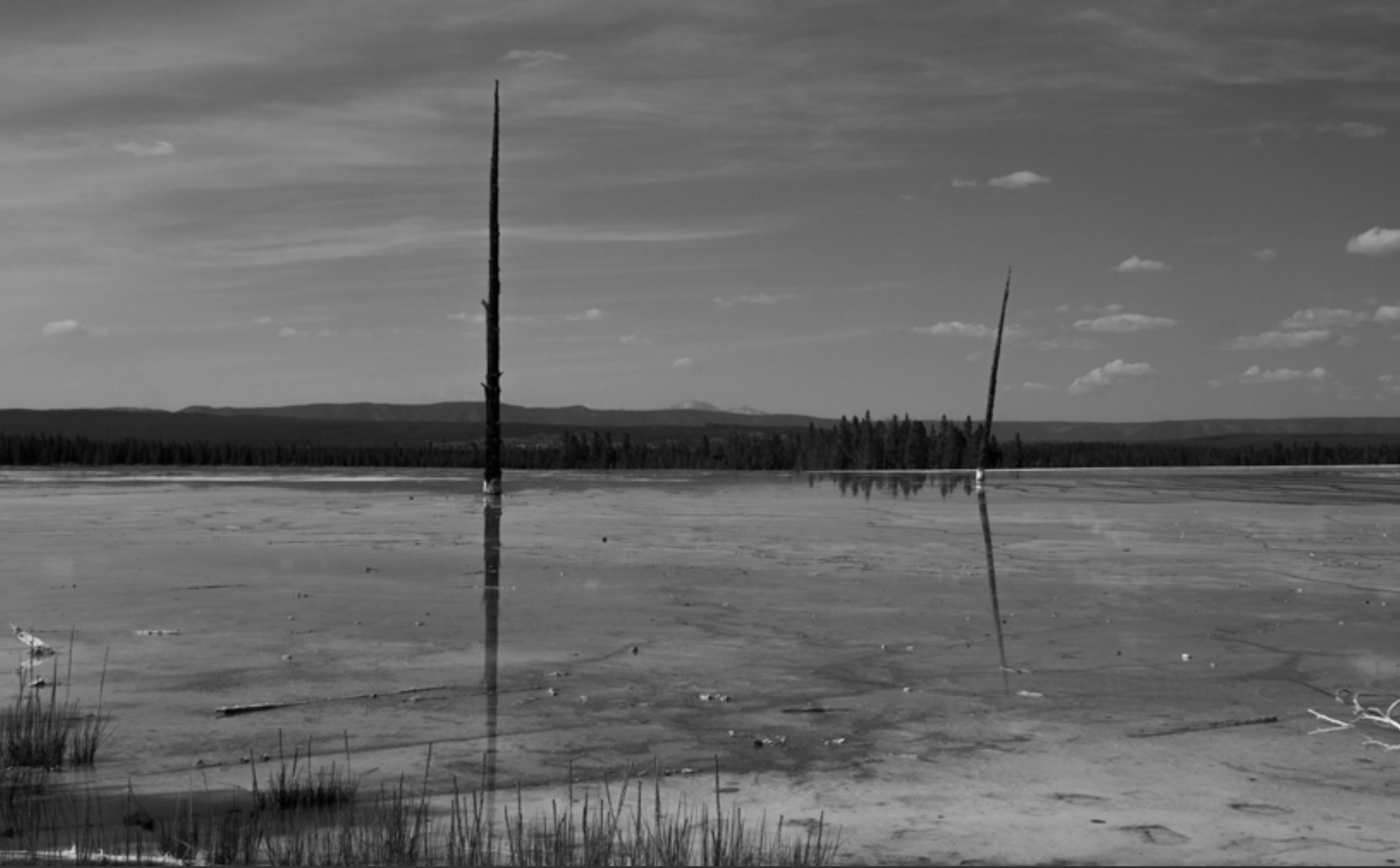
Dead Trees, Chromatic Spring, Yellowstone National Park