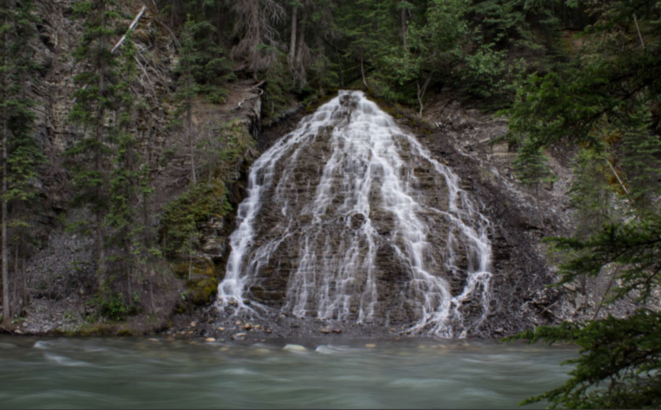
Waterfall, Jasper National Park