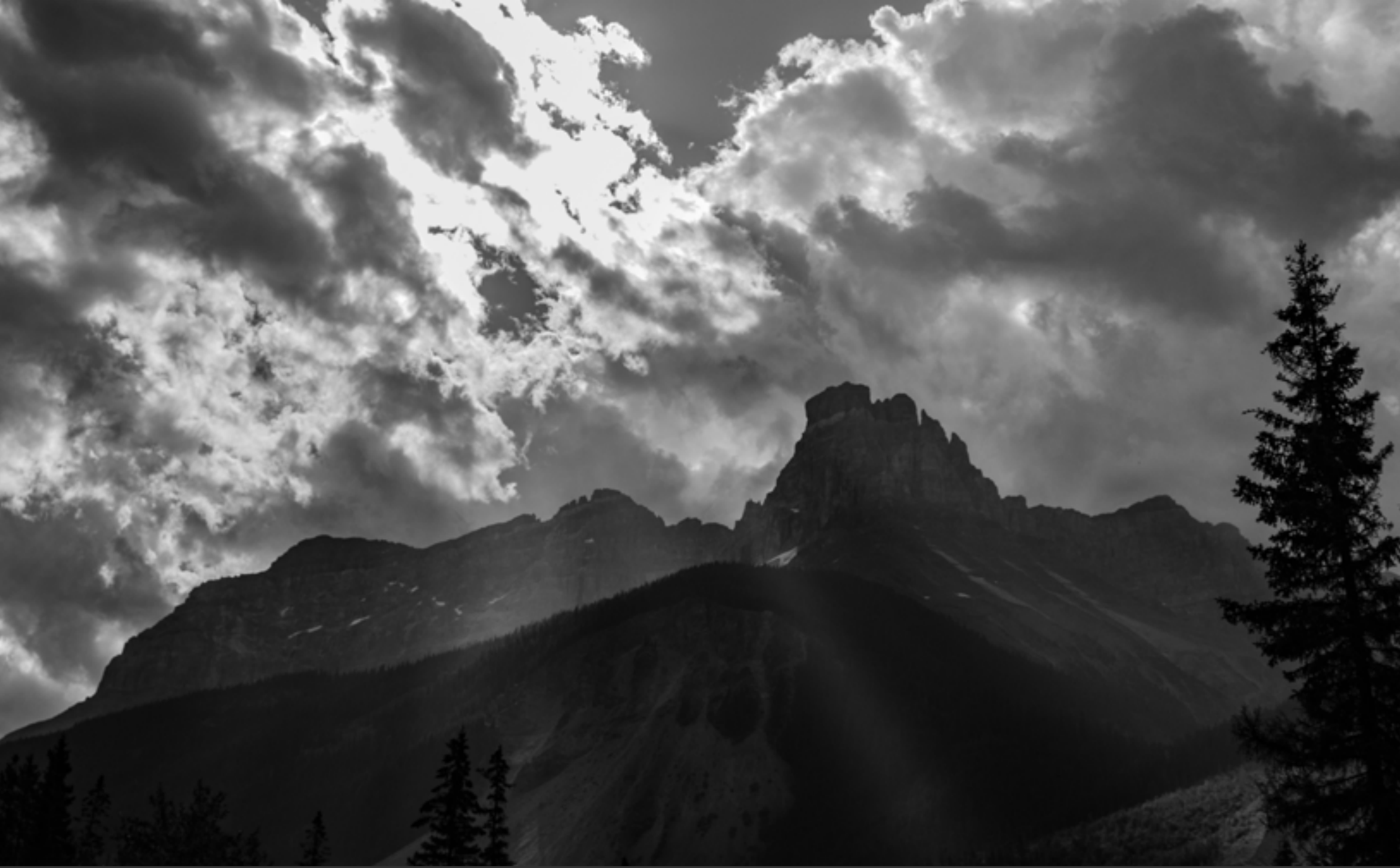
Cathedral Mountain, Yoho National Park