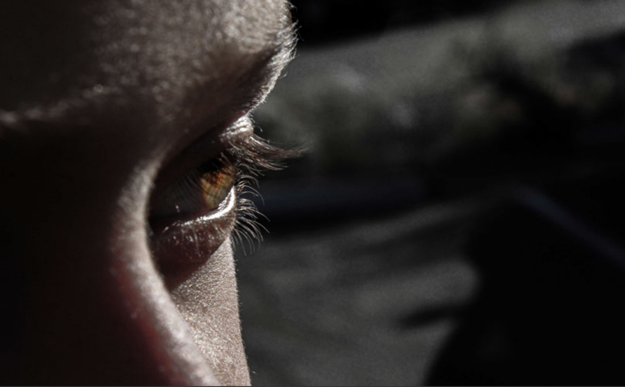
Close-up of an Eye