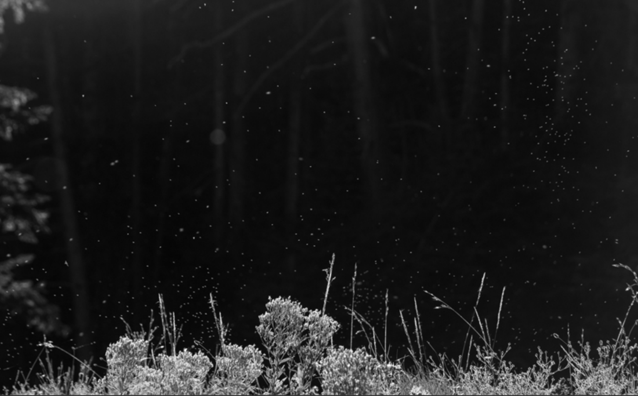
Flies, Yellowstone National Park