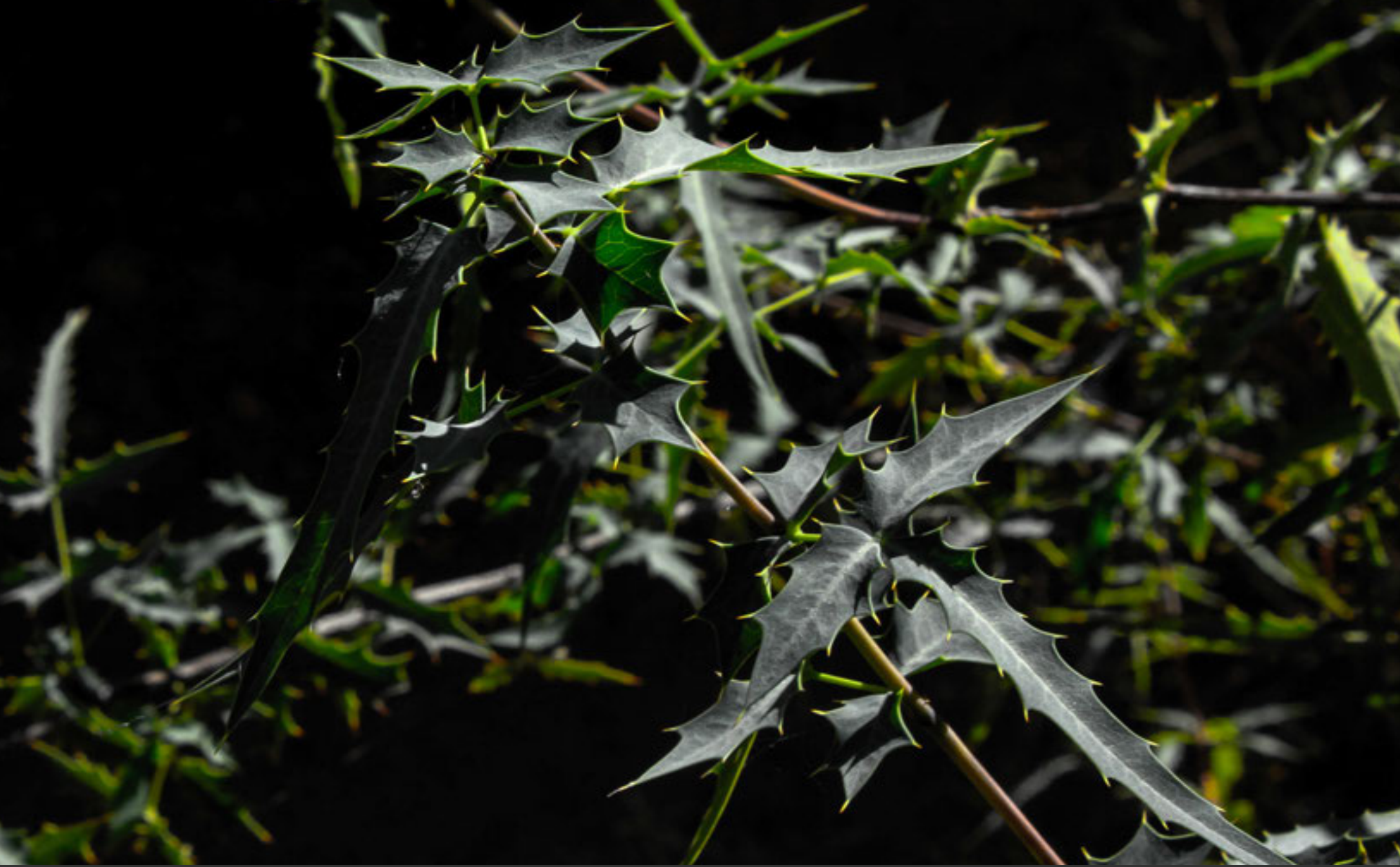
Leaves, Saguaro National Park