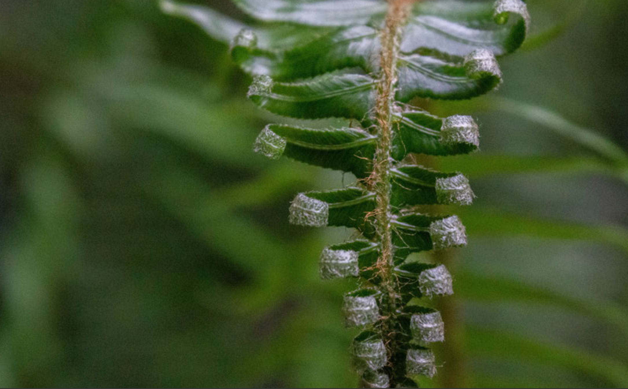
Curling Fern, Redwood National Park