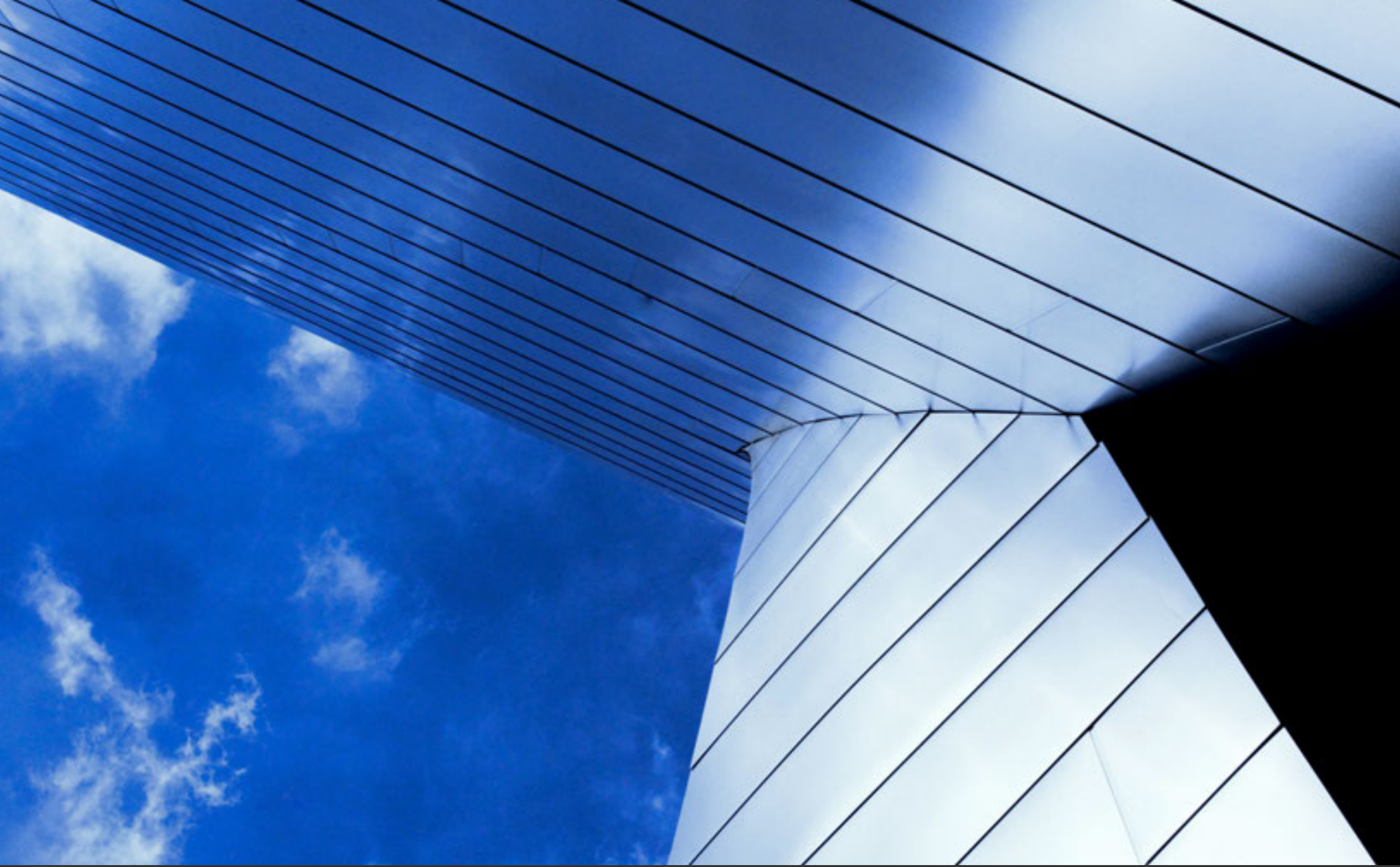
The Disney Concert Hall, Los Angeles