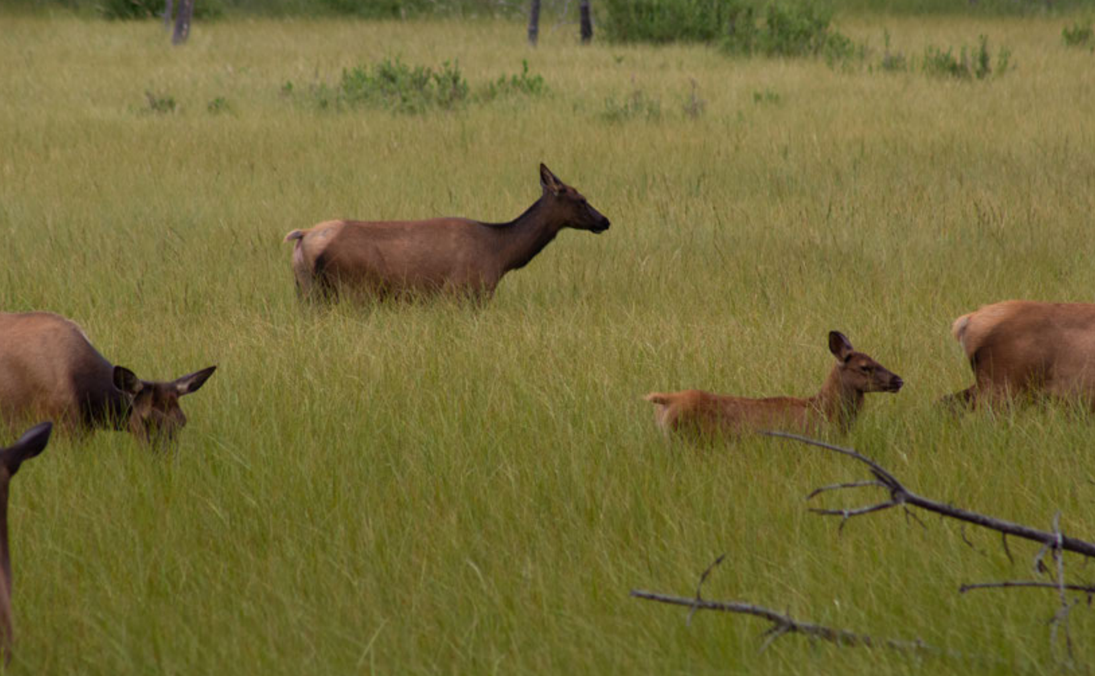
Elk Herd, Banff National Park