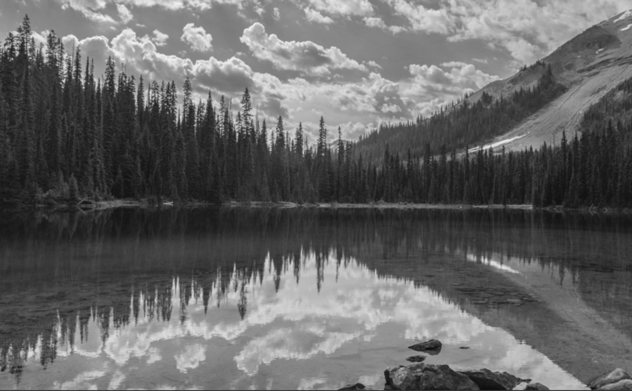
Yoho Lake, Yoho National Park