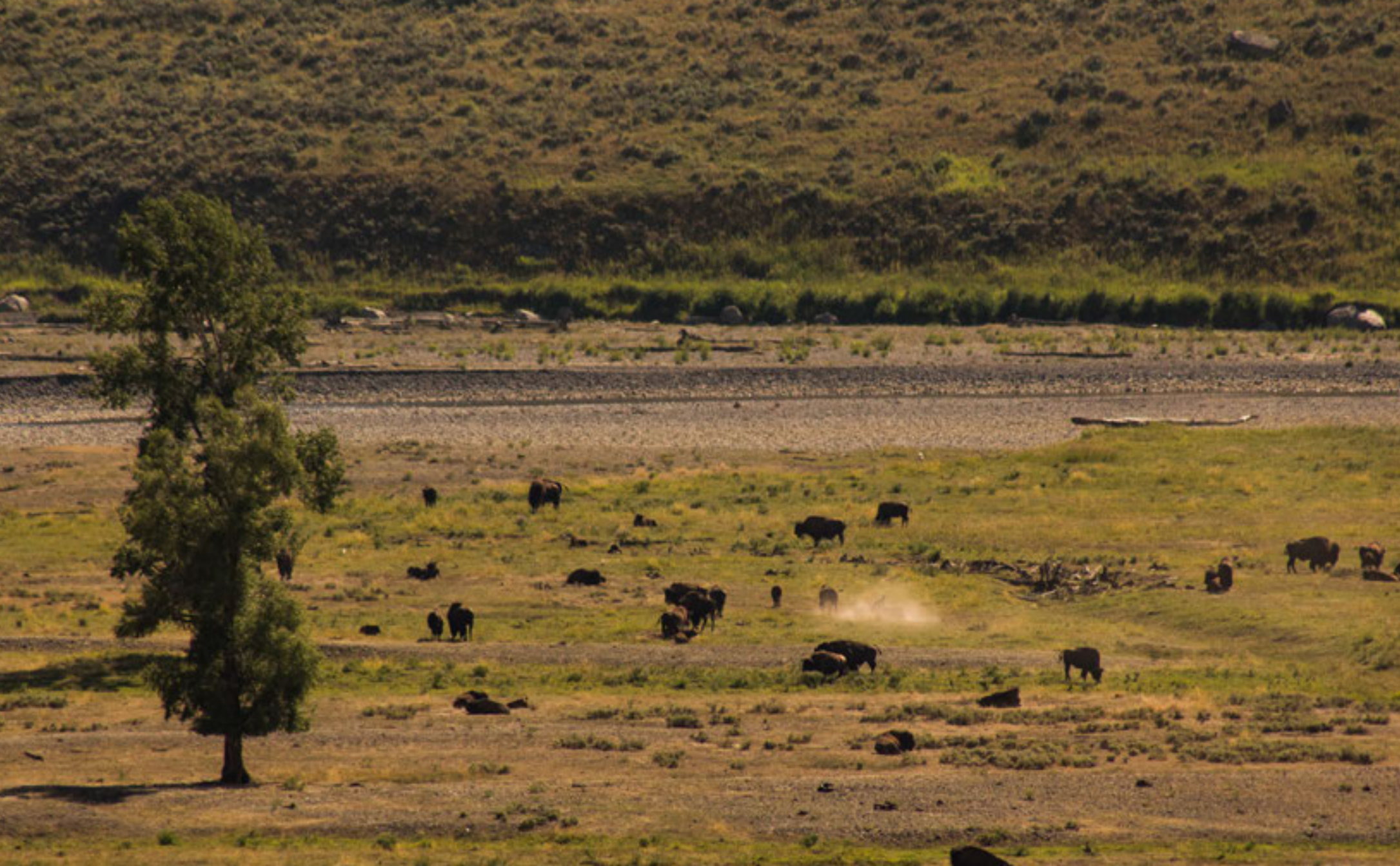
Bison, Lamar Valley, Yellowstone National Park