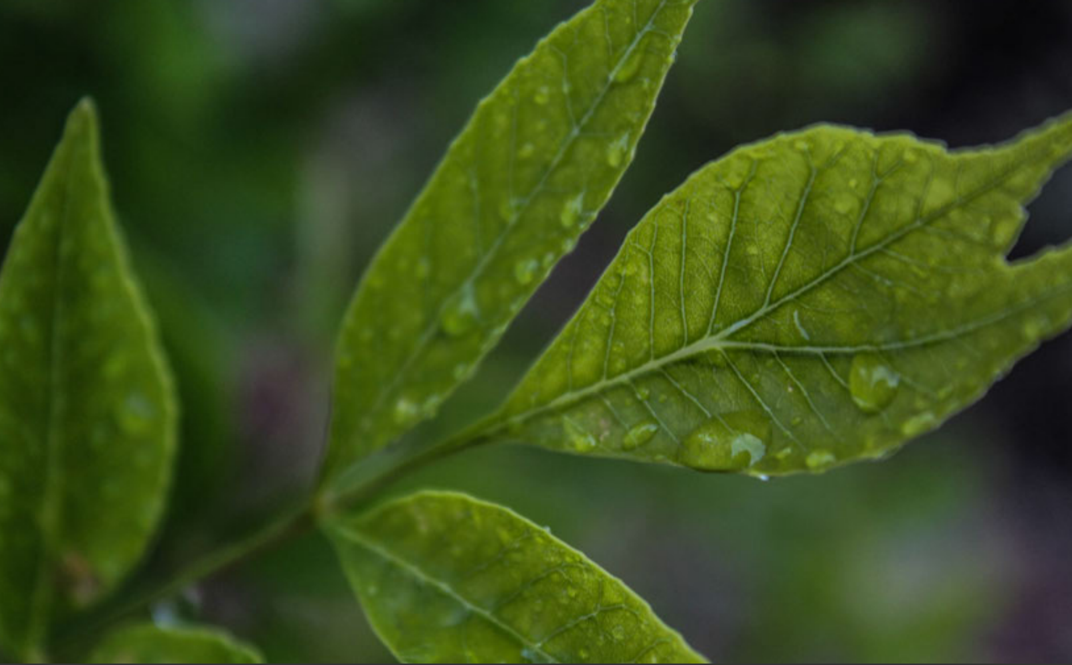
Leaves, Zion National Park