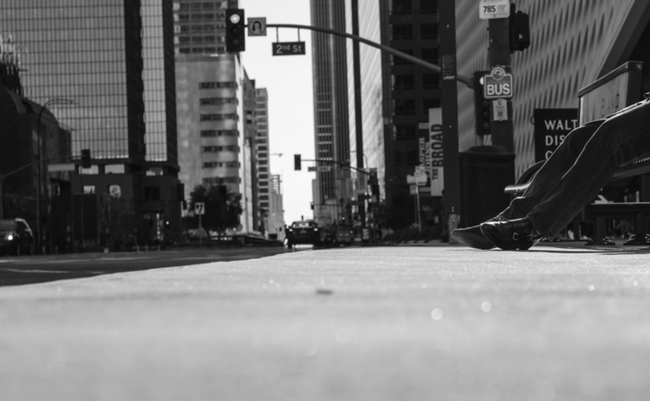
Grand Avenue at 2nd Street, Los Angeles