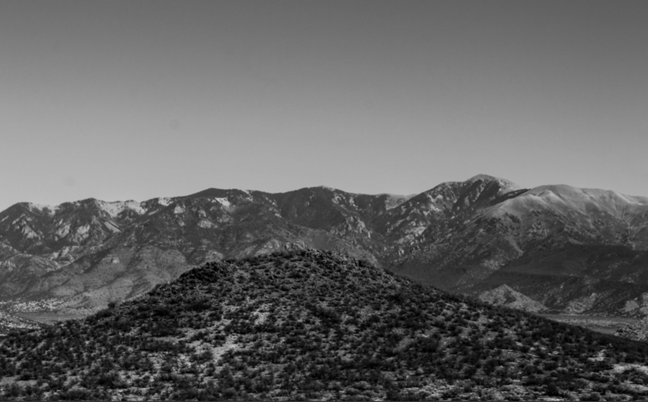
Landscape, Three Rivers Petroglyph National Monument