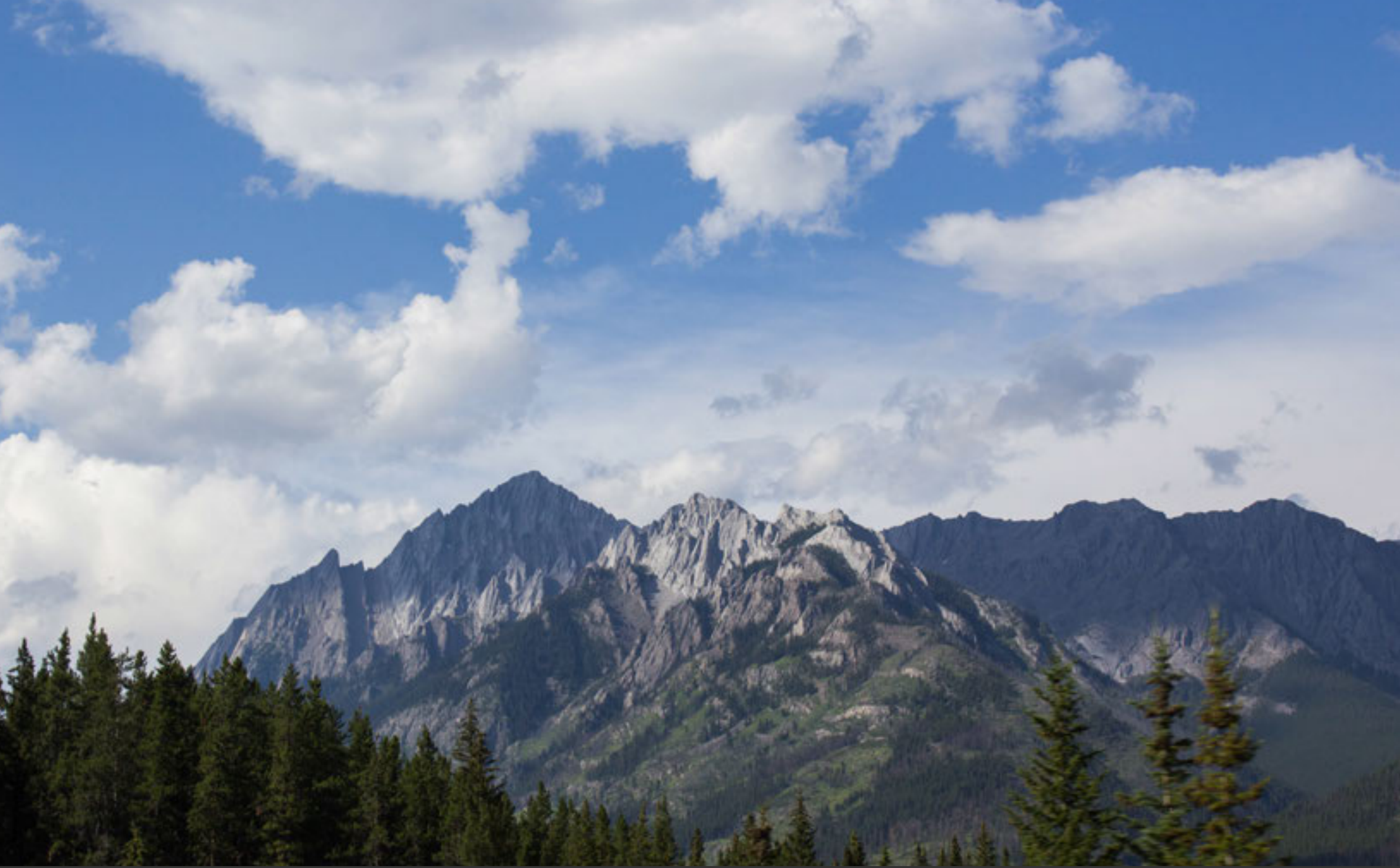
Elizabeth Range, Jasper National Park