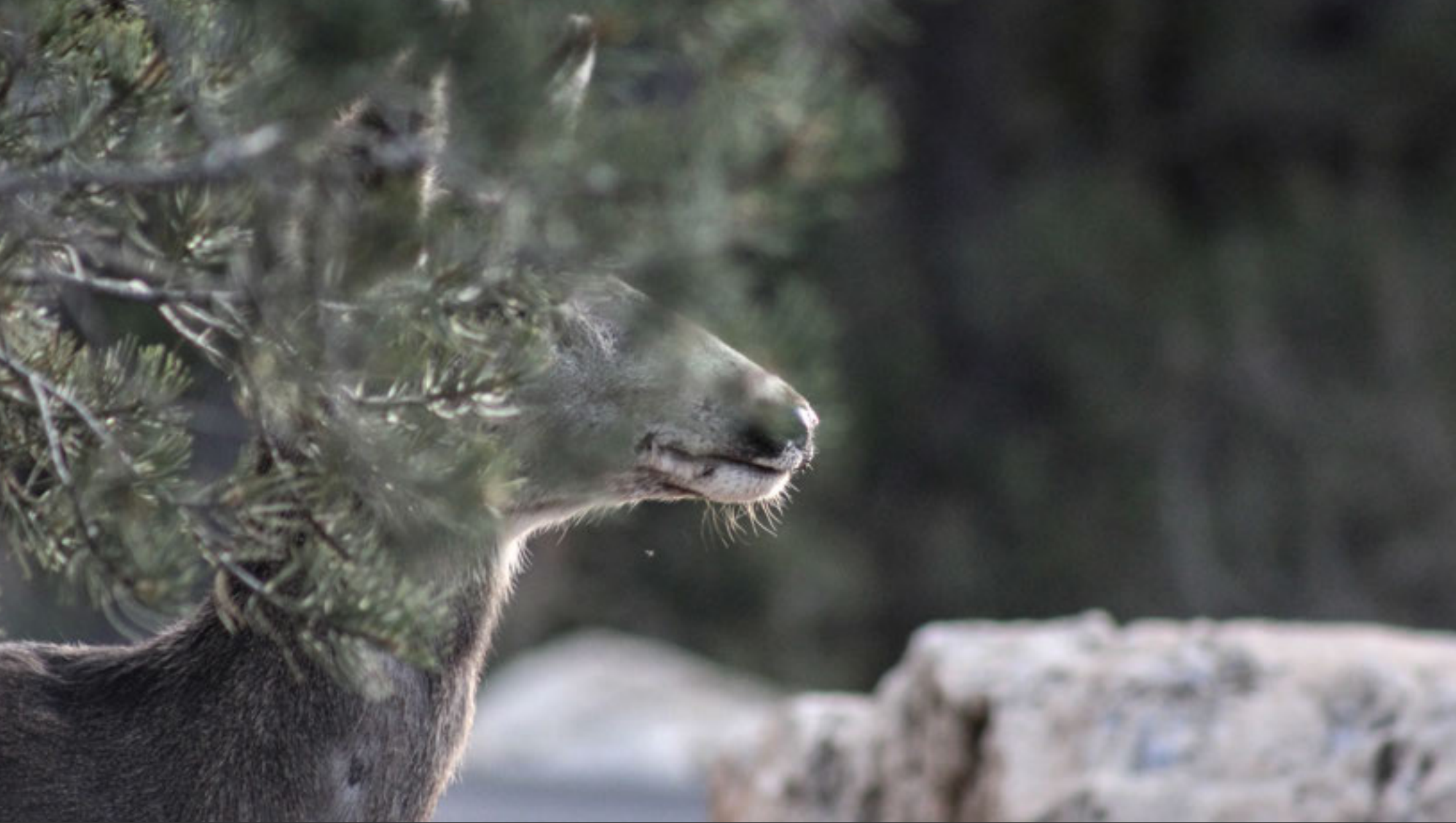
Mule Deer, Grand Canyon National Park