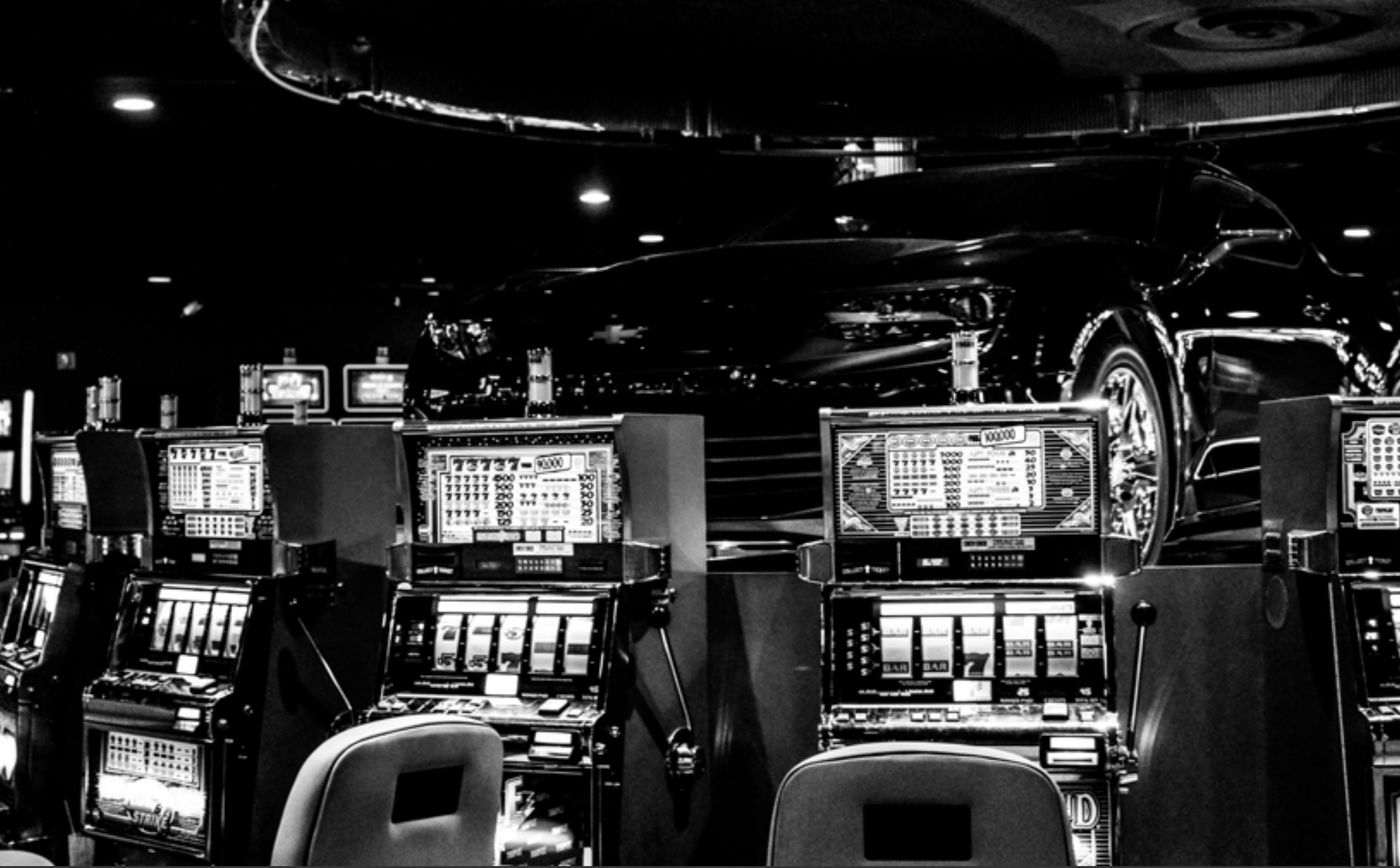
Circus Circus, Las Vegas