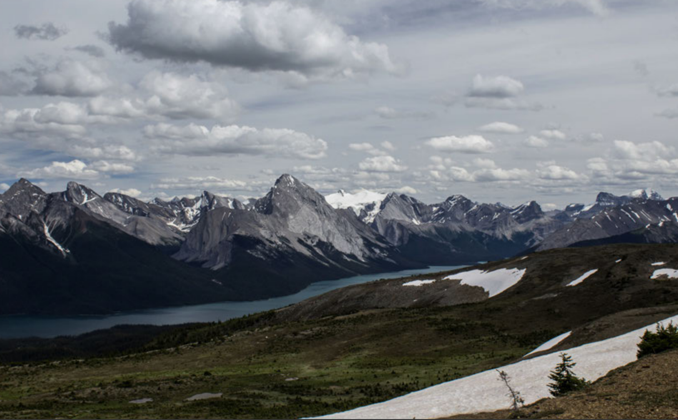
Maligne Lake, Jasper National Park