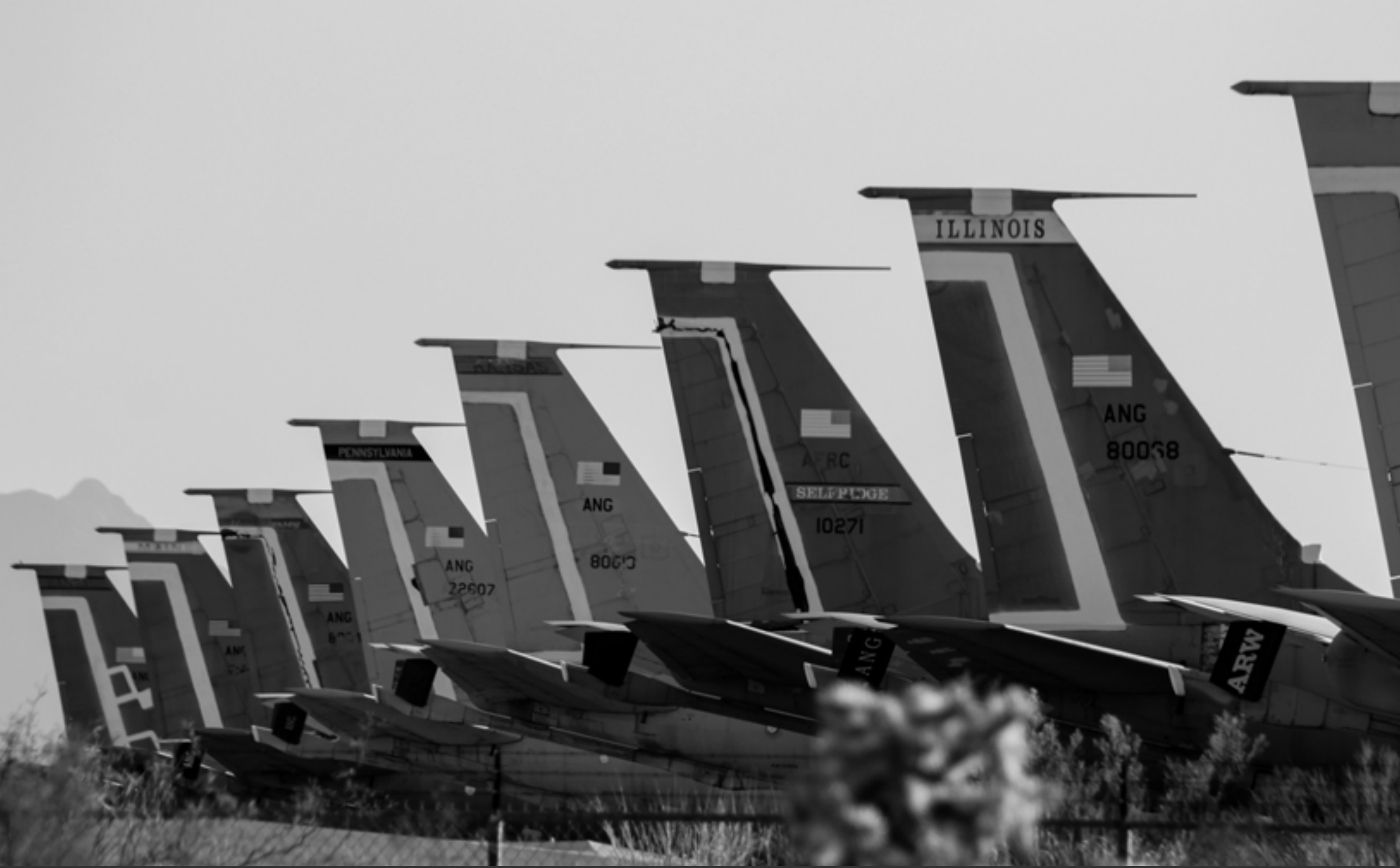
Airforce Base, Tucson