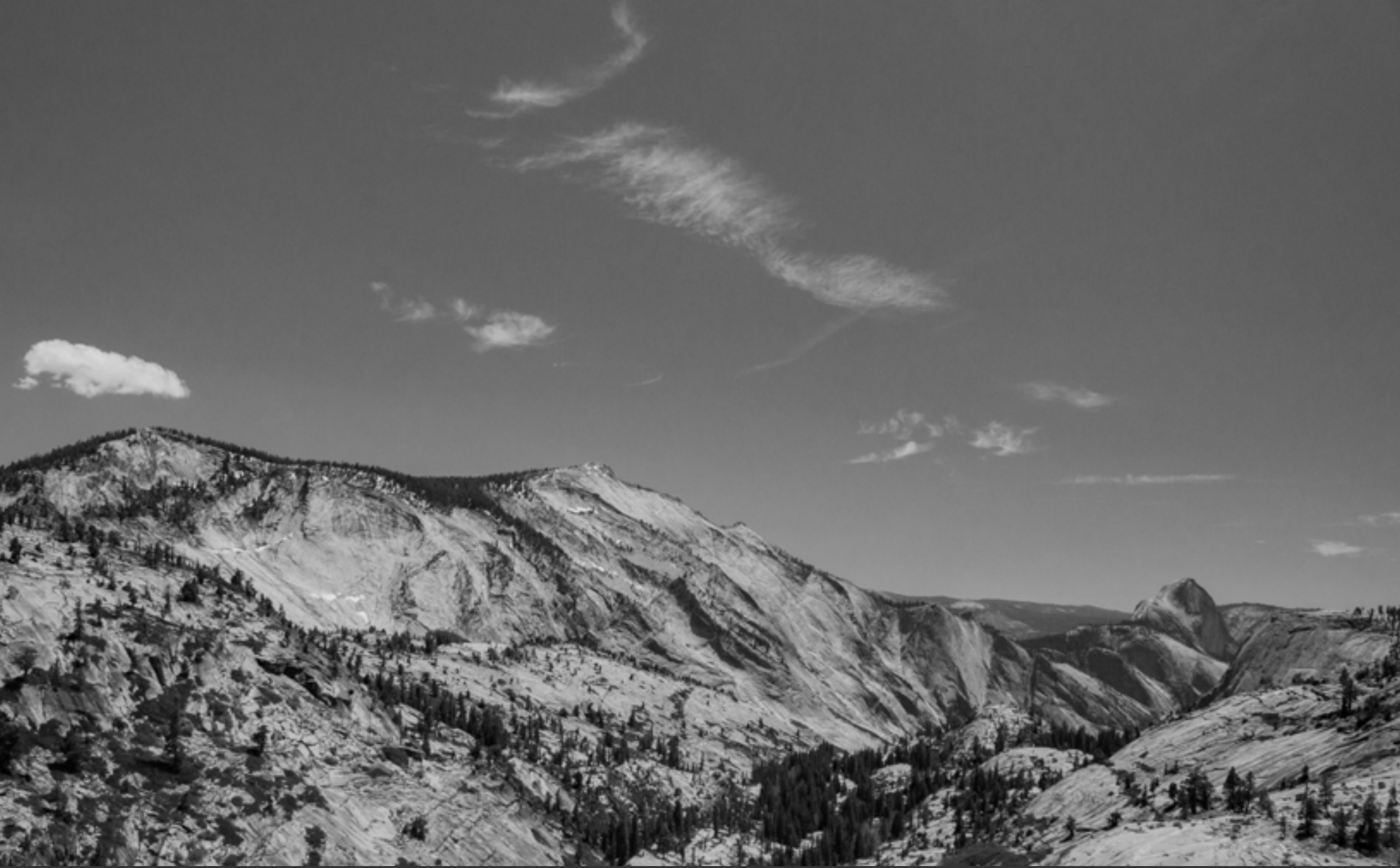
Landscape, Yosemite National Park