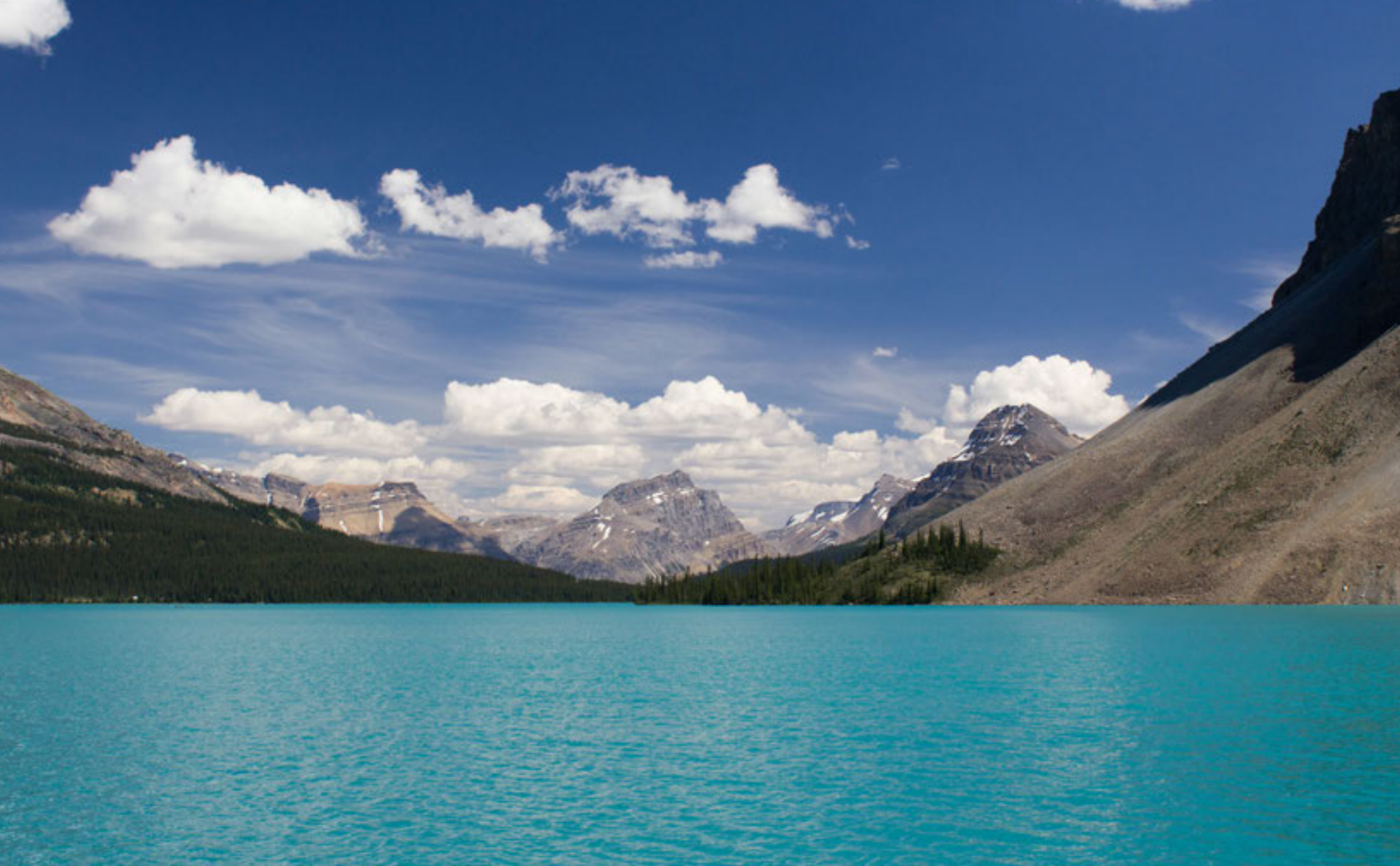
Bow Lake, Banff National Park