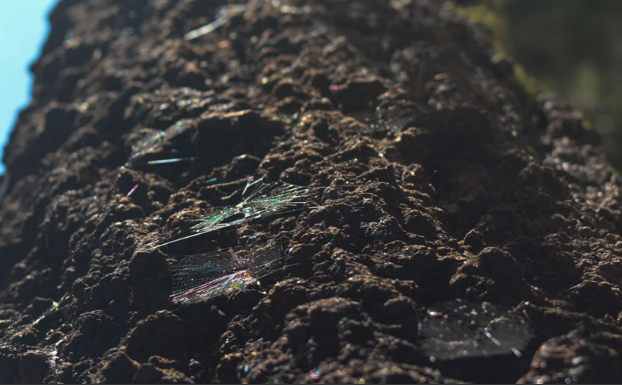
Spiderwebs, Sequoia National Park