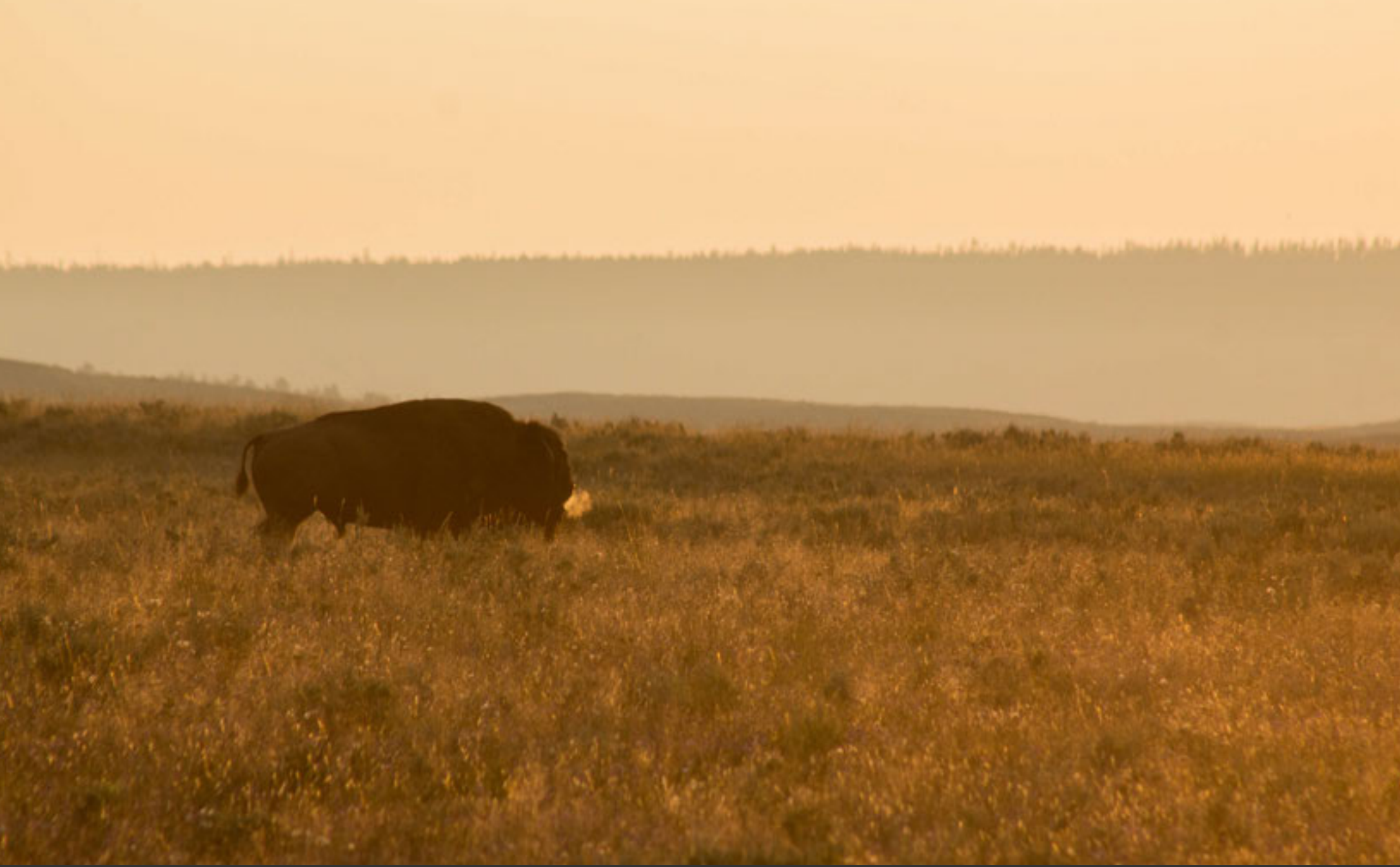
Bison, Hayden Valley, Yellowstone National Park