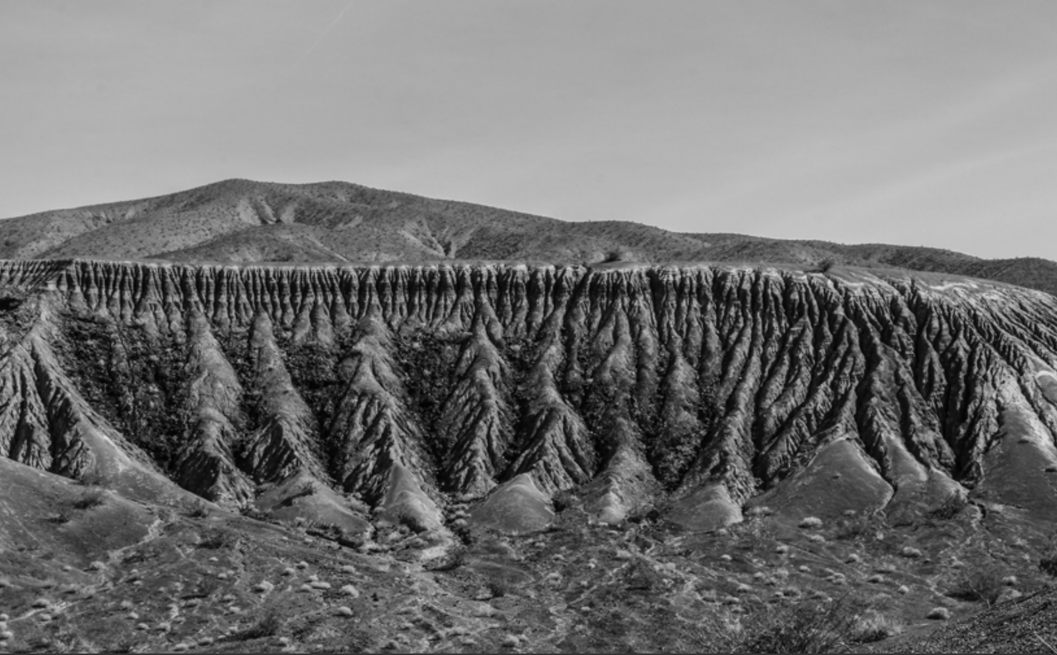
Badlands Near the Ubehebe Crater, Death Valley National Park