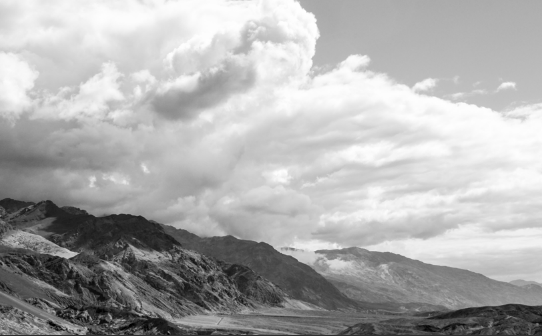
Mountains, Death Valley National Park