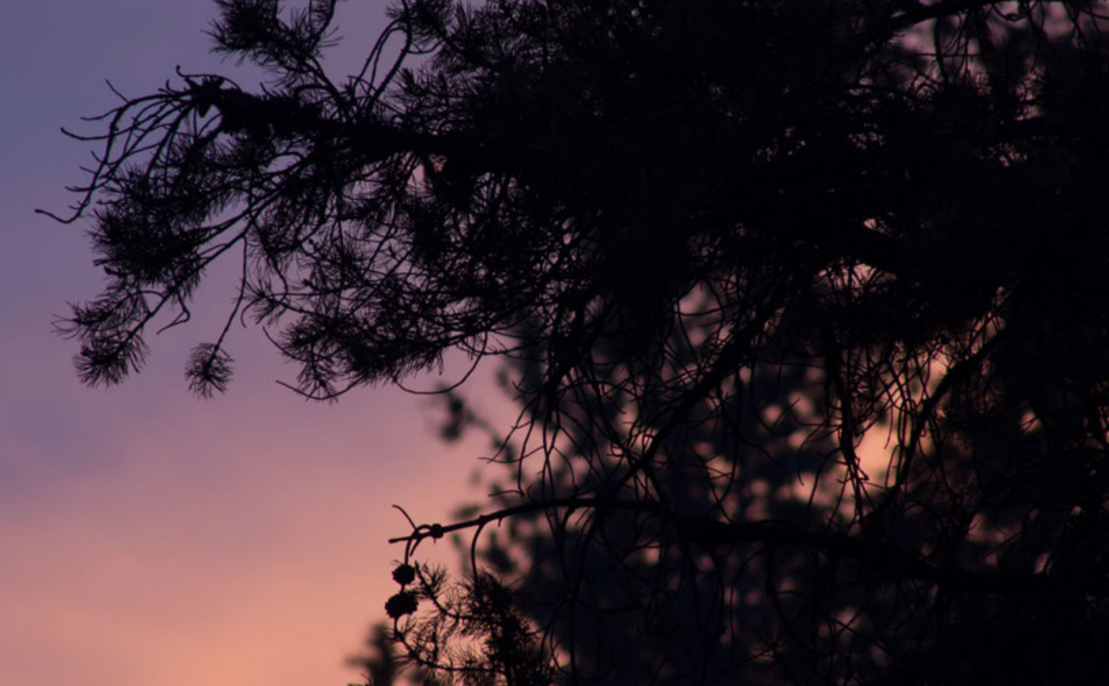
Setting Sun, Jasper National Park