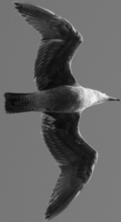
Seagull, Pacific Coast