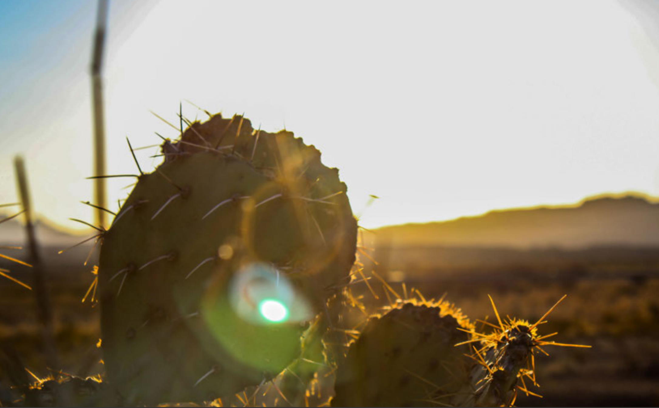
Prickly Pear Cactus, Big Bend National Park