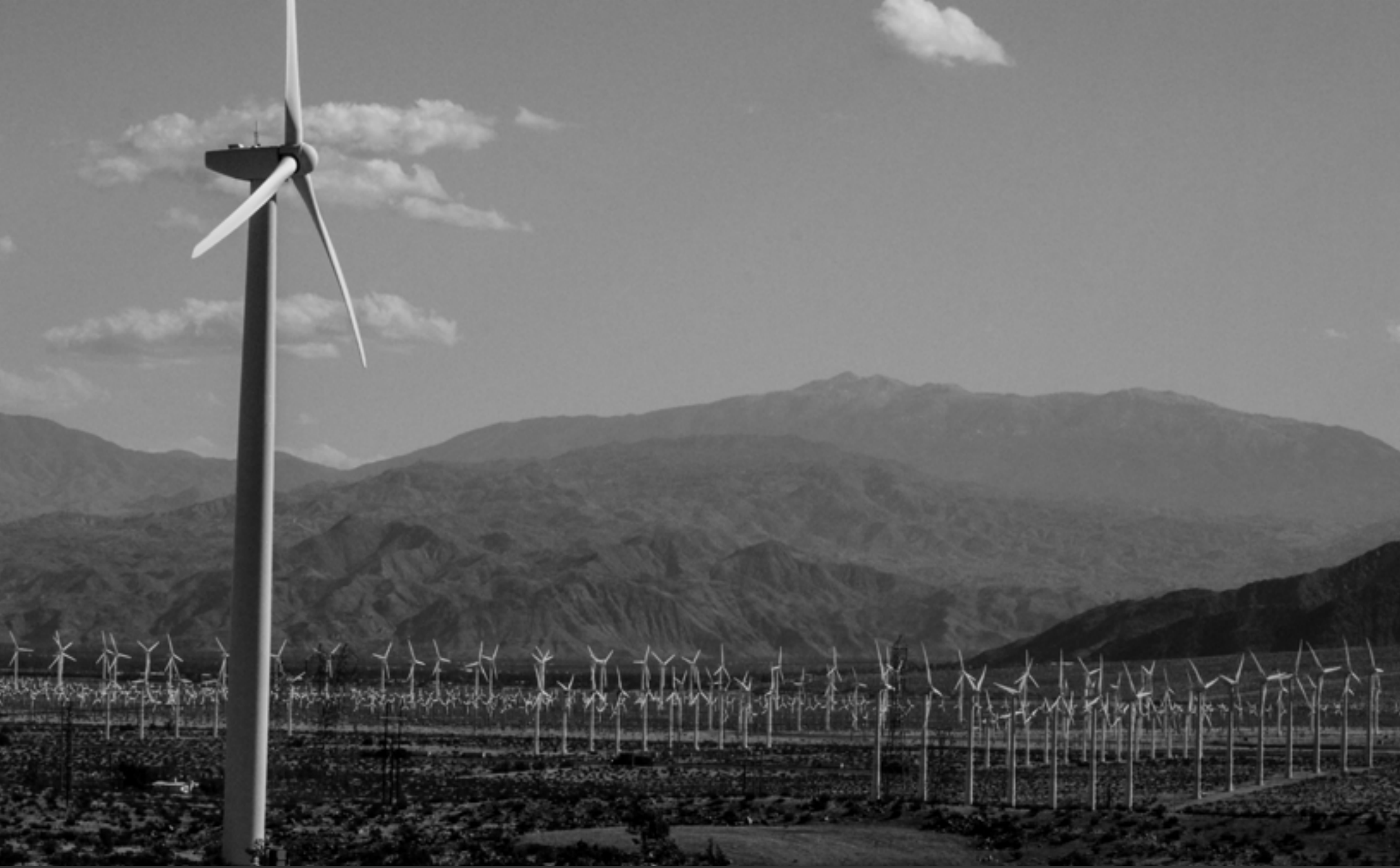
Windmills, Palm Springs, California