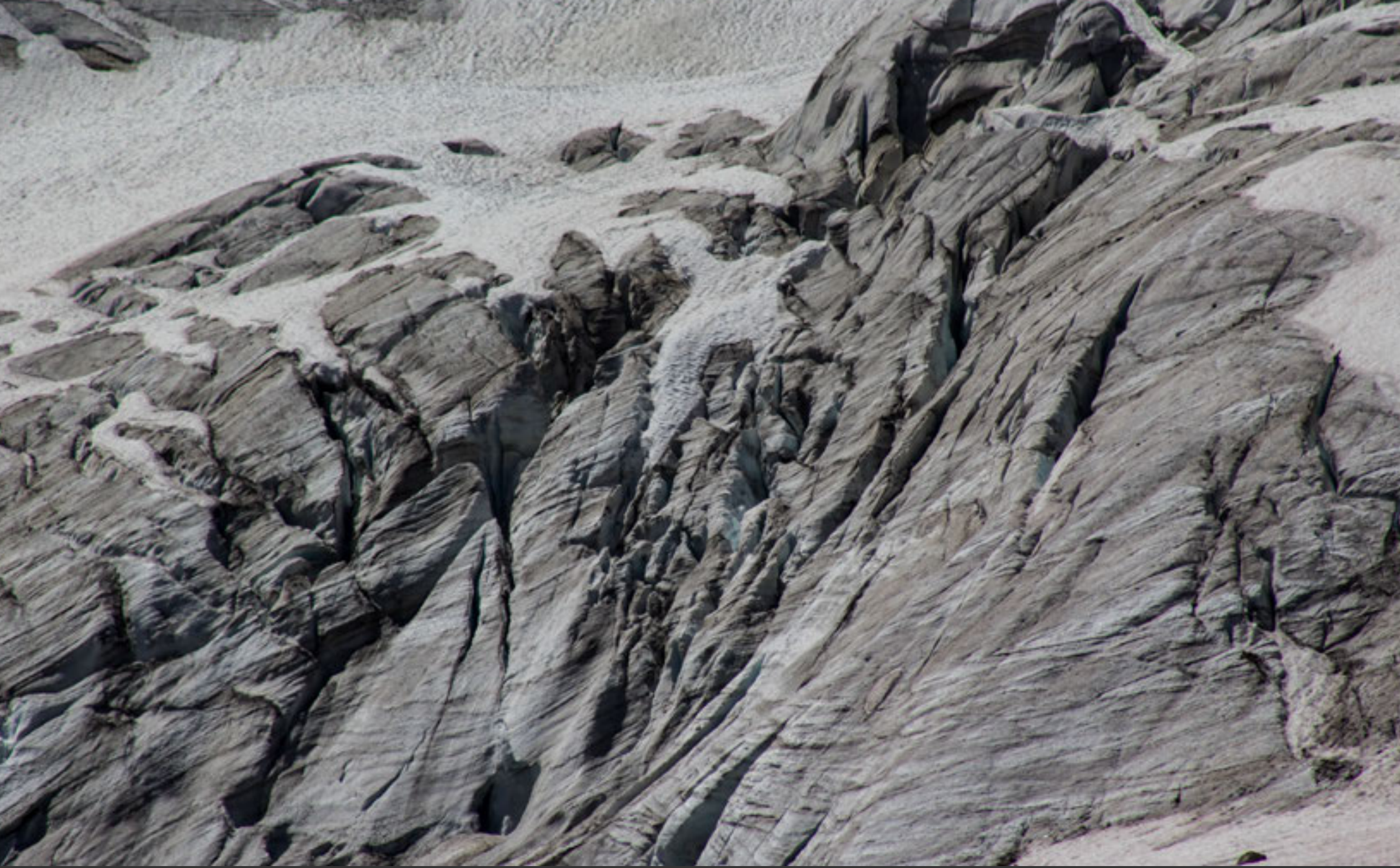
Glacier, Yoho National Park