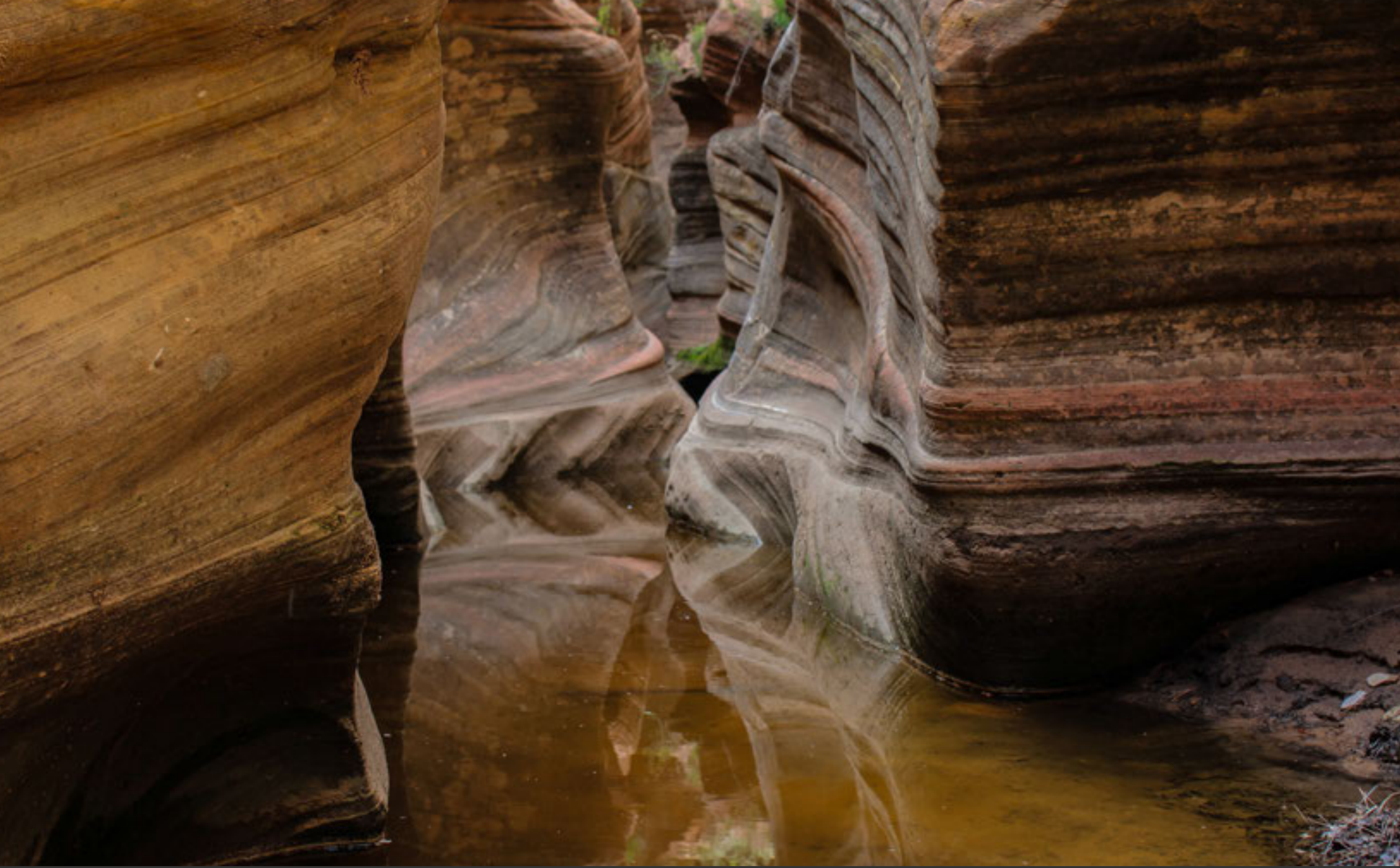
Carved Rock, Zion National Park