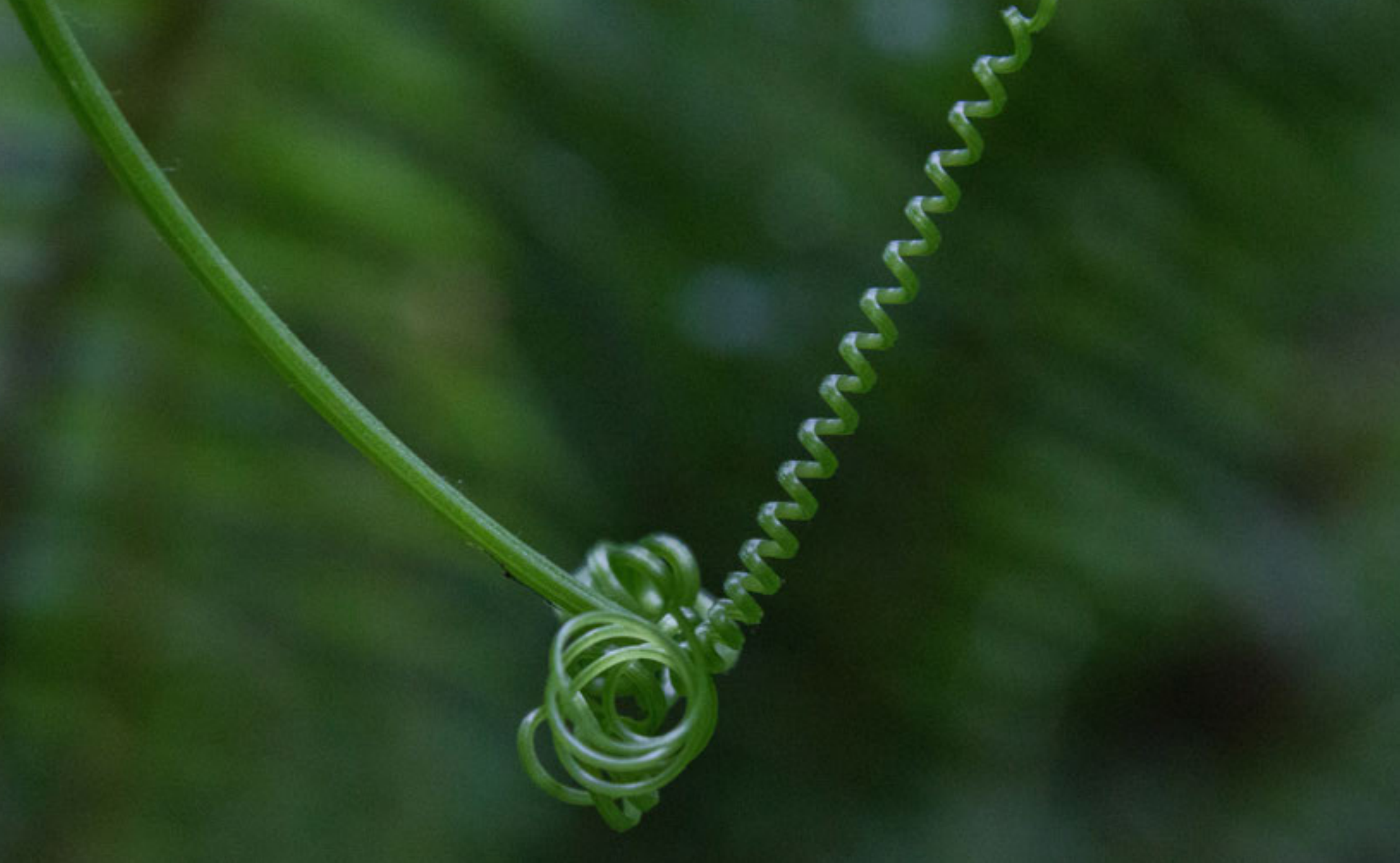
Curling Plant, Redwood National Park