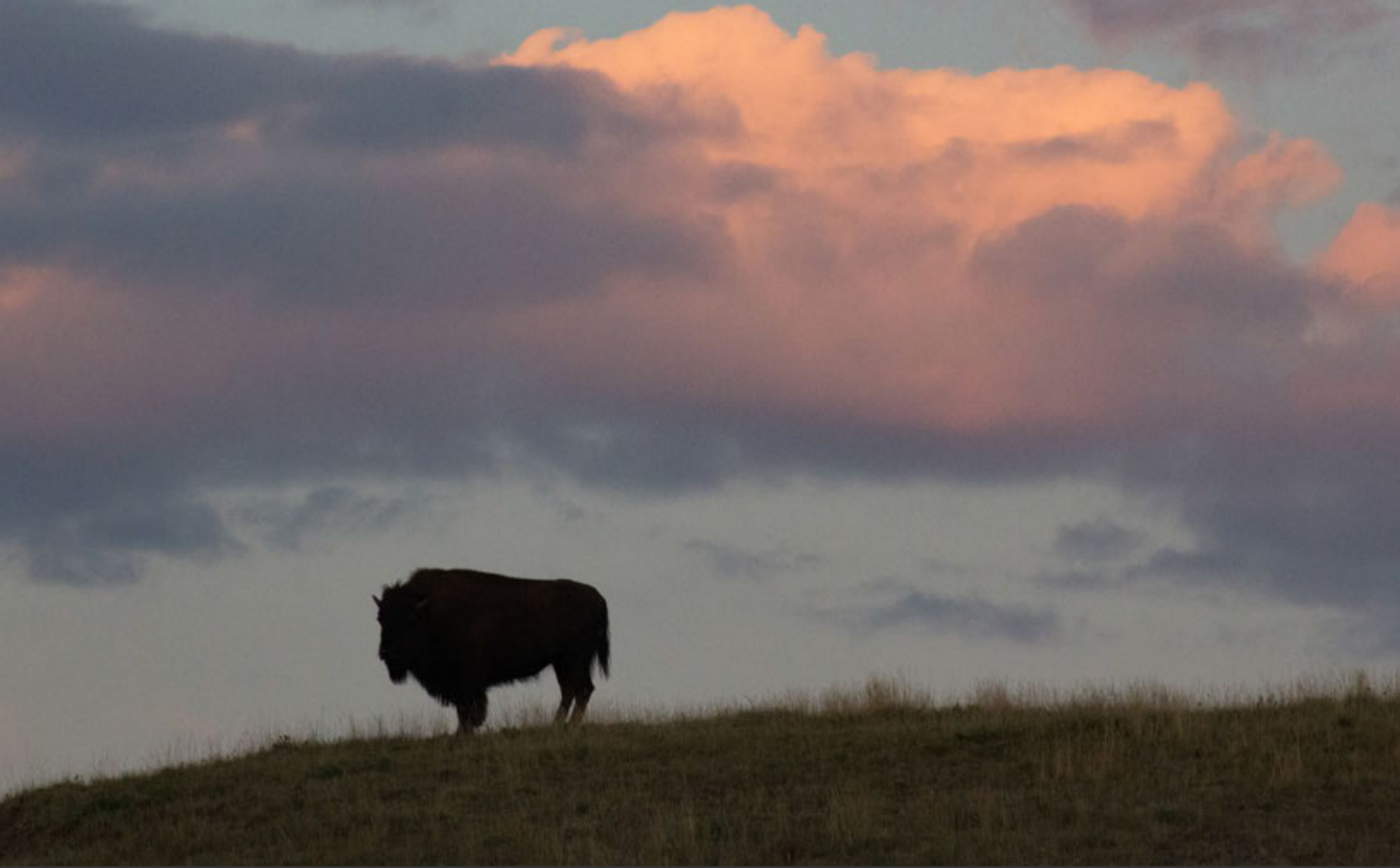
Bison, Hayden Valley, Yellowstone National Park