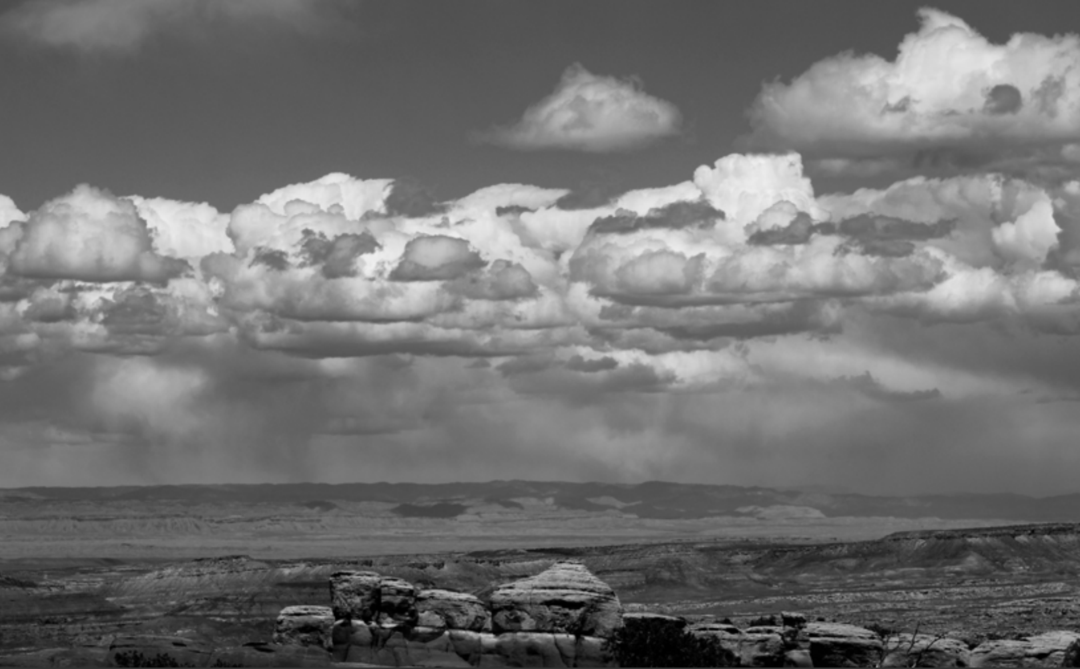
Landscape, Arches National Park