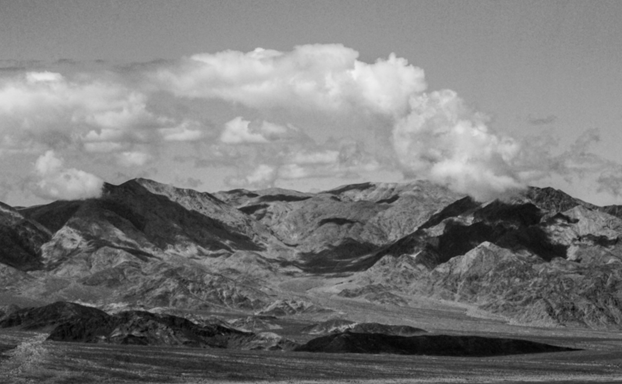
Mountains, Death Valley National Park