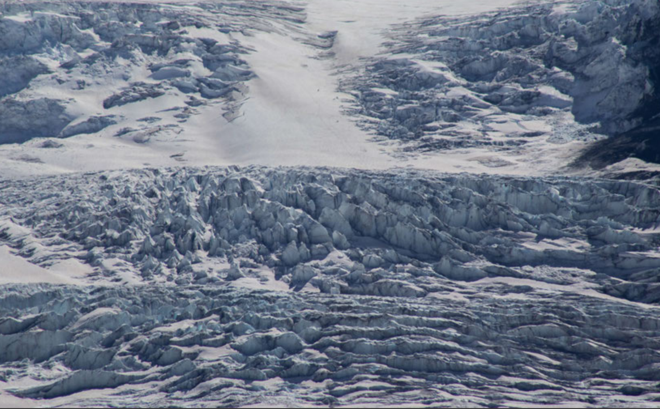
Athabasca Glacier, Canada