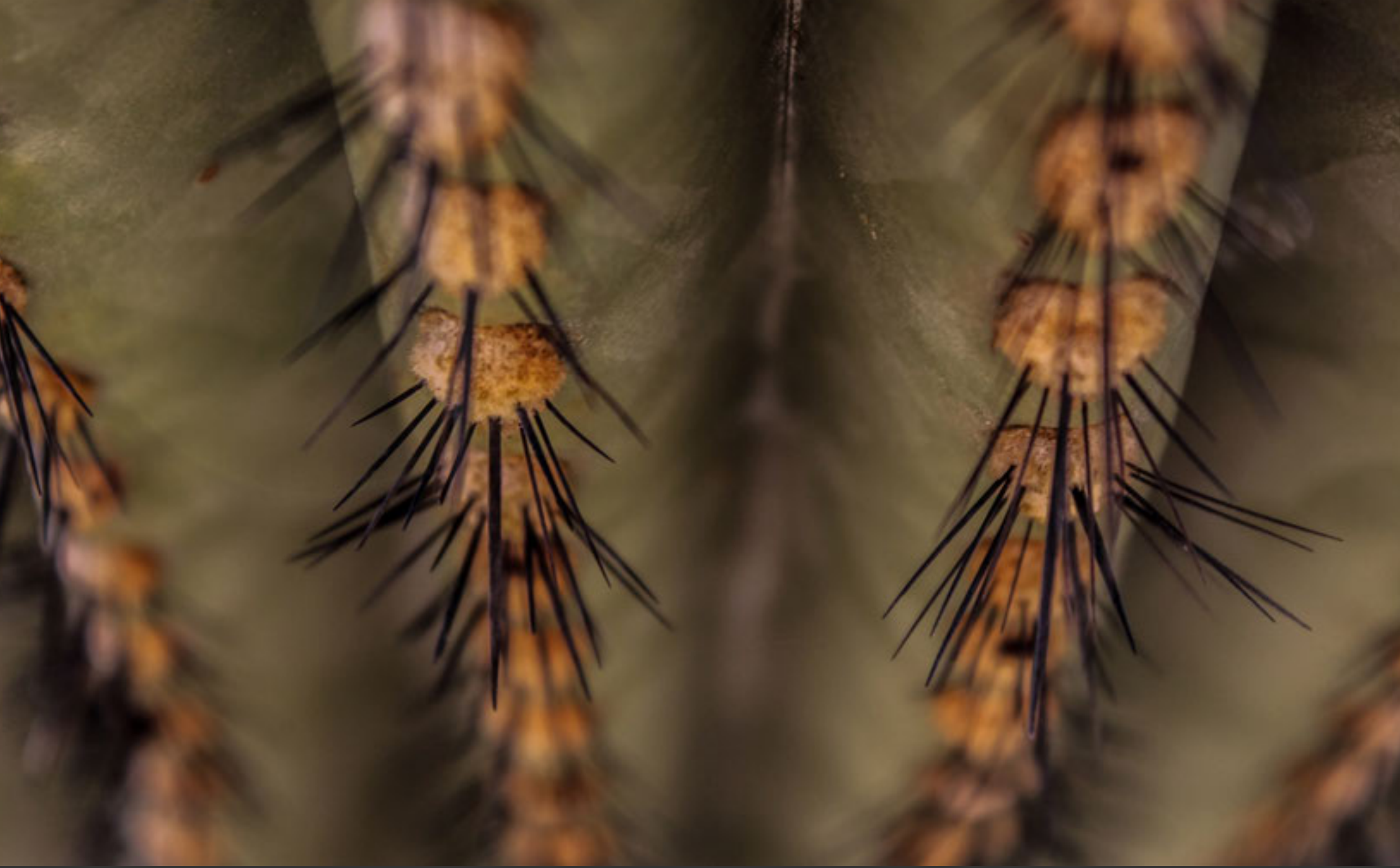
Saguaro Needles, Saguaro National Park