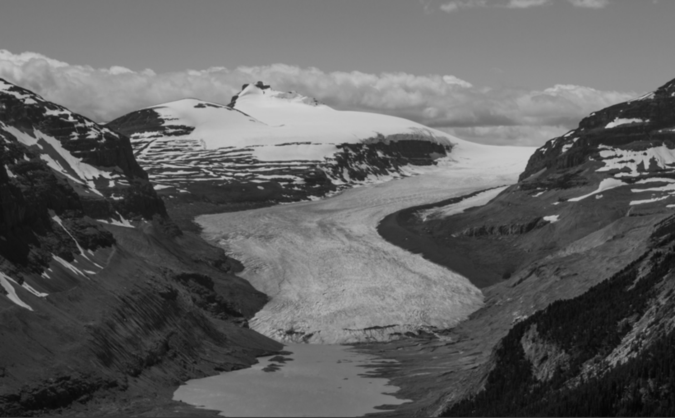
Saskatchewan Glacier, Canada